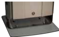
Free standing base kit (60 & 120 litre models only)