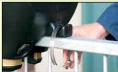
2 Ensure the buckle is located on the Tamtorque band, then thread the band through the railing and around the Kwik-Fix fixing lug.