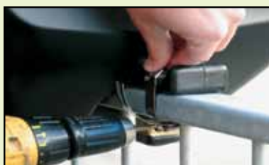
3 Locate the banding tongue to the buckle, then tighten the banding using a hand or power tool until the band is completely tight.