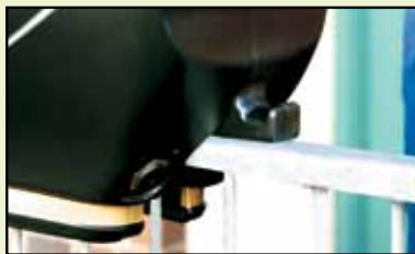
1 Locate planter onto the railing ensuring that the railing sits correctly inside the recess in the base of the planter.