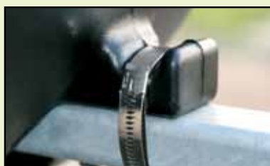
4 Finally push any excess banding through the buckle to achieve a neat and safe fixing.