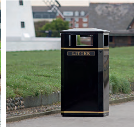
Invicta™ Litter Bin