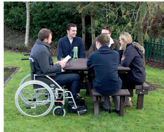
NEW Pembridge™ Picnic Table