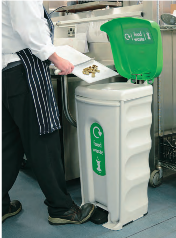
Nexus® Shuttle Food Waste Bin