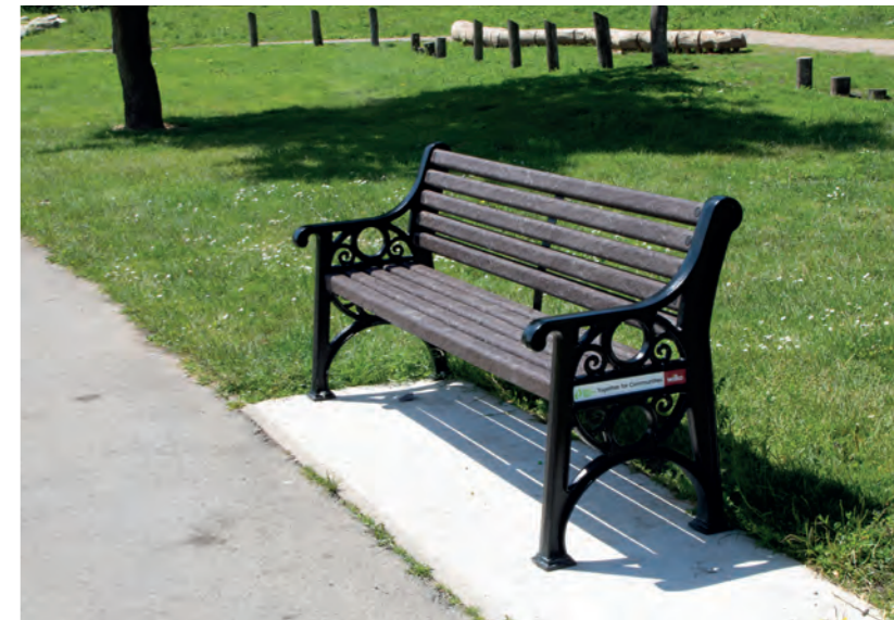
Lowther™ Seat with Brown Enviropol Slats