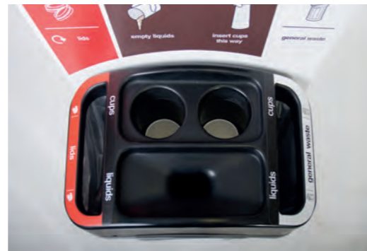
Eco Nexus Cup Recycling Station