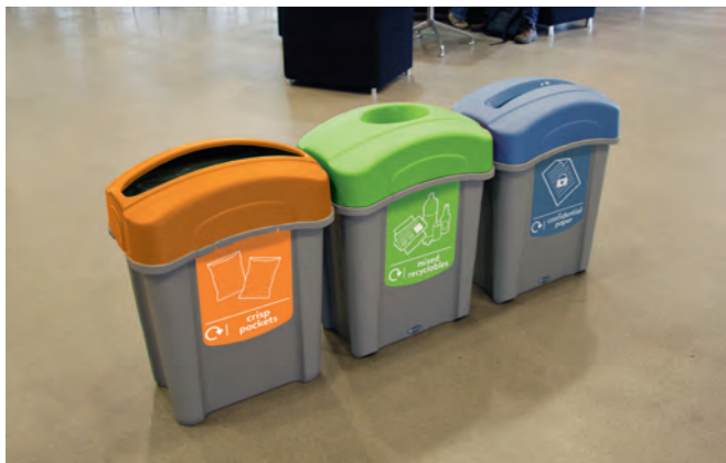
Eco Nexus® 60 Recycling Bin