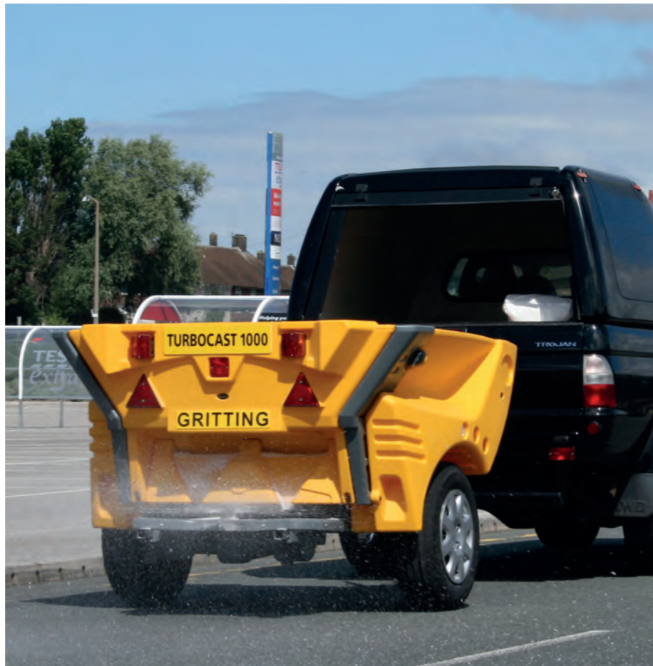
Turbocast 1000™ Towable Dual Action Grit/Salt Spreader