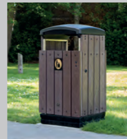
Enviropol™ 100 Litter Bin

To match the environmentally friendly aesthetic, Enviropol 100 Litter Bins were ordered for the community to dispose of their litter to help #KeepBlackpoolTidy.