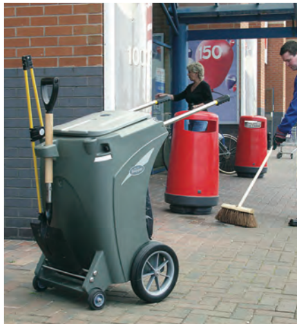
Skipper™ Orderly Barrow www.glasdon.com