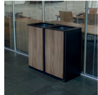
NEW Nexus® Style 170 Duo Recycling Bin