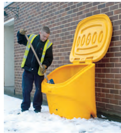
Nestor™ 400 Grit Bin