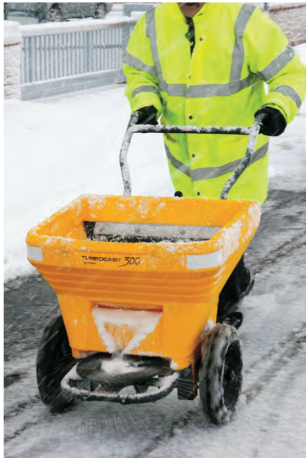
Turbocast 300™ Grit/Salt Broadcast Spreader