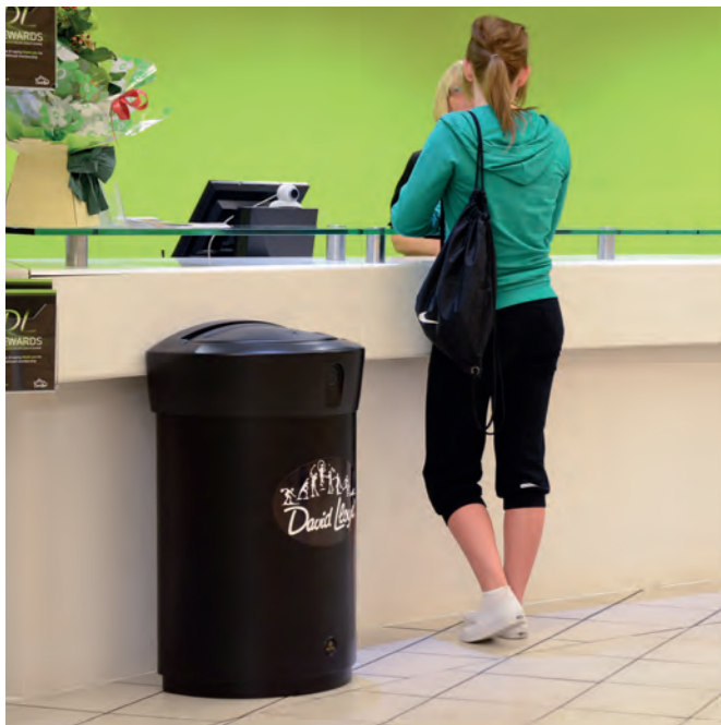
Envoy™ Litter Bin

We produce an extensive range of indoor litter bins made from highly durable materials to ensure a functional and long service life. Our collection of contemporary and stylish internal litter bins are ideal for inside most environments, complementing the surroundings.