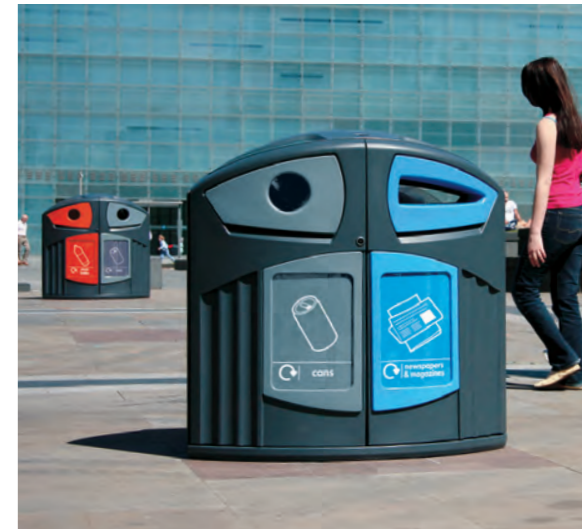
Nexus® 200 Recycling Bin