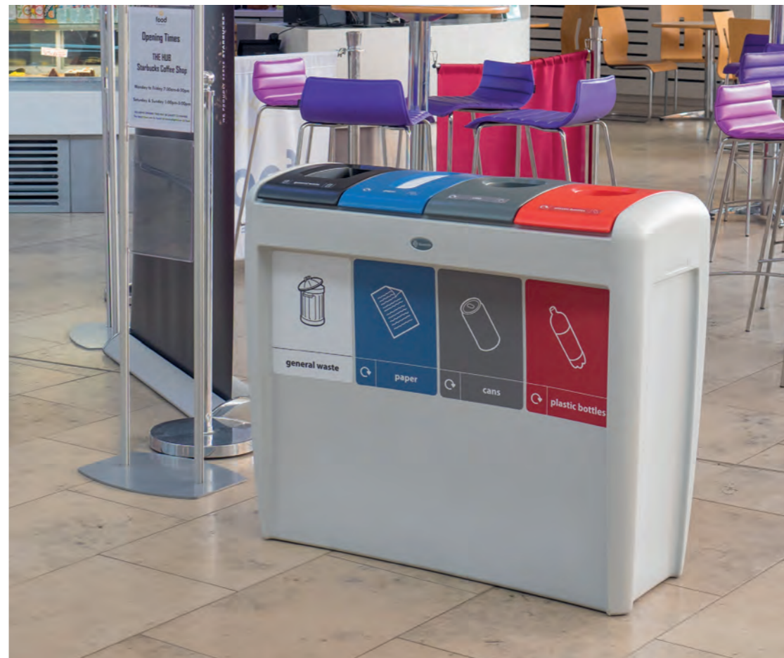
Nexus® Evolution Quad Recycling Bin

"What we have found is that our customers recycling needs are evolving and this product allows our customers to adapt to those needs."