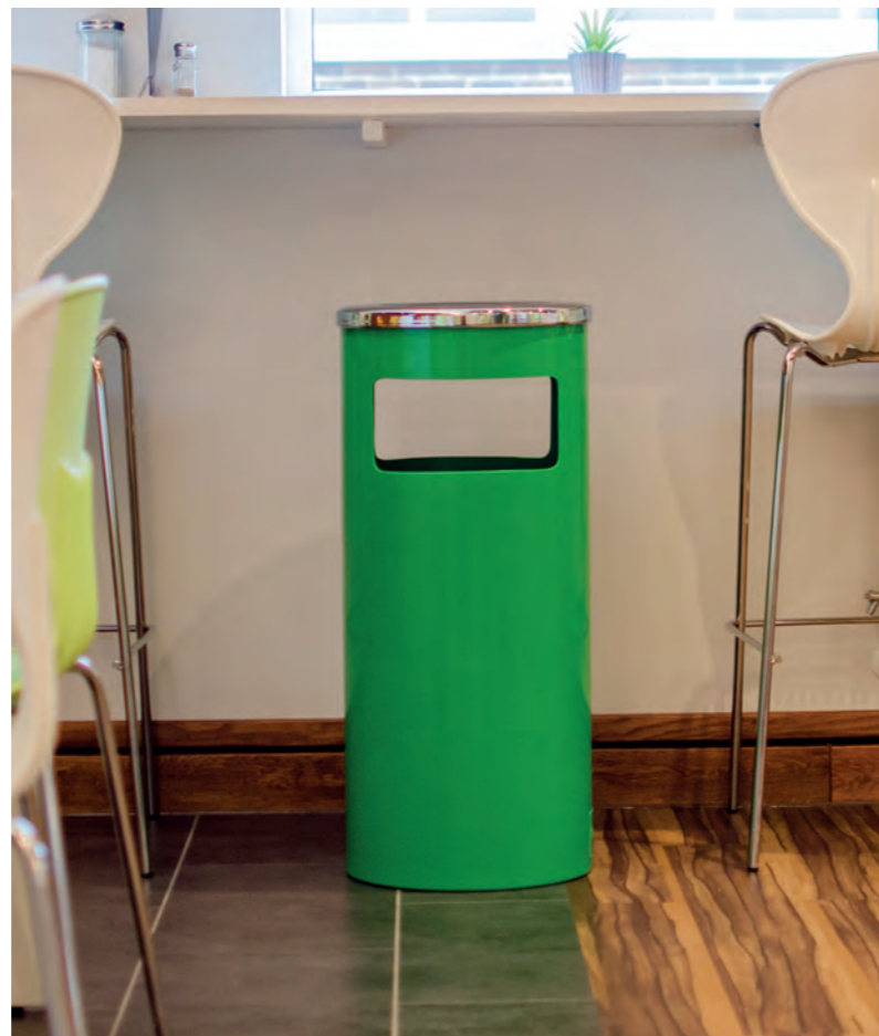
Tweed™ Litter Bin