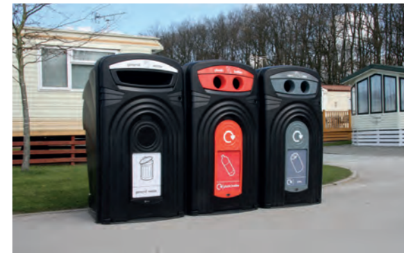
Nexus® 360 Recycling Bin www.glasdon.com