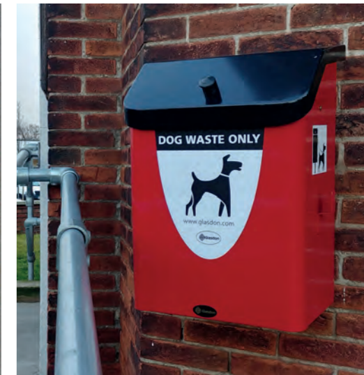
Metal Fido 35™ Dog Waste Bin