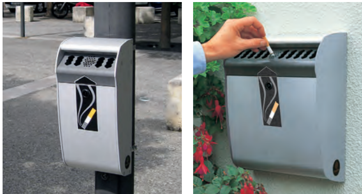
Ashmount™ Cigarette Bin (1.5 litre model) Ashmount™ Cigarette Bin (3 litre model)