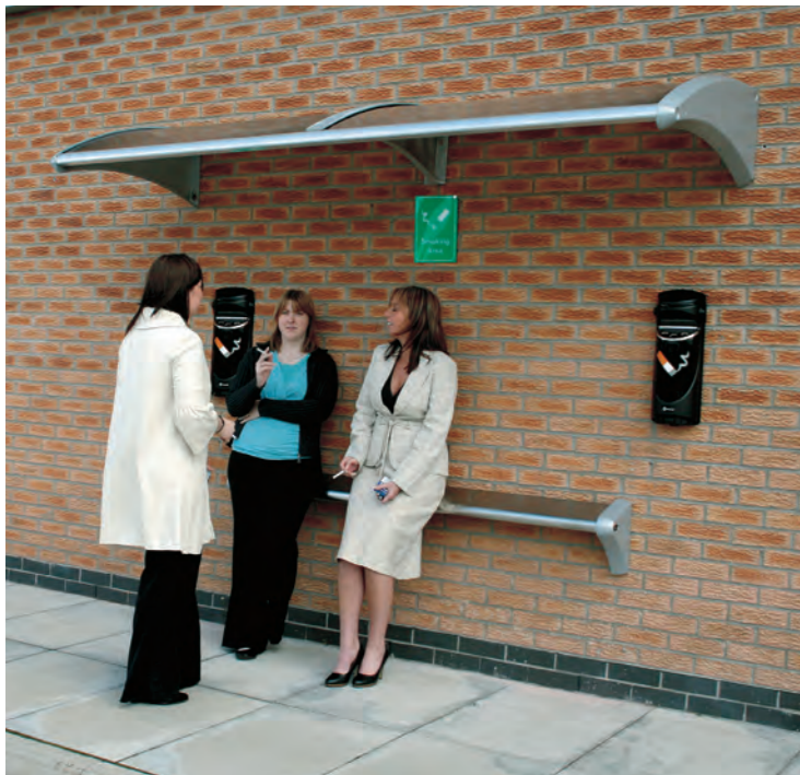
Carleton™ Smokers' Canopy

Glasdon have over 30 years' experience in the manufacturing of prefabricated canopies, shelters and commercial bike storage facilities.