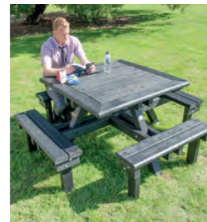
NEW Pembridge Picnic Table