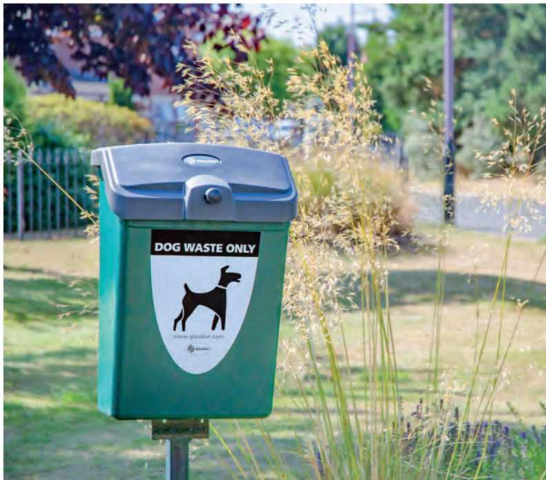
Fido 25™ Dog Waste Bin

To help keep pavements and open spaces clear of dog fouling, we produce a range of dog waste bins that are extremely strong and durable. Designed to be wall or post-mounted these dog waste bins are for outdoor use such as parks, public areas and leisure sites.