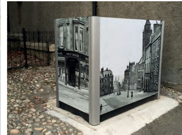
Visage™ Screen System