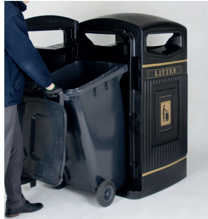
Glasdon Jubilee 240 Wheelie Bin Housing