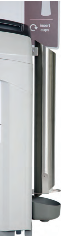
Centrum™ Cup Stacker 24 | www.glasdon.com

The Glasdon Cup Recycling Bin range has been designed to help you implement an efficient cup recycling programme and increase your cup recycling rates. Choose from our selection of specifically designed cup bins and cup recycling stations which feature liquid reservoirs and separate compartments for cups and lids.