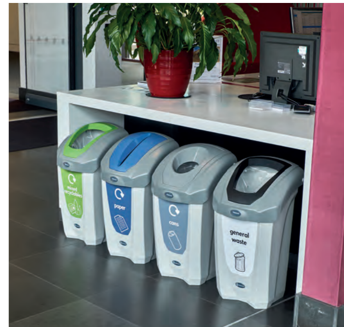
Nexus® 30 Recycling Bin www.glasdon.com