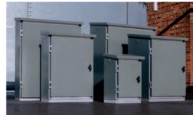
Citadel™ Cabinet Range

The Citadel™ range offers a cost-effective solution to the secure housing of equipment for a variety of applications. Available in five industry standard sizes, the cabinets can be supplied with ventilation or without for IP56 rated protection.