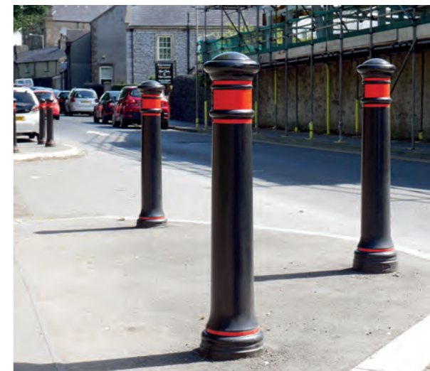
Glasdon Manchester™ Bollard

Featuring a slim footprint, the Cyclmaster is designed so it can be situated in narrow spaces such as pavements, segregated cycle islands, or bolted into a concrete foundation without taking up valuable space for cyclists or pedestrians.