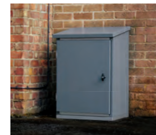
Citadel™ 659 Cabinet