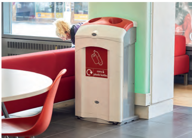
Nexus® 100 Recycling Bin