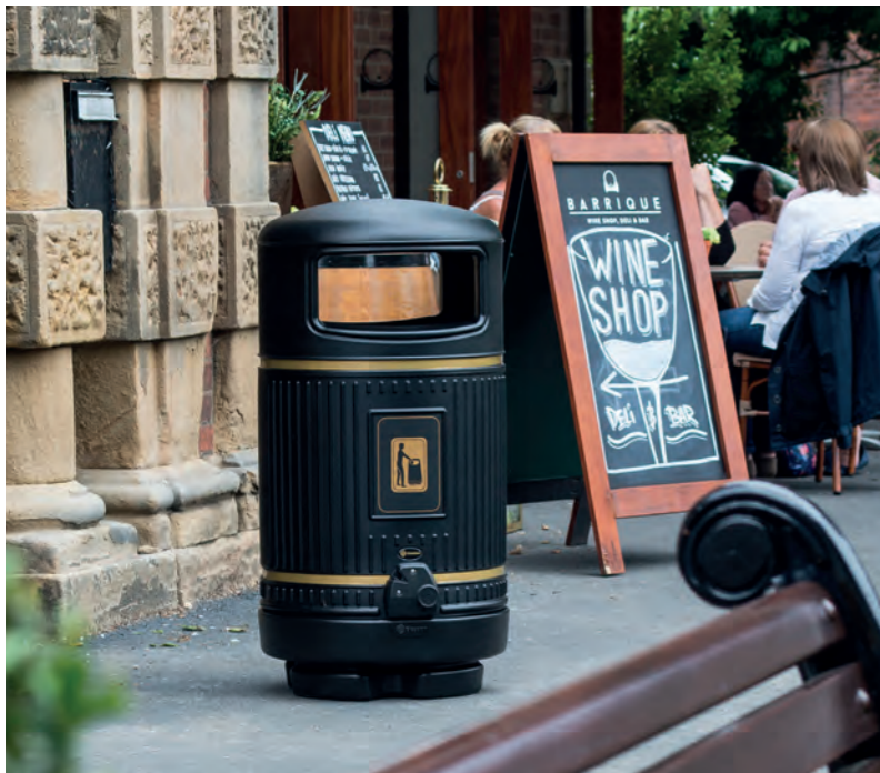
Topsy Royale™ Litter Bin

We have a massive selection of litter bins in a vast array of colours and capacities, you will be sure to find the correct one for your purpose. All our litter bins are easy to clean and never need painting, giving you an attractive and highly functional waste container for many years.