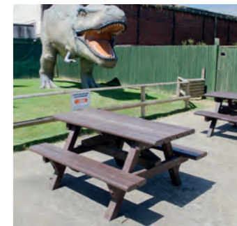
Clifton™ Picnic Table