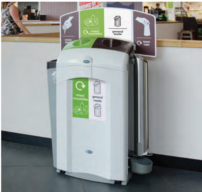
Nexus® 100 Duo Recycling Station