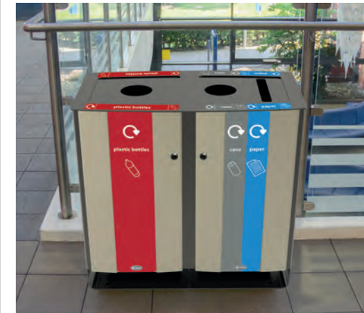
Electra™ 170 Trio Recycling Bin