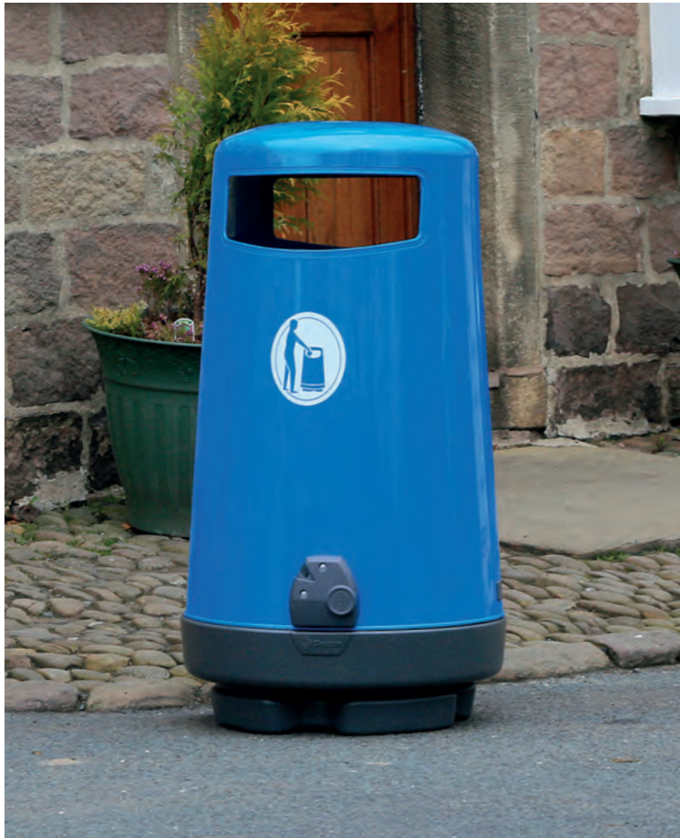
Topsy 2000™ Litter Bin