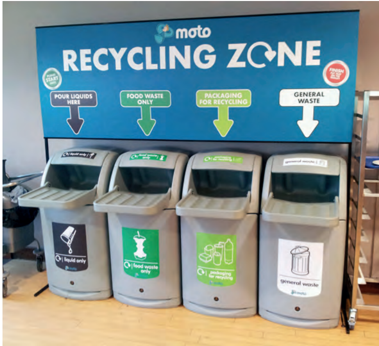
Combo™ Tray Shelf Catering Waste Bin

Our Food Waste Recycling Bins are ideal for kitchens, canteens, food courts and any other areas where food is prepared or consumed. The easy to use bins make food waste disposal hygienic and efficient and they are a good way of handling high volumes of food waste.