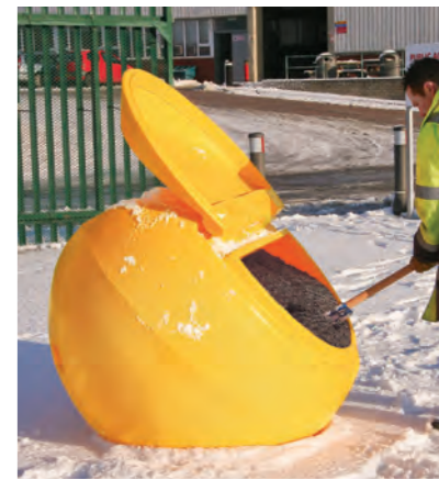
Orbistor™ Grit Bin