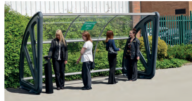
Aero™ Smoking Shelter