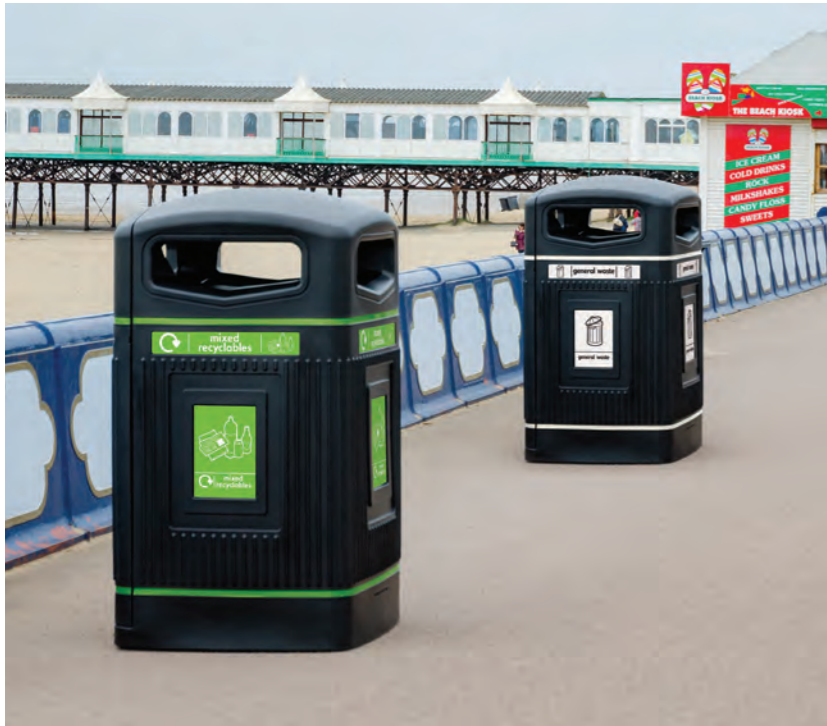
Glasdon Jubilee™ 240 Wheelie Bin Housing

These outdoor wheelie bin screens and housing systems are designed for both on-street locations and outdoor recycling centre usage within workplaces, schools, restaurants and bring sites. Glasdon robust, screen systems are ideal for hiding unsightly large capacity outdoor wheelie bins, creating a clear, attractive recycling station.