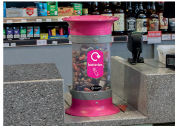
C-Thru™ 5L Battery Recycling Bin