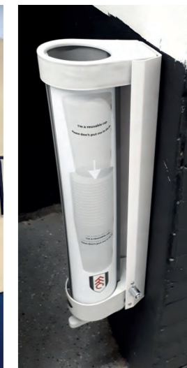
Nexus™ Cup Stacker www.glasdon.com | 25