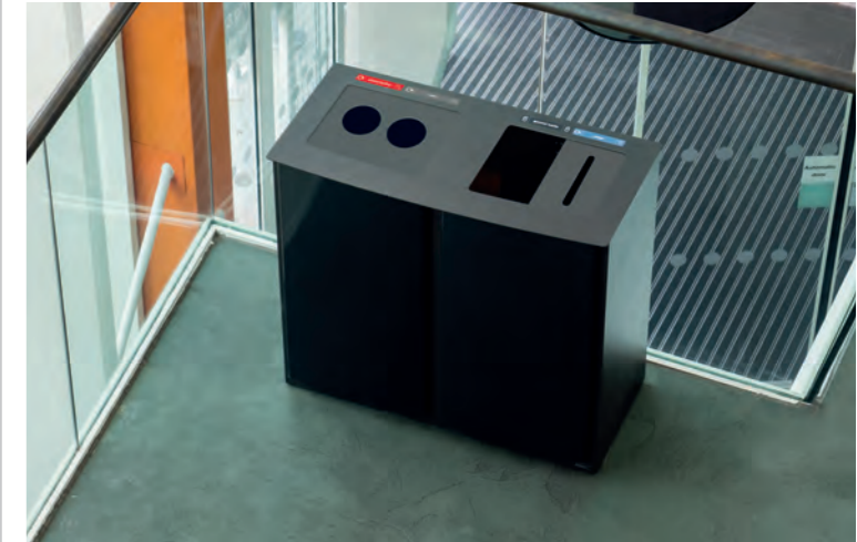
NEW Nexus® Style 170 Quad Recycling Bin