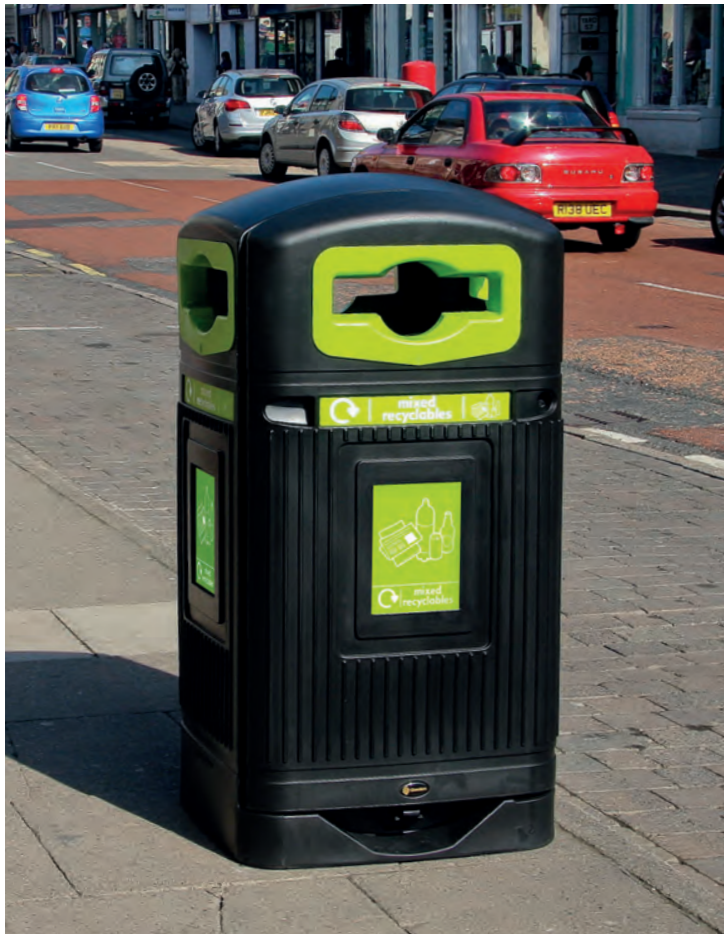
Glasdon Jubilee™ 110 Recycling Bin