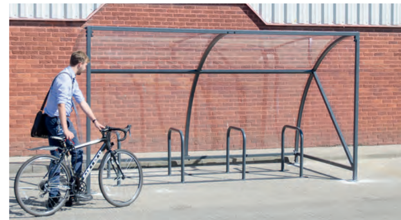
Echelon™ Cycle Shelter www.glasdon.com | 39