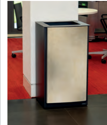
NEW Nexus® Style 85 Recycling Bin