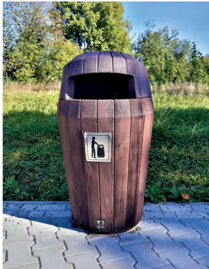
Sherwood™ Litter Bin