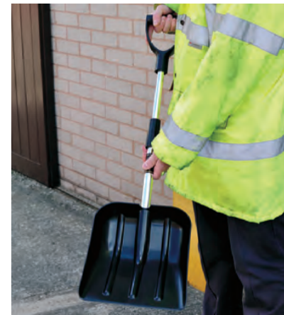
Snospade™ Snow Shovel