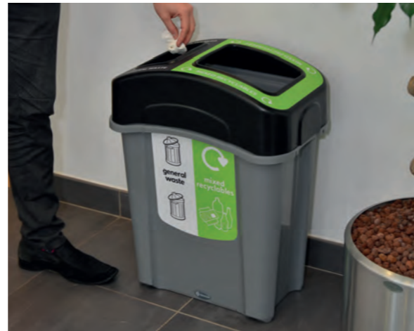
Eco Nexus™ Duo Recycling Bin