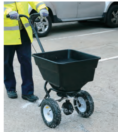
Icemaster 50™ Salt Spreader