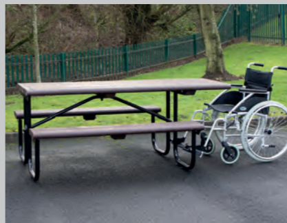
NEW Bowland™ Picnic Table

The Bowland Picnic Table offers a contemporary twist on picnic table design. Combining a curved Armortec® coated mild steel frame with a choice of seven different coloured, environmentally-friendly material slats, this picnic table offers strength, style and sustainability.