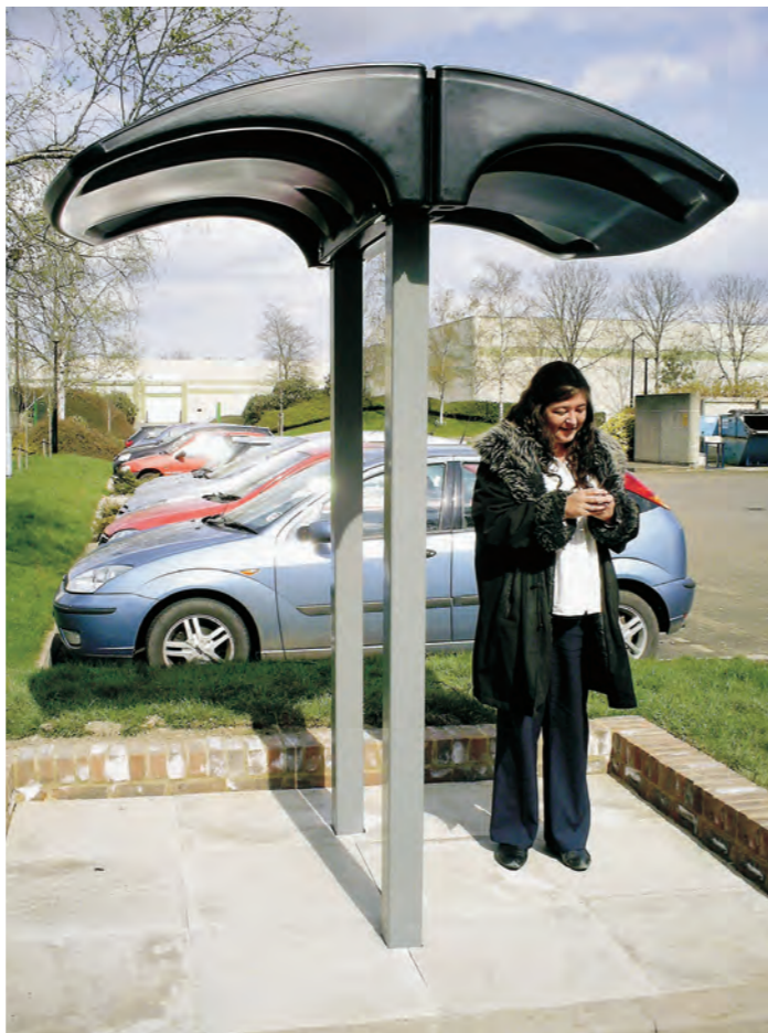
Eclipse™ Back-to-Back Canopy