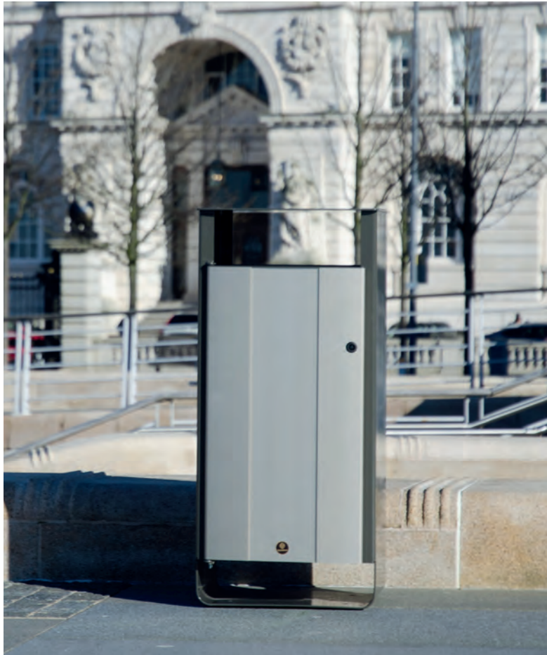
Electra™ Litter Bin