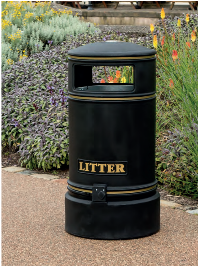
Topsy Jubilee™ Litter Bin