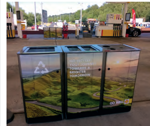
Electra™ 85 Recycling Bin and Electra™ 170 Duo Recycling Bin