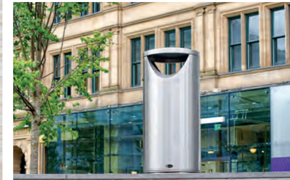
Centrum™ Litter Bin