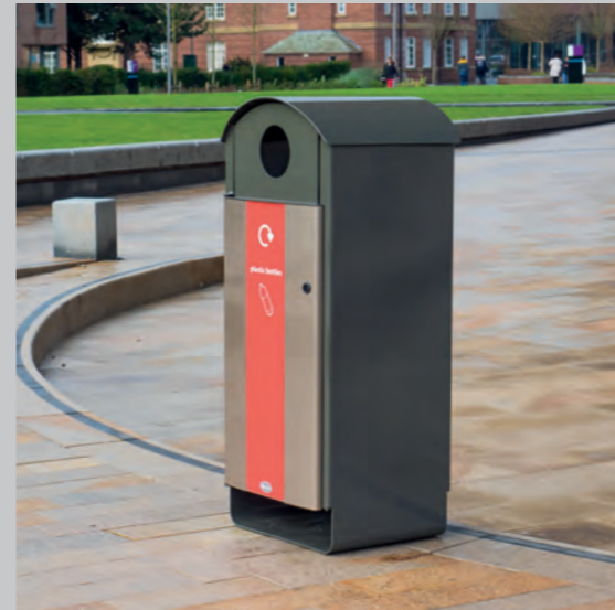
NEW Electra™ Curve 85 Recycling Bin

The Electra Curve range also features recycling bins with a choice of 4 dedicated aperture panels available to suit your requirements.