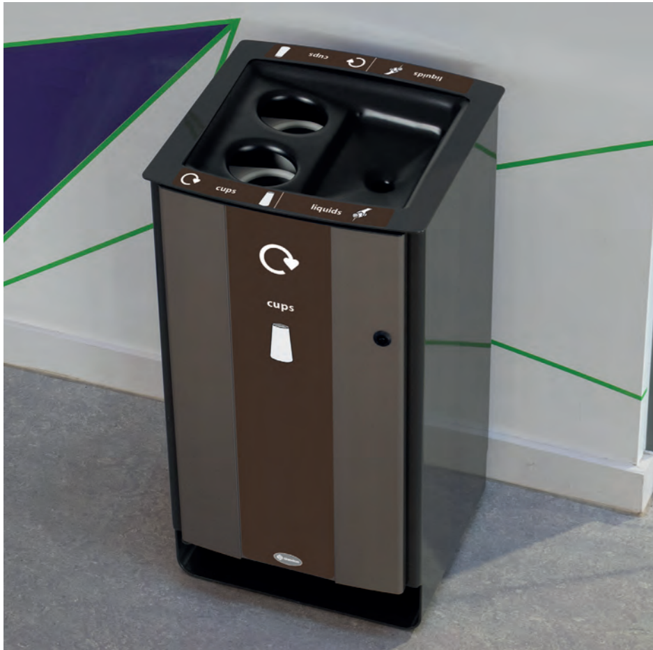
NEW Electra™ Cup Recycling Bin