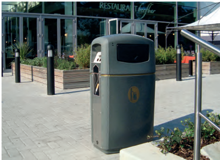
Integro™ Cigarette & Litter Bin