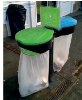
Orbis™ Sack Holder