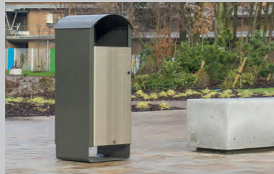
Electra™ Curve 85 Litter Bin

An extensive variety of optional graphics are available for the Electra Curve, as well as complete personalisation, allowing you to tailor the look of the bin to suit your exact requirements.