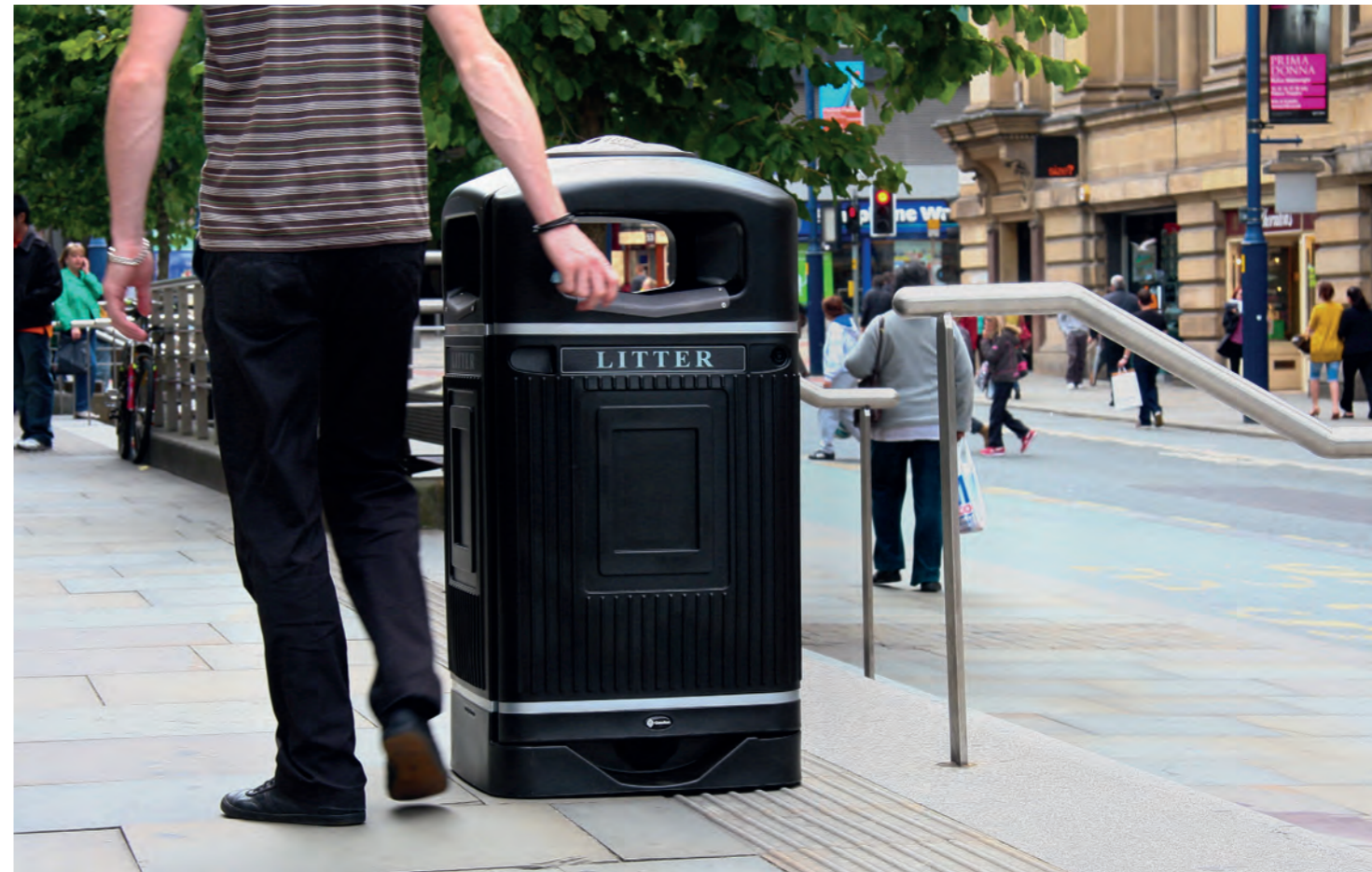
Glasdon Jubilee™ 110 Litter Bin www.glasdon.com