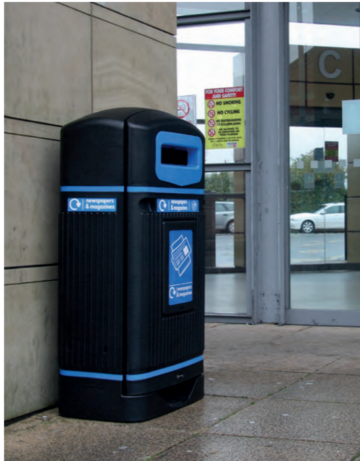
Streamline Jubilee™ Recycling Bin