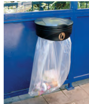
Orbis Sack Holder