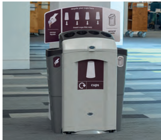
Nexus® 100 Cup Recycling Station