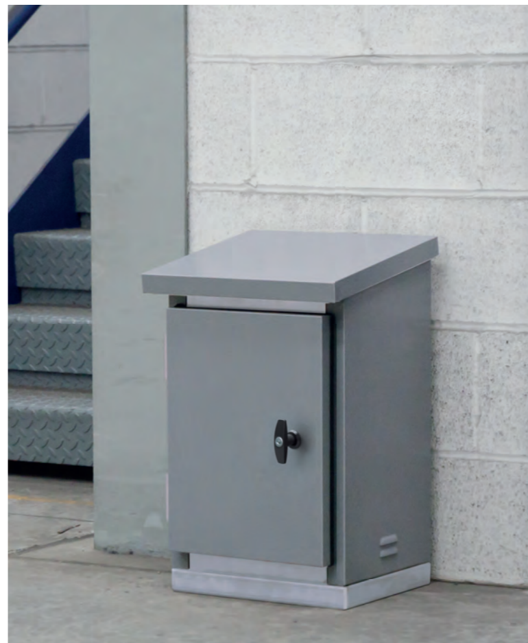
Citadel™ 336 Cabinet