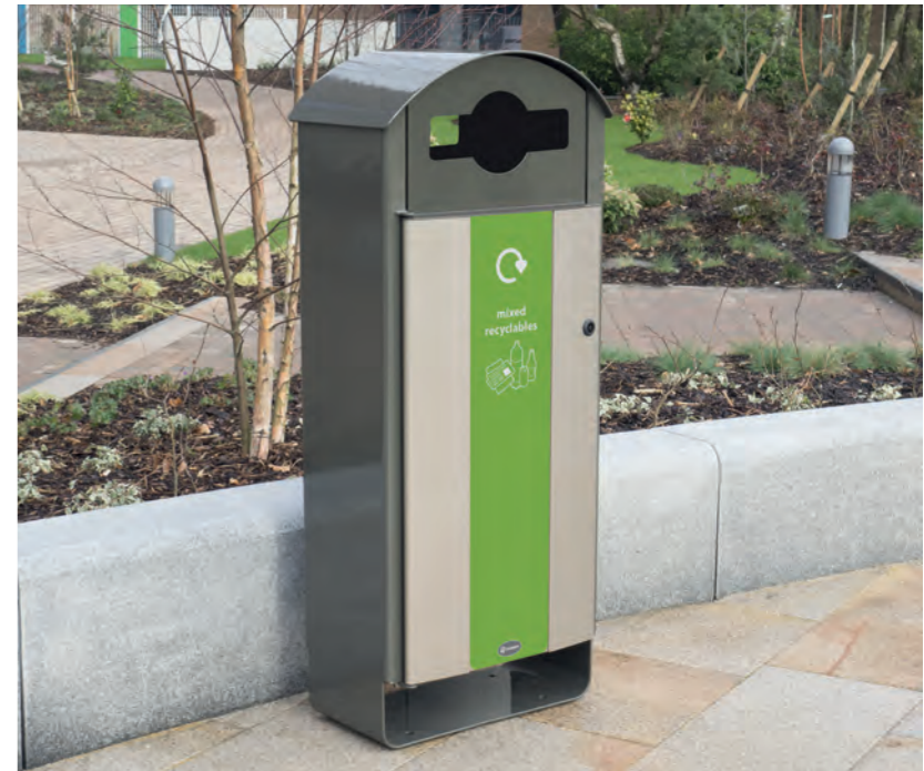
NEW Electra™ Curve 60 Recycling Bin

We produce an extensive range of outdoor recycling bins of the highest quality, in both traditional and contemporary designs. All of our recycling containers are designed to be hard-wearing and long-lasting and feature easily identifiable graphics to make recycling easy.