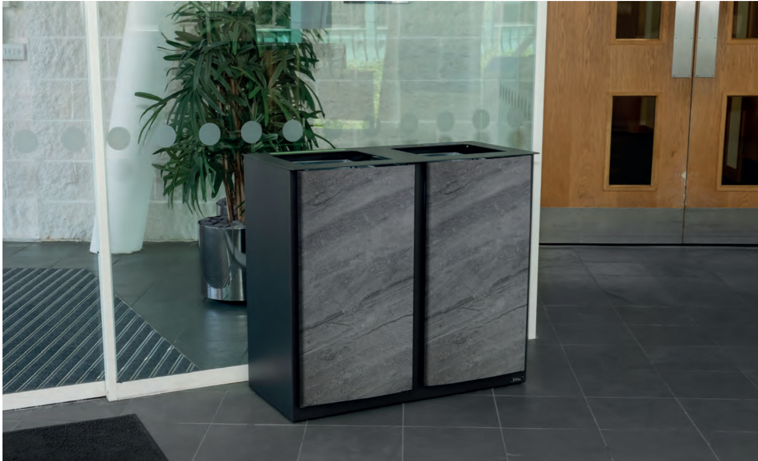
NEW Nexus® Style 170 Trio Recycling Bin