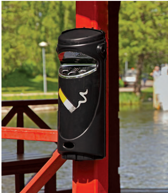
Ashmount SG™ Cigarette Bin

We're here to help you keep cigarette waste under control on your premises, with a wide range of quality, hard wearing smoking bins. The Glasdon collection offers everything from free standing ashtrays and cigarette bins to wall mounted ashtrays.