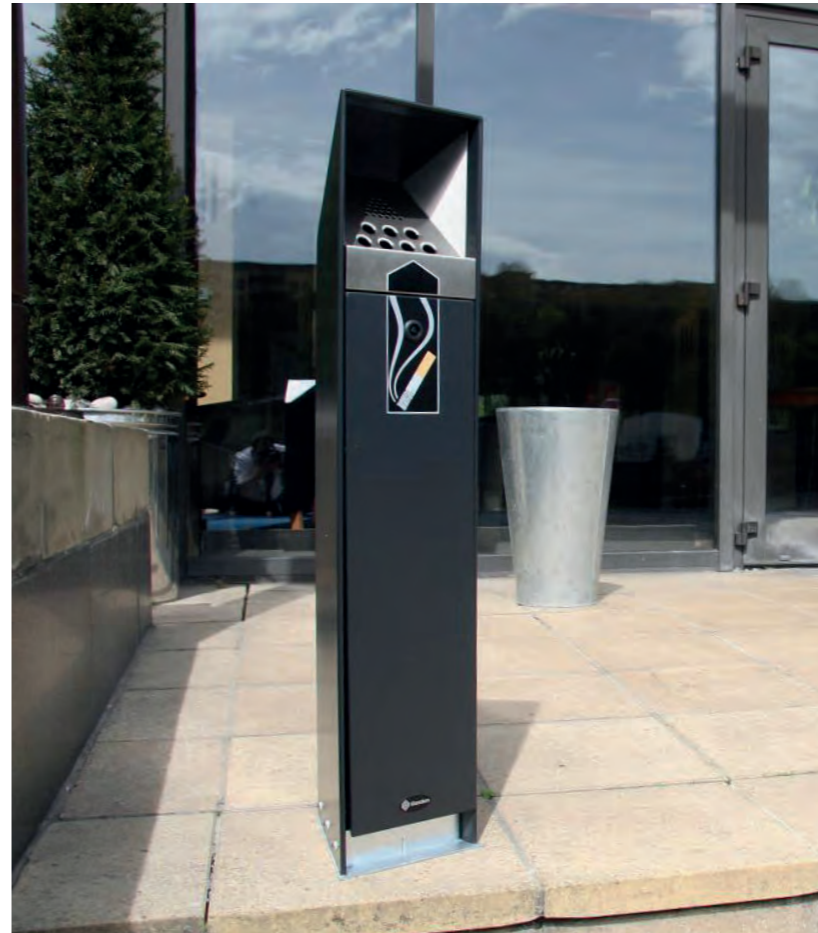
Ashguard™ Cigarette Bin