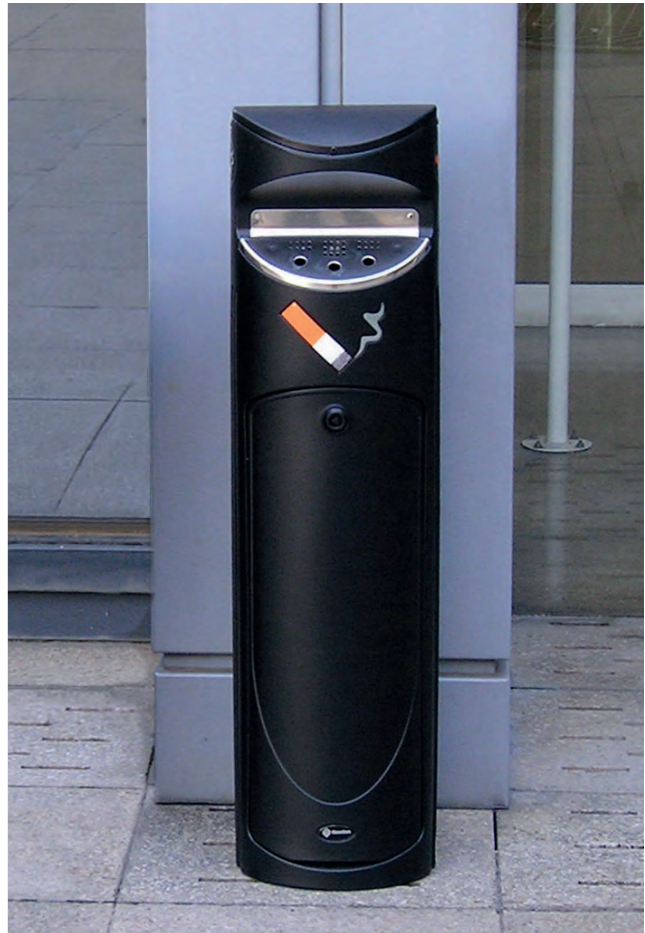
Ashguard SG™ Cigarette Bin www.glasdon.com | 35