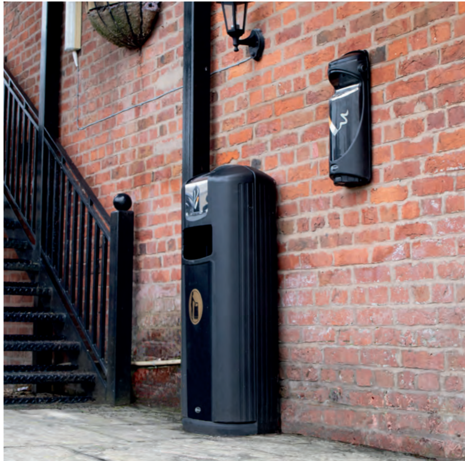
Integro City™ Cigarette & Litter Bin and Ashmount SG Cigarette Bin