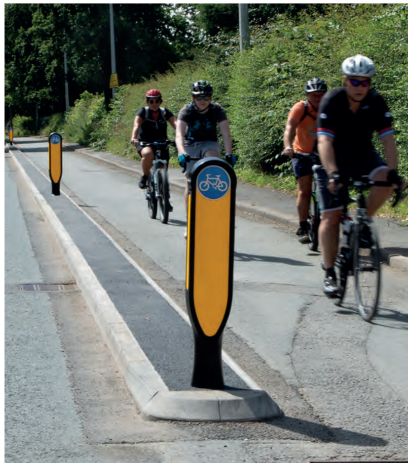
NEW Cyclmaster™ Bollard