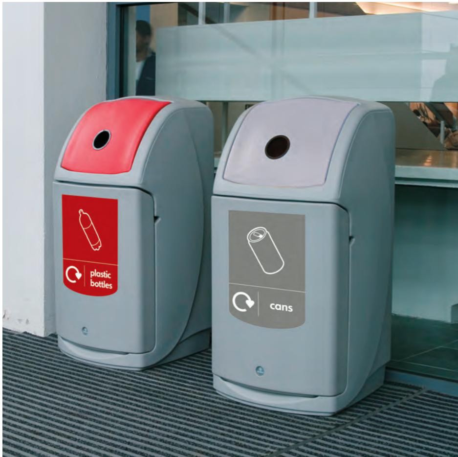
Nexus™ 140 Recycling Bin