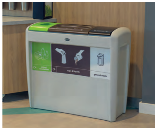
NEW Nexus® Evolution Cup Recycling Station