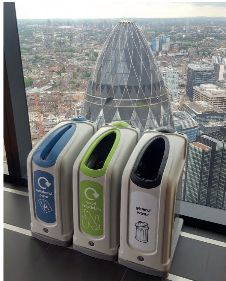
Nexus® 50 Recycling Bin