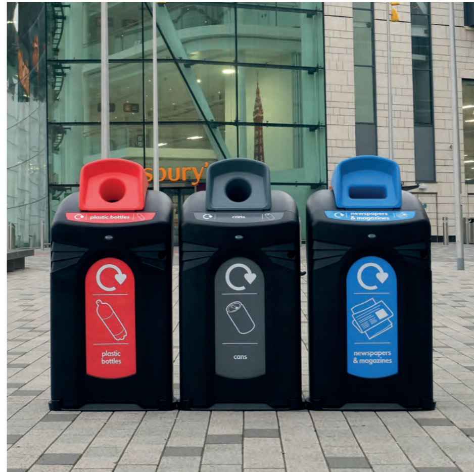
Nexus® City 240 Recycling Bin