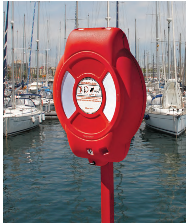
Guardian™ Lifebuoy Housing