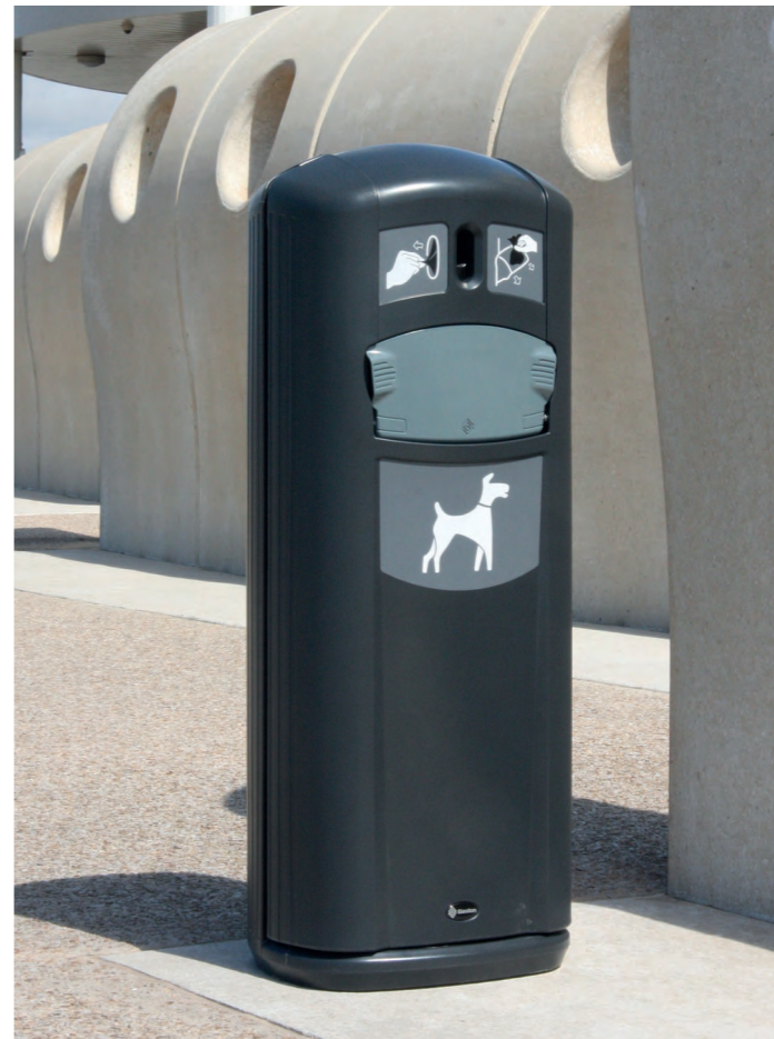
Retriever City™ Dog Waste Bin