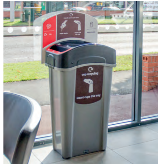
Eco Nexus™ Cup Recycling Station