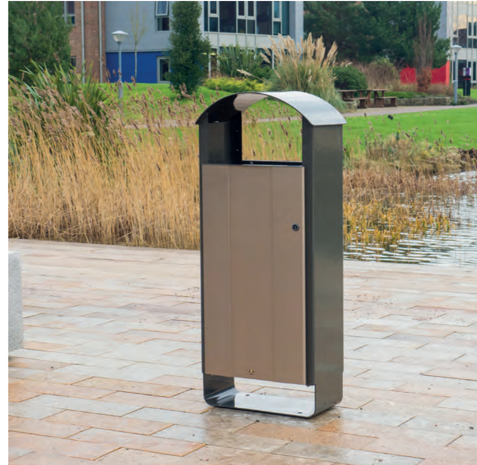
NEW Electra™ Curve 60 Litter Bin