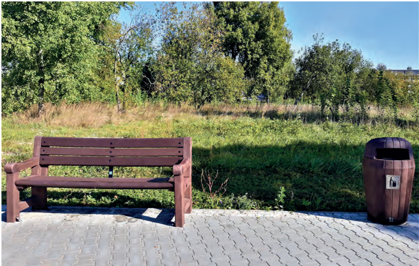
Elwood™ Seat and Sherwood™ Hooded Litter Bin