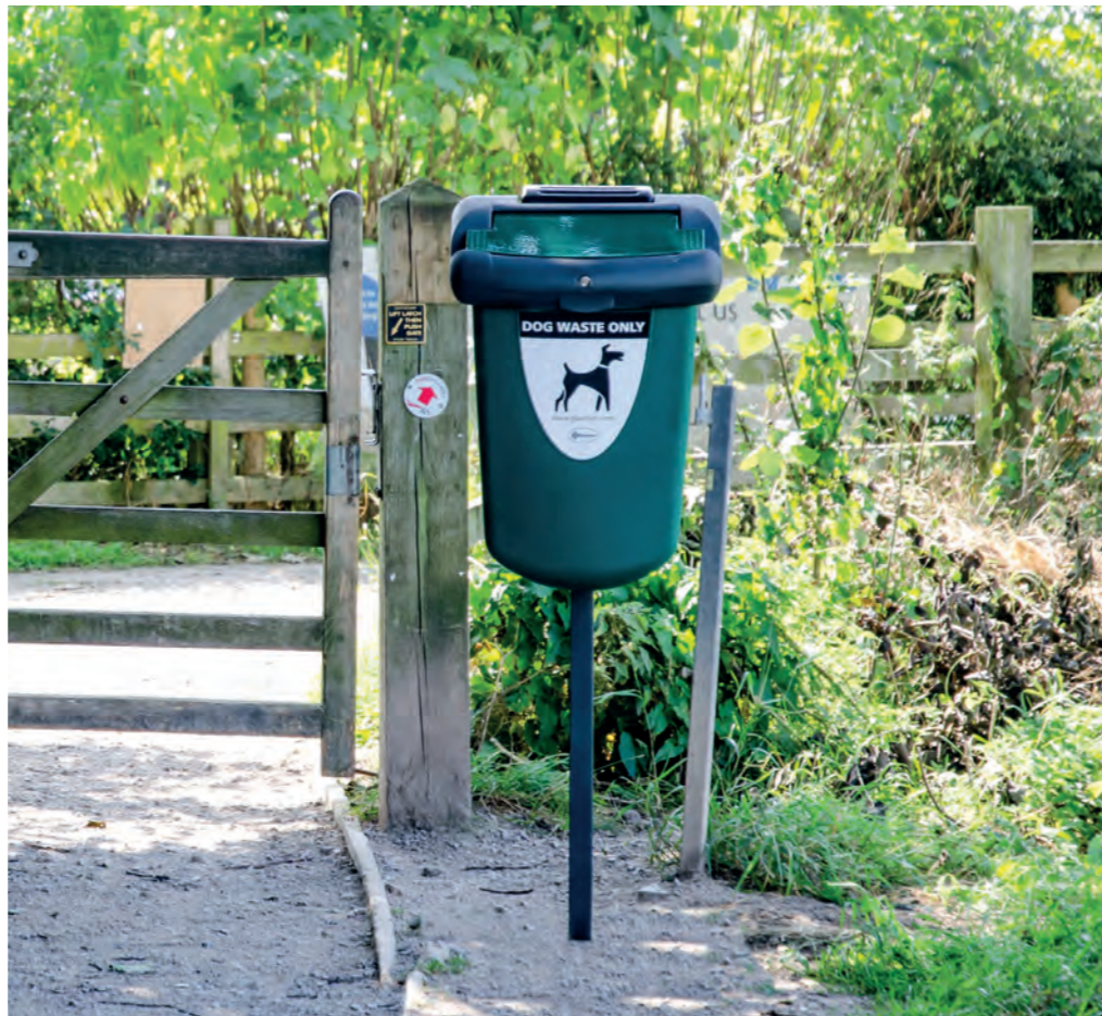
Retriever 35™ Dog Waste Bin