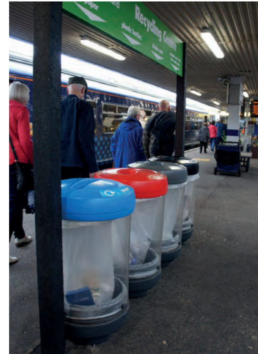
C-Thru™ 180 Recycling Bin

We have a selection of recycling units that are ideal for use with transparent sacks to enable maximum visibility of the contents deposited to help avoid the risk of cross-contamination.