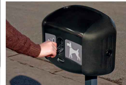
Retriever City™ Sack Dispenser www.glasdon.com