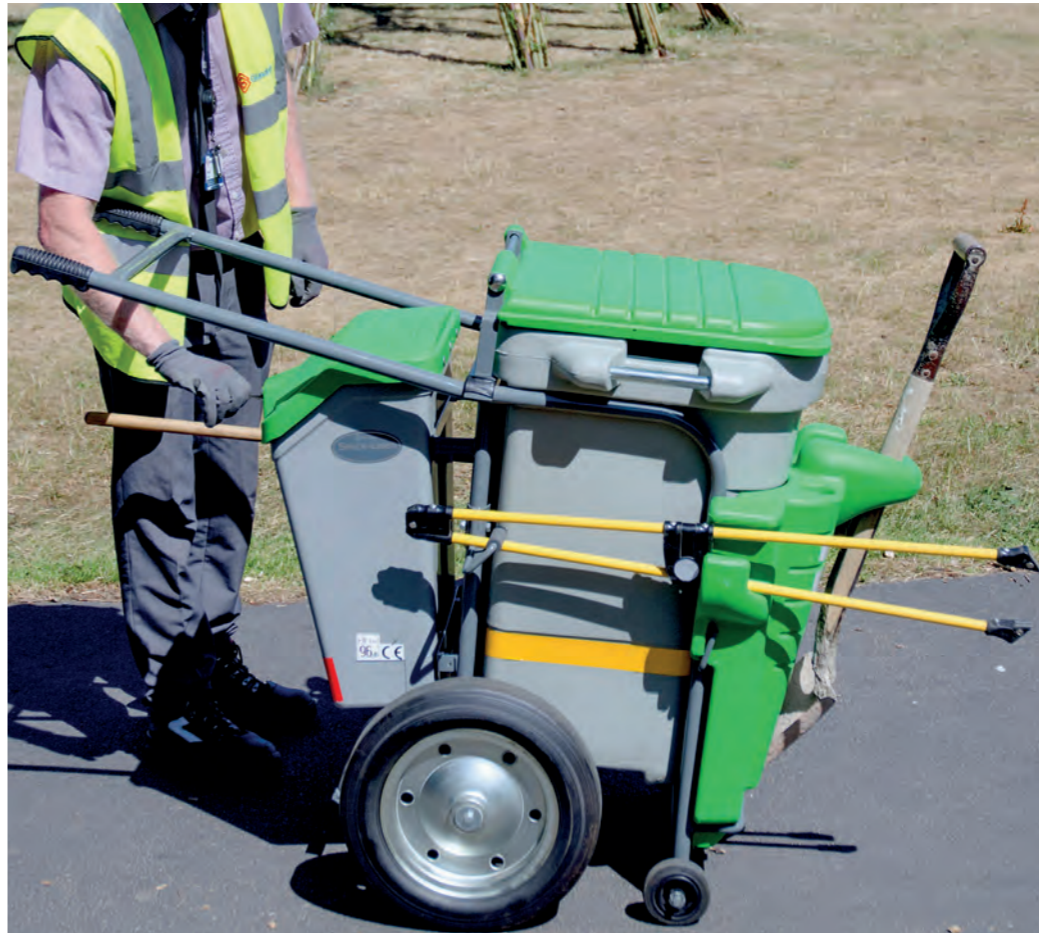
Space-Liner™ Orderly Barrow (Single Model)