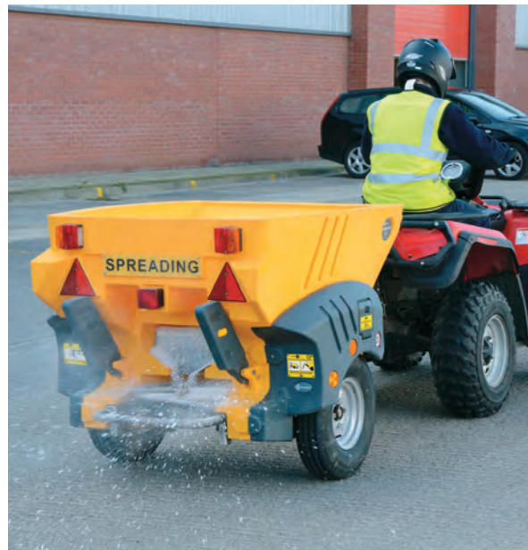
Turbocast 800™ Towable Dual Action Grit/Salt Spreader

Reduce the risk of accidents during the colder months with Glasdon winter safety equipment. We offer storage bins for grit salt or ice melt, manual and towable spreading equipment and a wide selection of accessories, to help ensure your site is prepared for ice and snow.