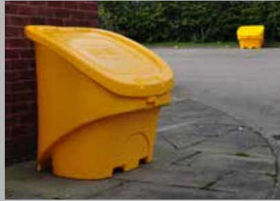
Nestor™ 400 Grit Bin

Glasdon can provide you with the right tools for keeping your staff and visitors safe during the winter months. We offer a range of high quality grit bins, towable and manual grit/salt spreaders and snow removal equipment.