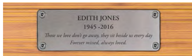
Stainless steel commemorative plaque.

Talk to us about your requirements today. Call 01253 600410 or via Live Chat online.