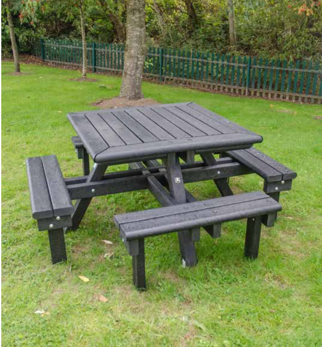
Black Enviropol model