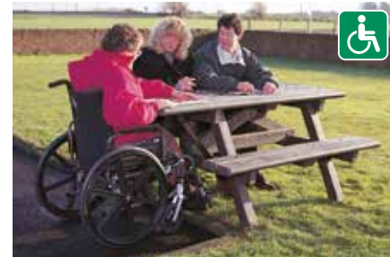
Wheelchair access model