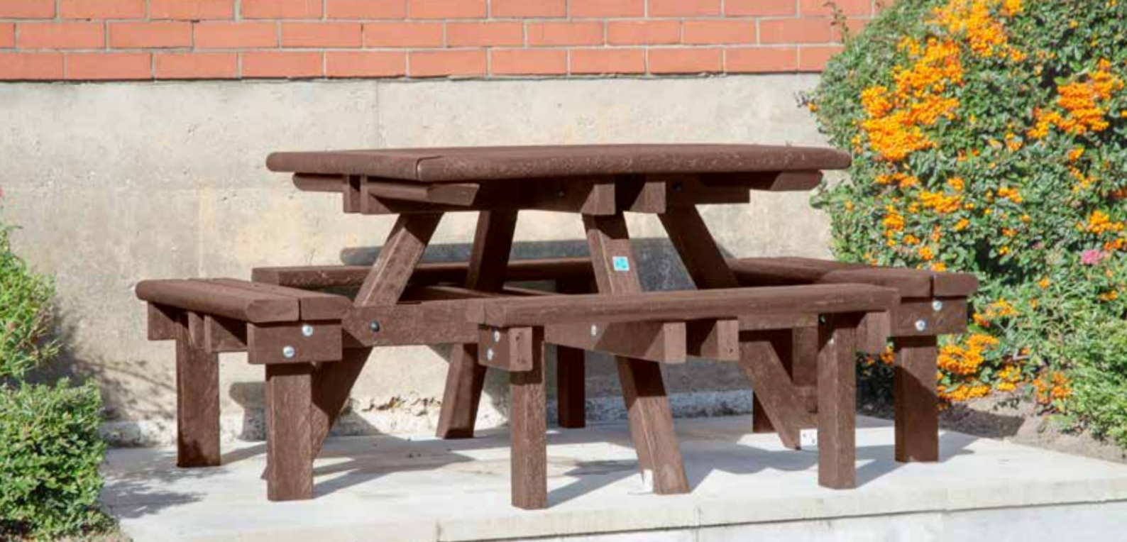
Brown Enviropol model