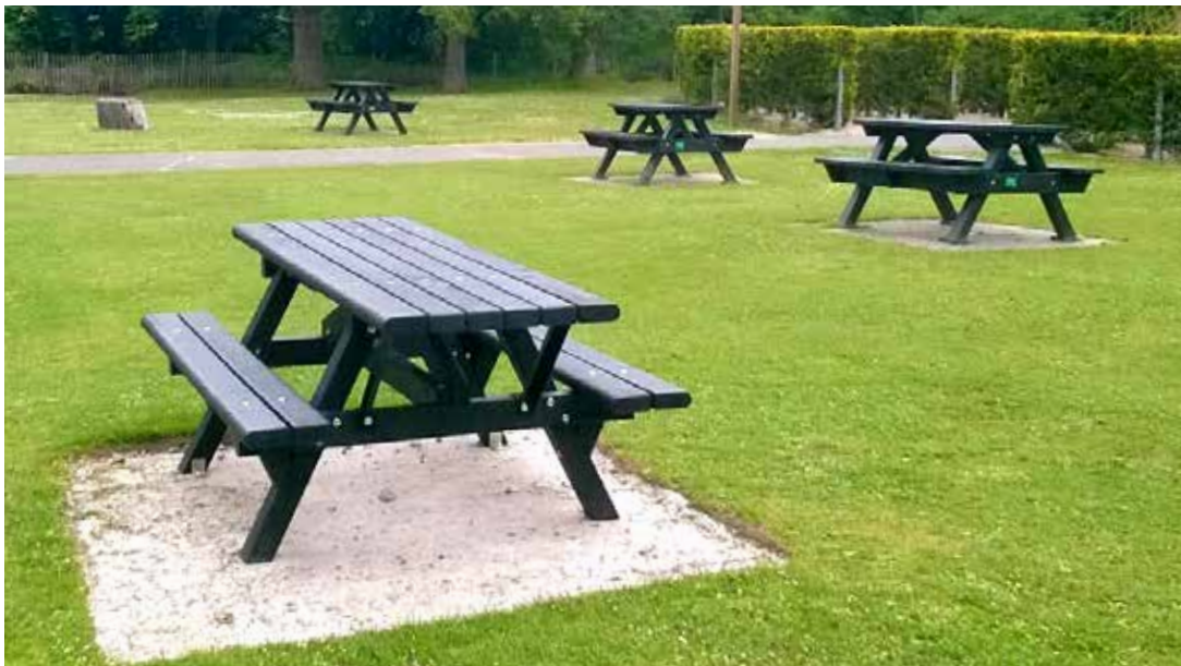
Black Enviropol model