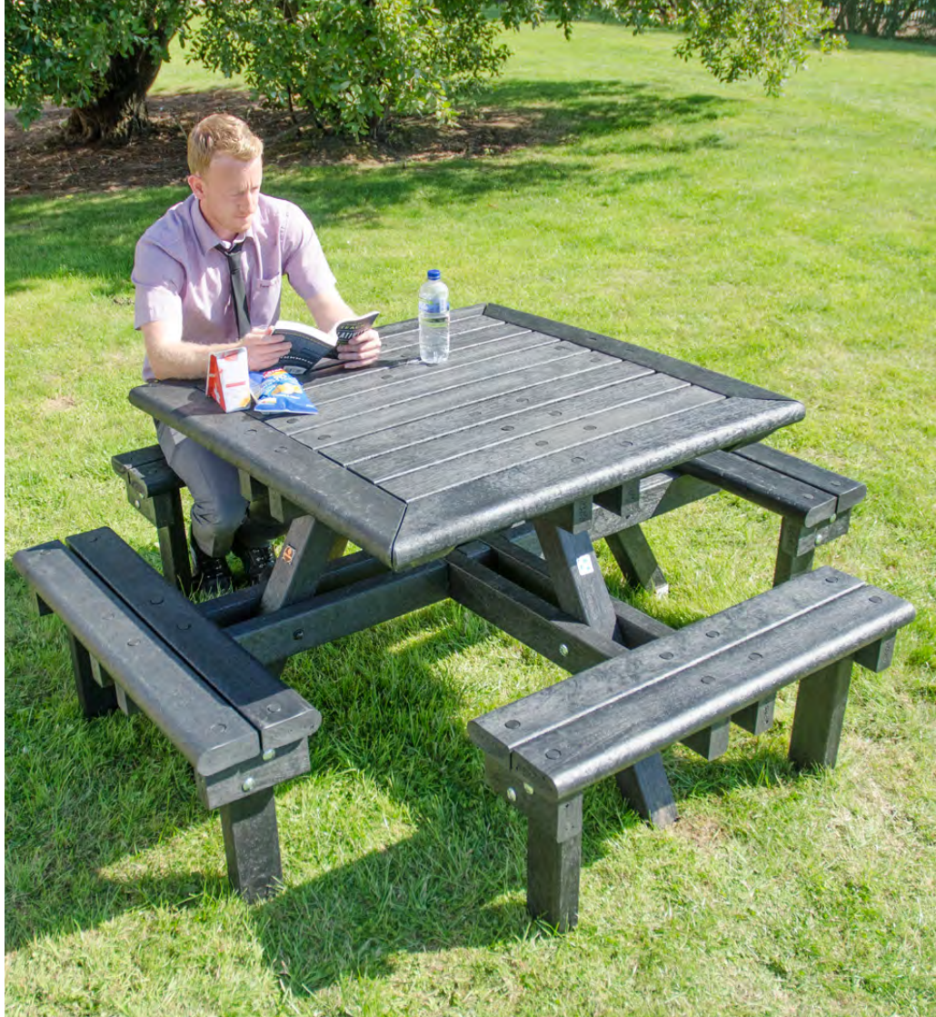
Black Enviropol model