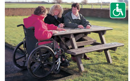
Wheelchair access model