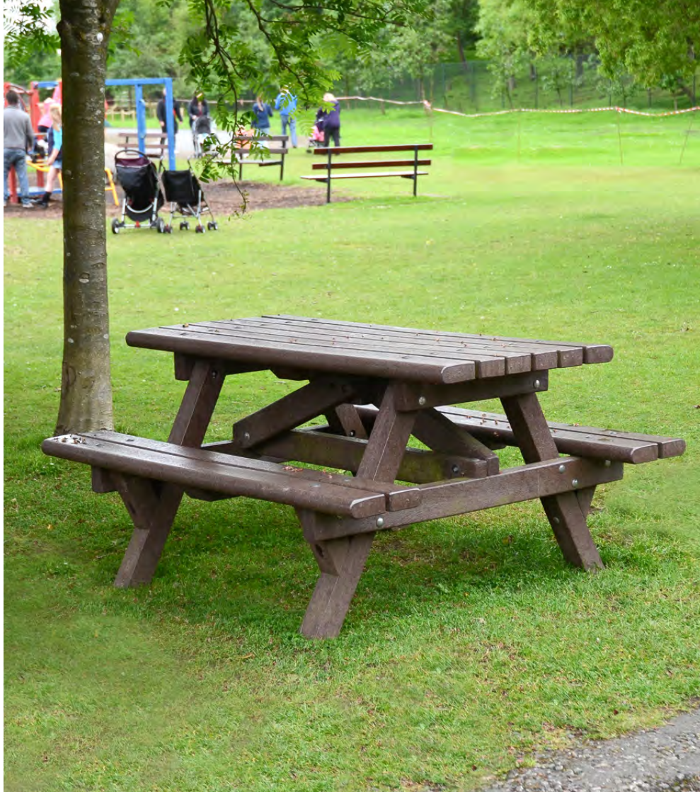
Brown Enviropol model