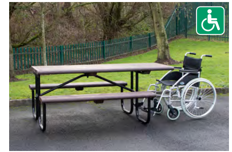
Wheelchair access model