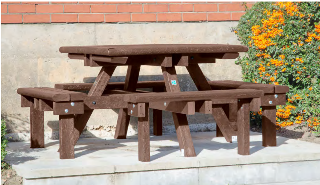
Brown Enviropol model