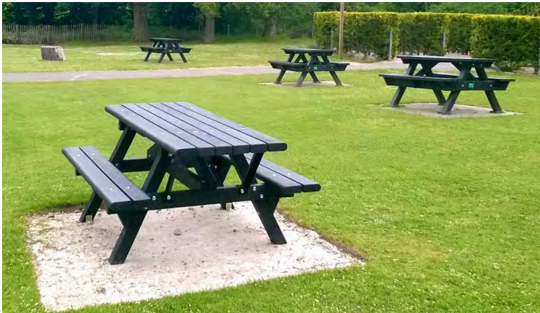
Black Enviropol model