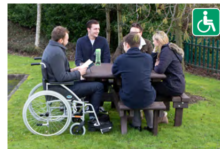
Wheelchair access model