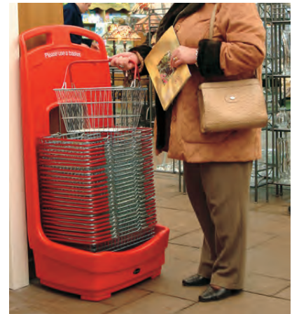
Mobile Basket Buddy™ Storage Unit