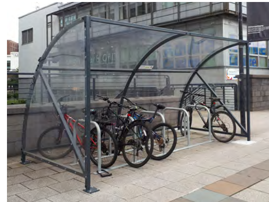
NEW Echelon™ Cycle Shelter