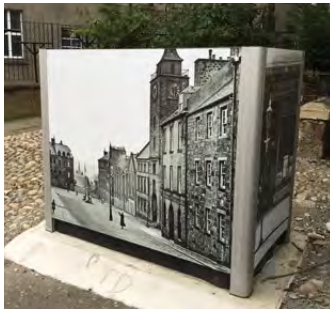
Visage™ Screen System

All of our recycling containers are designed to be hard-wearing and long-lasting and feature easily identifiable graphics to make recycling easy.