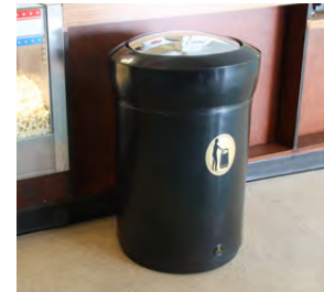
Statesman™ Litter Bin