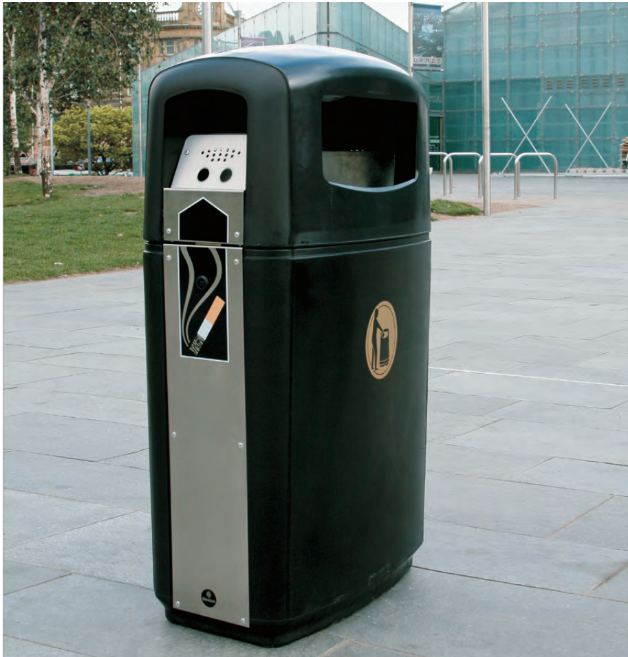
Integro™ Cigarette & Litter Bin