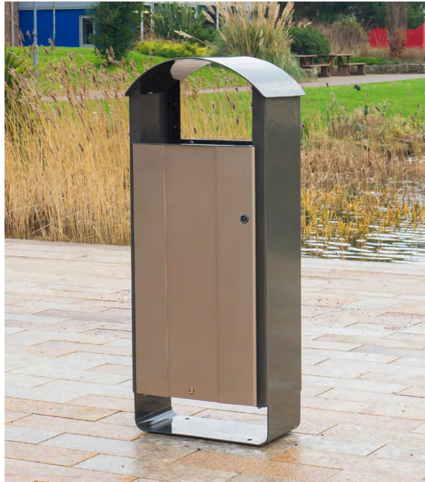
NEW Electra™ Curve 60 Litter Bin