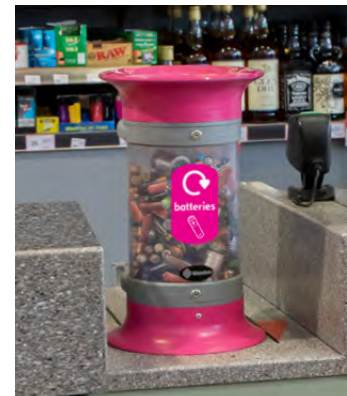
C-Thru™ Recycling Bin Range