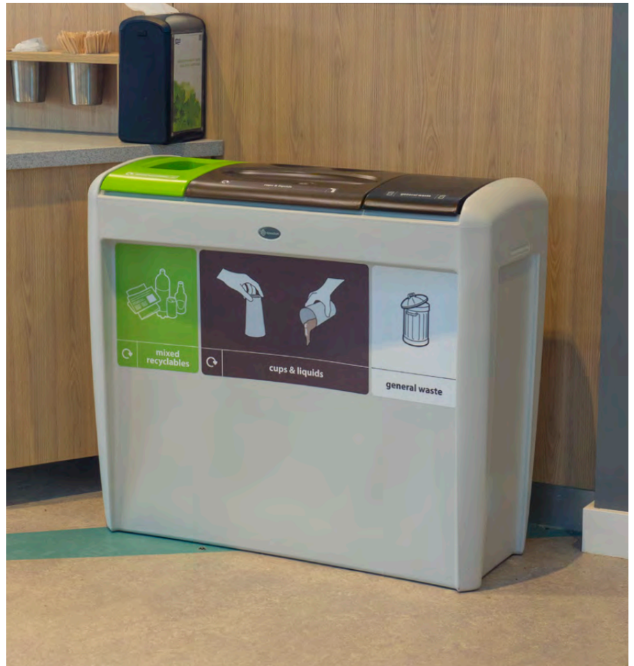
NEW Nexus® Evolution Cup Recycling Station