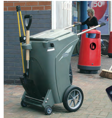
Skipper™ Orderly Barrow

LITTER COLLECTION We produce a range of litter collection tools ideal for keeping your site litter free. Our orderly barrows can be used for litter collection and segregation of waste or for transporting equipment.