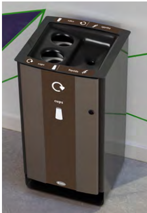
NEW Electra™ Cup Recycling Bin