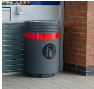
Admiral™ Litter Bin