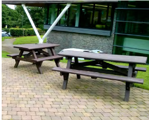
Clifton™ Picnic Table