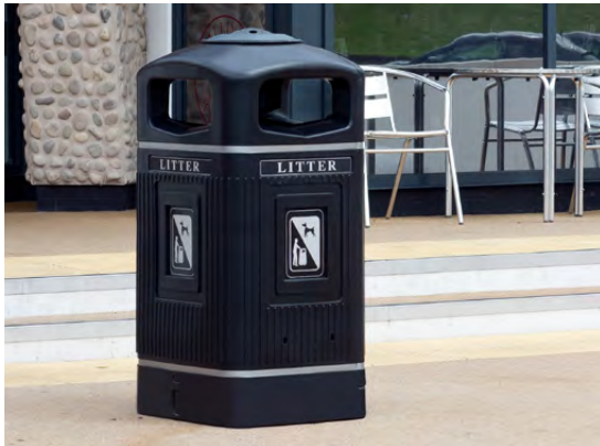
Glasdon Jubilee™ 110 Litter Bin