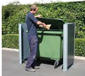
Visage Screen System