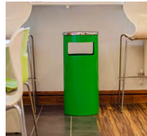
Tweed™ Litter Bin

At Glasdon we produce an extensive range of indoor litter bins made from highly durable materials to ensure a functional and long service life. Our collection of contemporary and stylish internal litter bins are ideal for inside modern offices and businesses, complementing the surroundings.