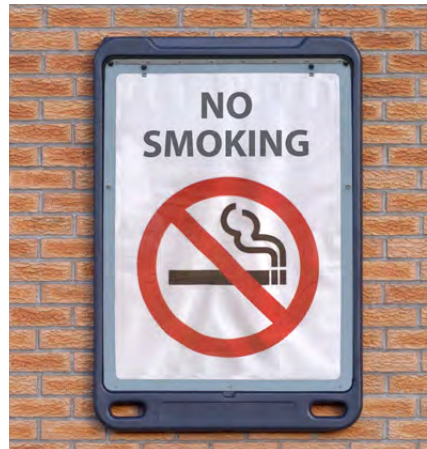
Advocate Poster Display Sign

DISPLAY SIGNS & RETAIL STORAGE UNITS The Advocate™ poster display sign is a versatile way of advertising your products or service. Posters can be easily changed to display your most recent offers. Perfect for supermarkets and convenience stores, we also have mobile basket storage to help utilise your space effectively.