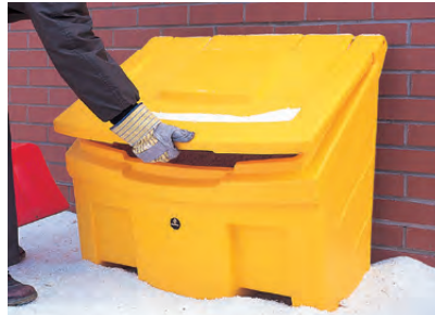
Slimline™ Grit Bin

Glasdon can provide you with the right tools for keeping your staff and visitors safe during the winter months. We offer a range of high quality grit bins, towable and manual grit/salt spreaders and snow removal equipment.