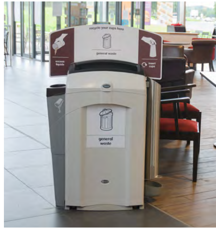
Nexus® 100 Recycling Station

The Glasdon Cup Recycling Bin range has been designed to help you implement an efficient cup recycling programme and increase your paper cup recycling rates. Choose from our selection of specifically designed cup recycling bins and cup recycling stations which feature liquid reservoirs and separate compartments for cups and lids.