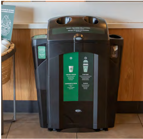
Nexus® 100 Duo Recycling Station