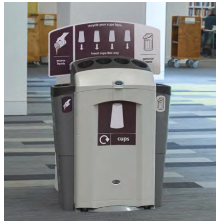
Nexus® 100 Cup Recycling Station