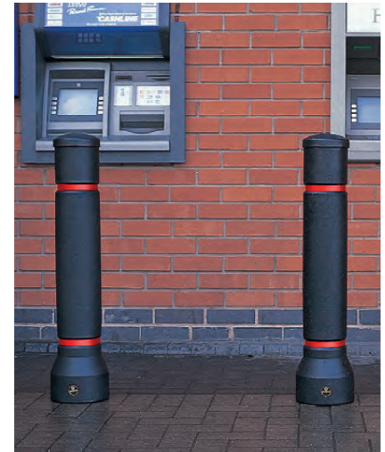
Neopolitan™ 20 Bollard