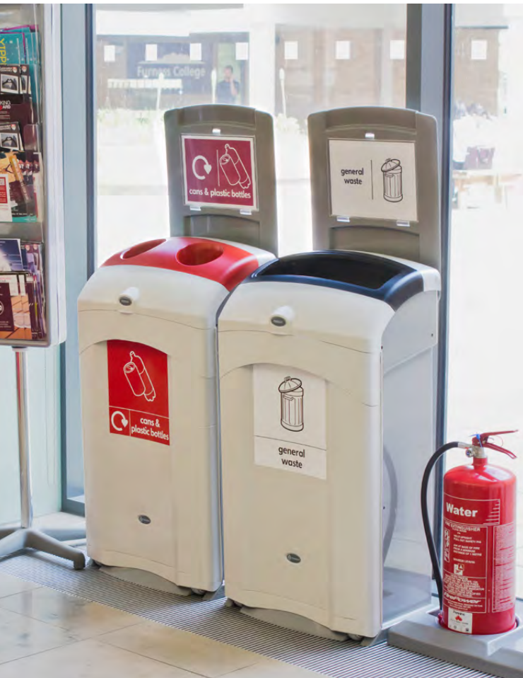
Nexus® 100 Recycling Bin