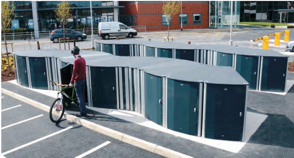
Modus™ Cycle Locker