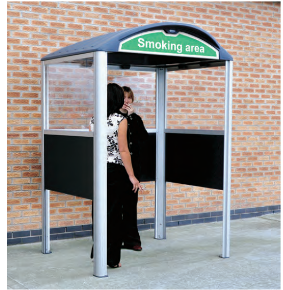
Modus™ Smoking Shelter