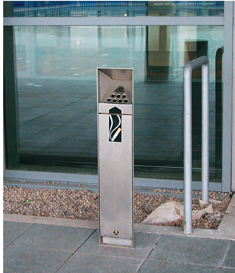
Ashguard™ Cigarette Bin