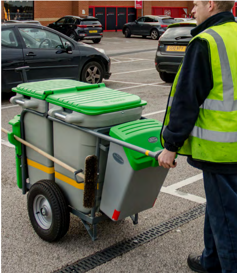
Space-Liner™ Orderly Barrow

LITTER COLLECTION We produce a range of litter collection tools ideal for keeping your site litter free. Our orderly barrows can be used for litter collection and segregation of waste or for transporting equipment.