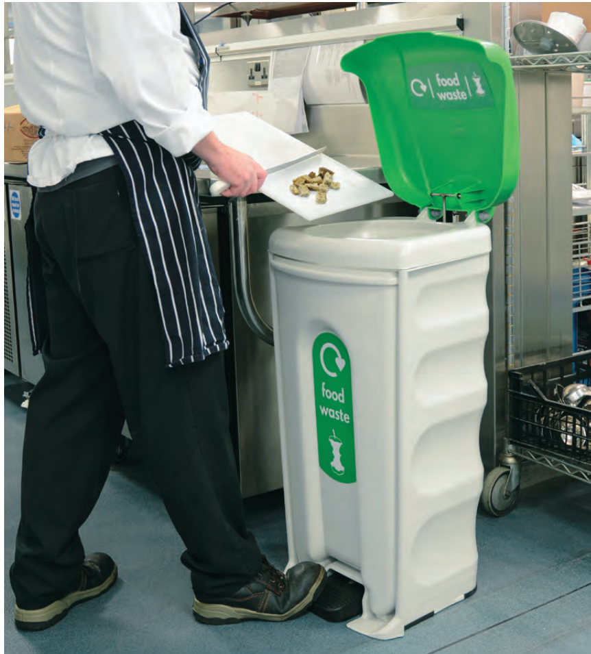
Nexus® Shuttle Food Waste Bin