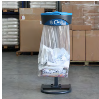
Orbis™ Sack Holder