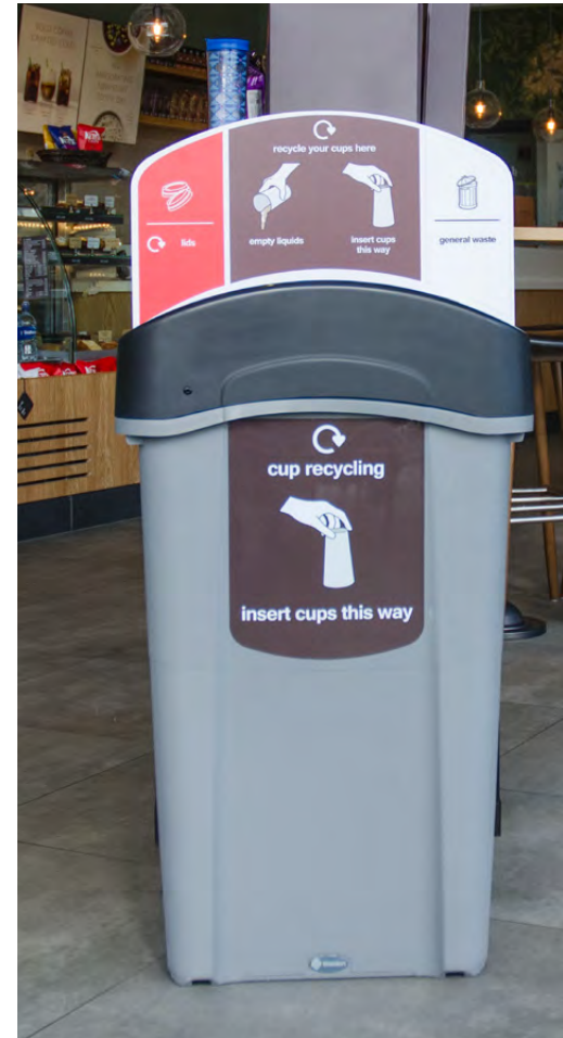
Eco Nexus® Cup Recycling Station