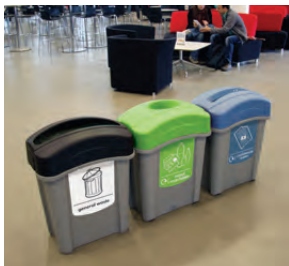
Eco Nexus® 60 Recycling Bin

We design and manufacture a wide range of indoor recycling bins which are perfect for retail environments. Available in a large selection of styles, materials and capacities to suit your requirements. Apertures and graphics are available for various waste streams, which allow you to manage recycling waste more effectively.