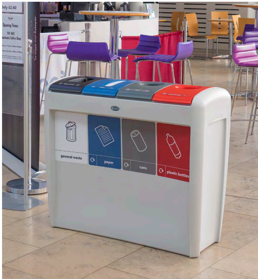
NEW Nexus® Evolution Quad Recycling Bin