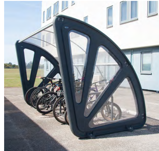
Aero™ Cycle Shelter

Keep bicycles safe with our cycle lockers, cycle shelters and cycle stands. Our cycle storage solutions offer space-saving designs and protect bicycles from weather, vandalism and theft.