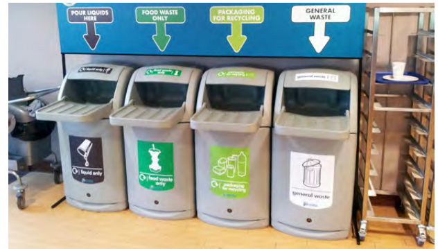
Combo™ Tray Shelf Food Waste Bin

Our Food Waste Recycling Bins are ideal for kitchens, canteens and any other areas where food is prepared or consumed. The easy to use bins make food waste disposal hygienic and efficient and they are a good way of handling high volumes of food waste.