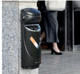
Ashmount SG™ Cigarette Bin