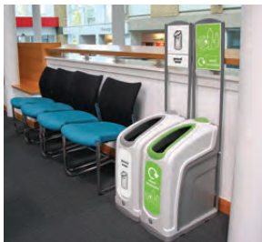
Nexus® 50 Recycling Bin