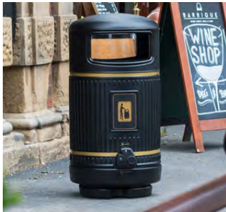
Topsy Royale™ Litter Bin

We have a massive selection of litter bins in a vast array of colours and capacities, you will be sure to find the correct one for your purpose. All our litter bins are easy to clean and never need painting, giving you an attractive and highly functional waste container for many years.