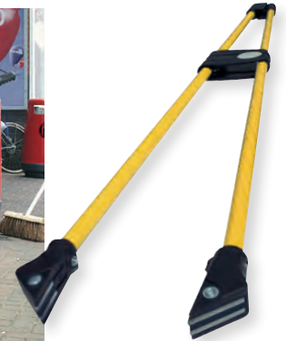
Litta-Pikka™ Collection Tool