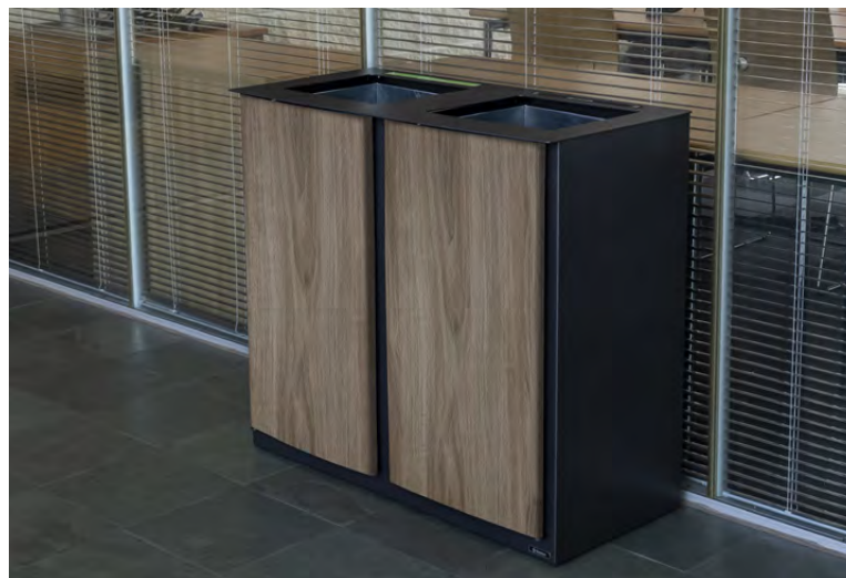
NEW Nexus® Style Recycling Bin