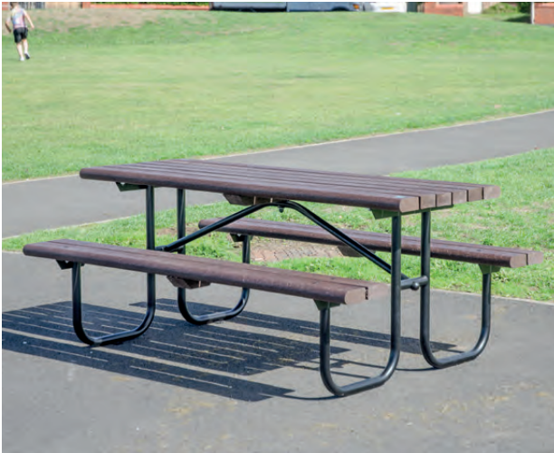
NEW Bowland™ Picnic Table

We offer a range of traditional and contemporary seating which can be used both indoors and outdoors. These seats and benches are low maintenance, weather and vandal resistant. They will add comfort and style around your environment.