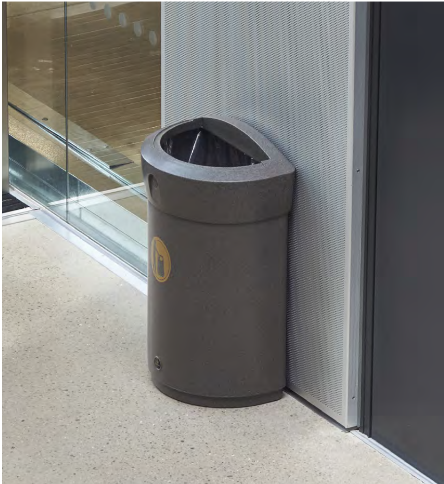
Envoy™ Litter Bin