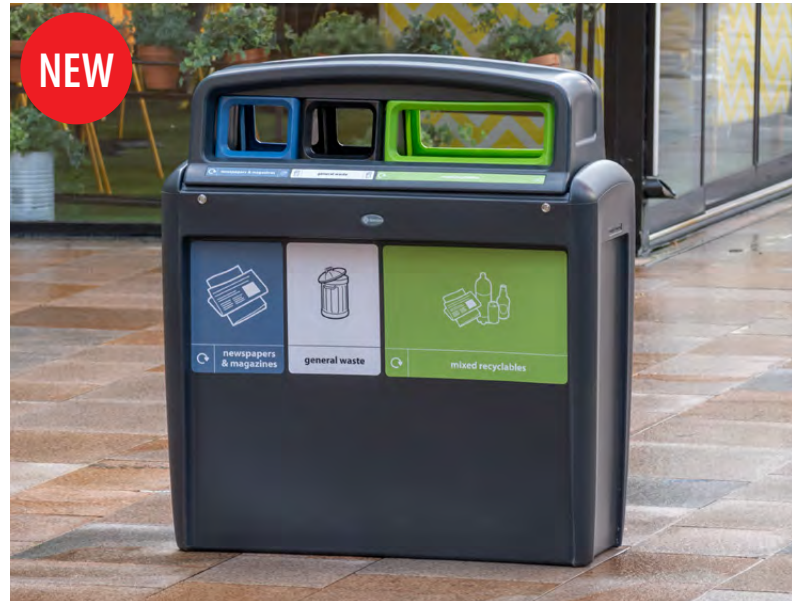
NEW Nexus® Evolution City Quad Recycling Bin