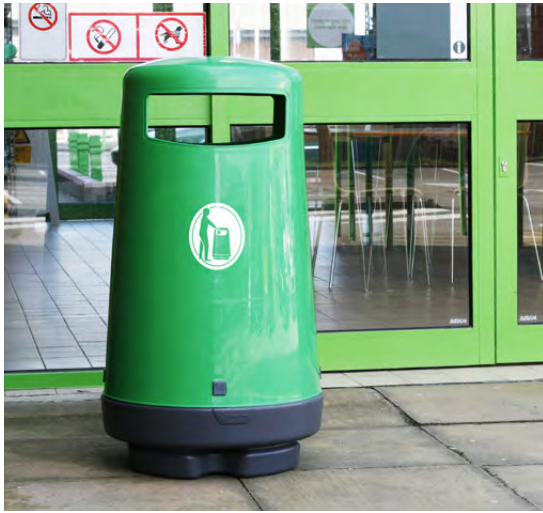
Topsy 2000™ Litter Bin