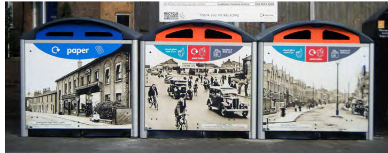
Modus™ Recycling Housing