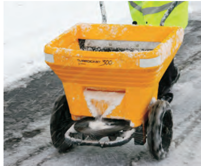
Turbocast 300™ Salt Spreader