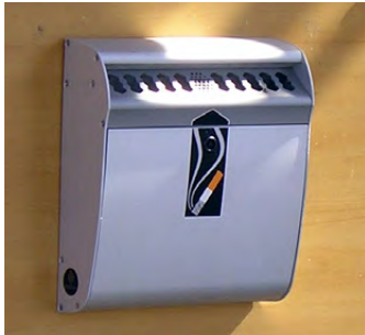
Ashmount™ Cigarette Bin

We offer free standing cigarette bins and wall mounted ashtrays with stubber plates to help keep cigarette waste under control. Glasdon also offer a range of smoking shelters and wall or post mounted smoking canopies which combined with our cigarette bin, perch seat and signage can be used to create a smoking station.