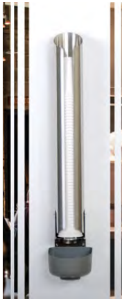
Centrum™ Cup Stacker