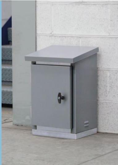
1. Citadel Cabinet

The Citadel™ range offers a cost-effective solution to the secure housing of equipment for a variety of applications. Available in five industry standard sizes, the cabinets can be supplied with ventilation or without for IP56 rated protection.