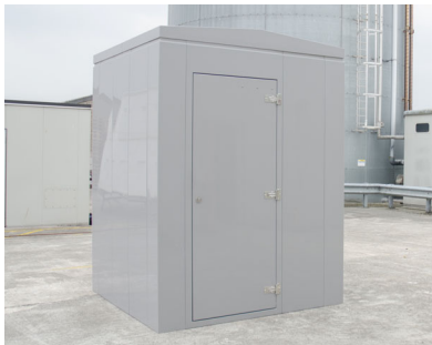
0.8m Single Access Door