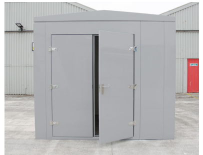
1.75m Double Access Doors