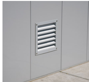
Vents 300x300mm - Anodised aluminium - white