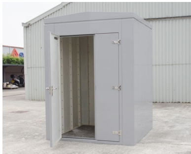
1.32m Double Access Doors