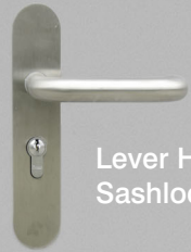
Lever Handle Sashlock Set

Element's modular design means that the housings can be specified in 1m length increments to suit your application.