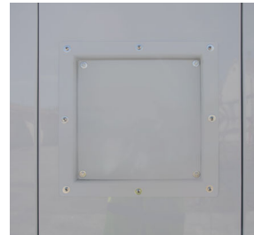
Gland plate 300x300mm