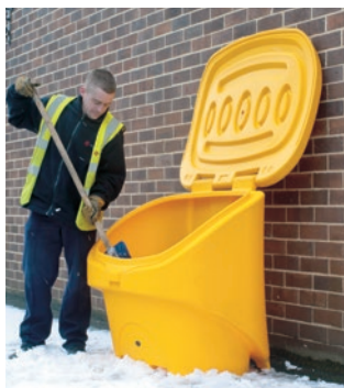
Nestor™ 400 Grit Bin