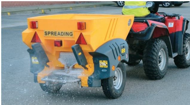
Turbocast 800™ Towable Dual Action Grit/Salt Spreader