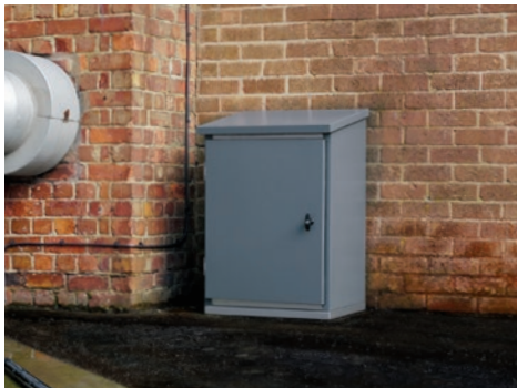
Citadel 659 Cabinet