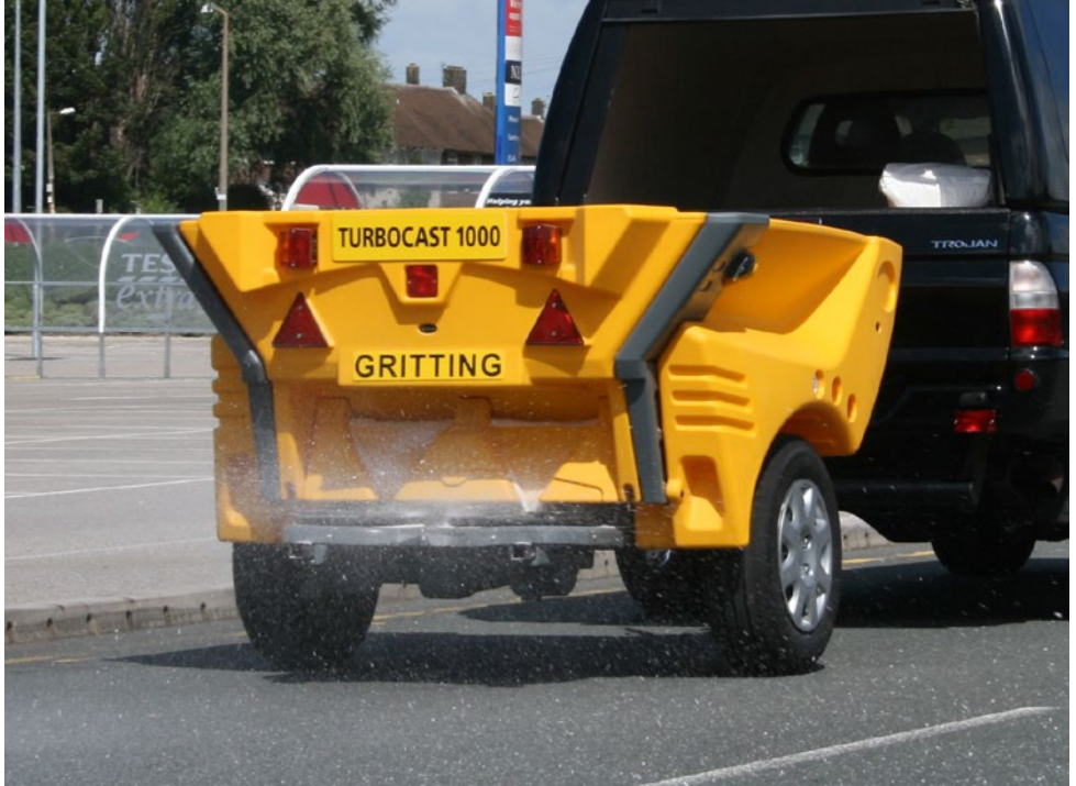
Turbocast 1000™ Towable Dual Action Grit/Salt Spreader

Reduce the risk of accidents during the colder months with Glasdon winter safety equipment. We offer storage bins for grit salt or ice melt, manual and towable spreading equipment and a wide selection of accessories to help ensure your site is prepared for ice and snow.