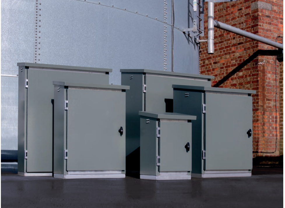
Citadel Cabinet Range

These steel cabinet enclosures offer a long term solution to house and protect instrumentation and electrical equipment. With the option of either double-skinned, insulated construction or our economical single-skin range, our cabinets have become a popular choice for metering and electrical panels.