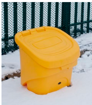
Nestor™ 90 Grit Bin