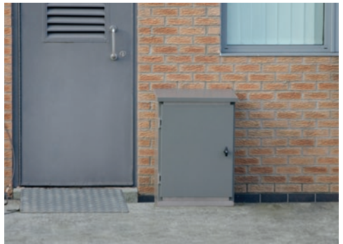
Citadel 639 Cabinet