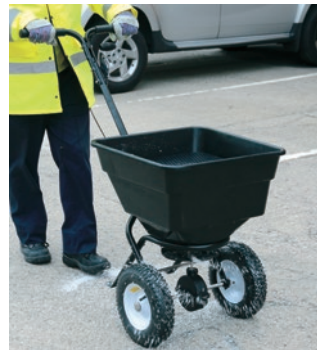
Icemaster 50™ Salt Spreader