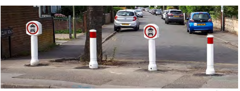
Neopolitan ^{\text{\tiny{M}}} 150 Bollard and Ensign ^{\text{\tiny{M}}} Bollard