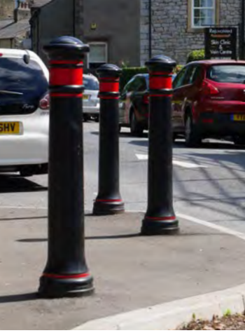
Glasdon Manchester™ Bollard