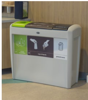
Nexus® Evolution Cup Recycling Station