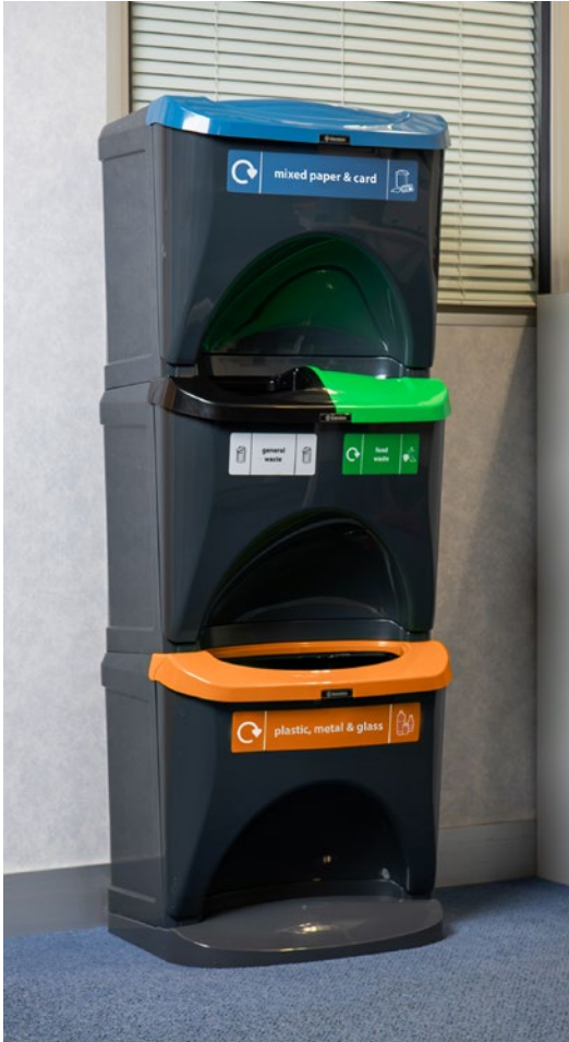
Nexus® Stack Recycling Bins