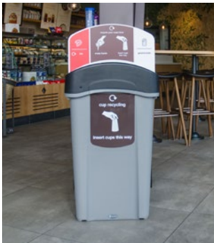
Eco Nexus® Cup Recycling Station