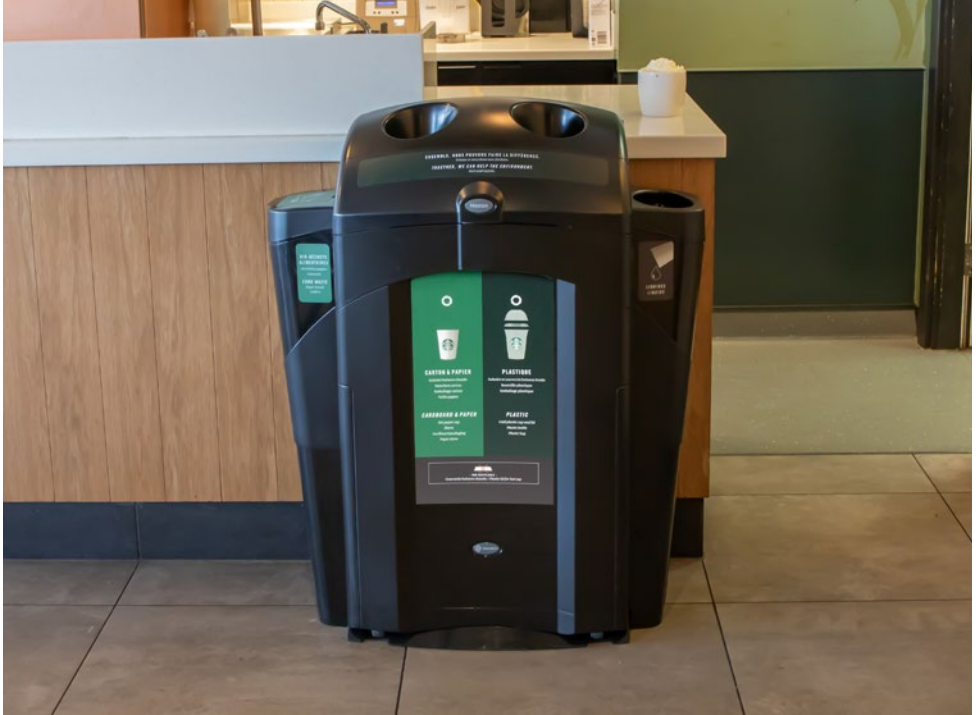
Nexus® 100 Duo Recycling Station

The Glasdon cup recycling bin range has been designed to help you implement an efficient cup recycling programme and increase your cup recycling rates. Choose from our selection of specifically designed cup bins and cup recycling stations which feature liquid reservoirs and separate compartments for cups and lids.