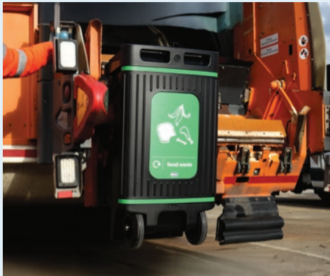
NEW Glasdon Jubilee™ City 100 Food Waste Recycling Bin

The 100L capacity caters to a minimum of 15 flats based on a weekly collection of a full 7L food waste collection caddy. However, weekly food waste volumes can vary meaning that in most cases the bin will serve 30 or more flats.