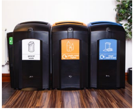
Nexus® 100 Recycling Bin