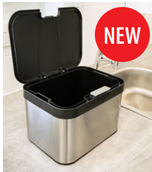
NEW Centrum™ 4.3L Food Waste Caddy