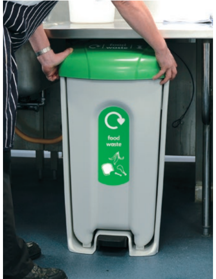
Nexus® Shuttle Food Waste Bin