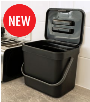
NEW Nexus® 7L Food Waste Caddy