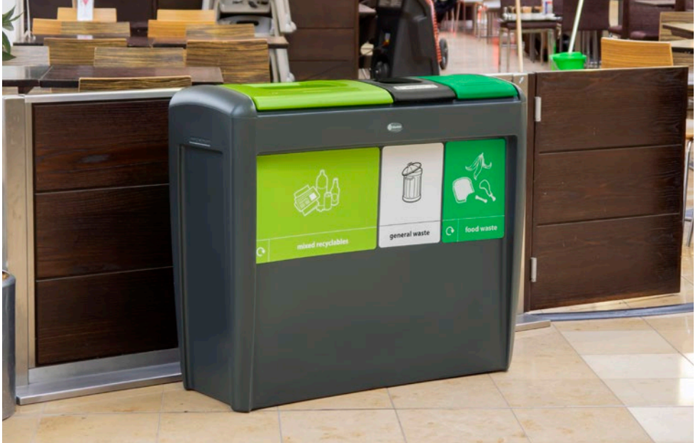
Nexus® Evolution Trio Recycling Bin

Apertures and graphics are available for various waste streams, allowing you to manage recycling waste more effectively.