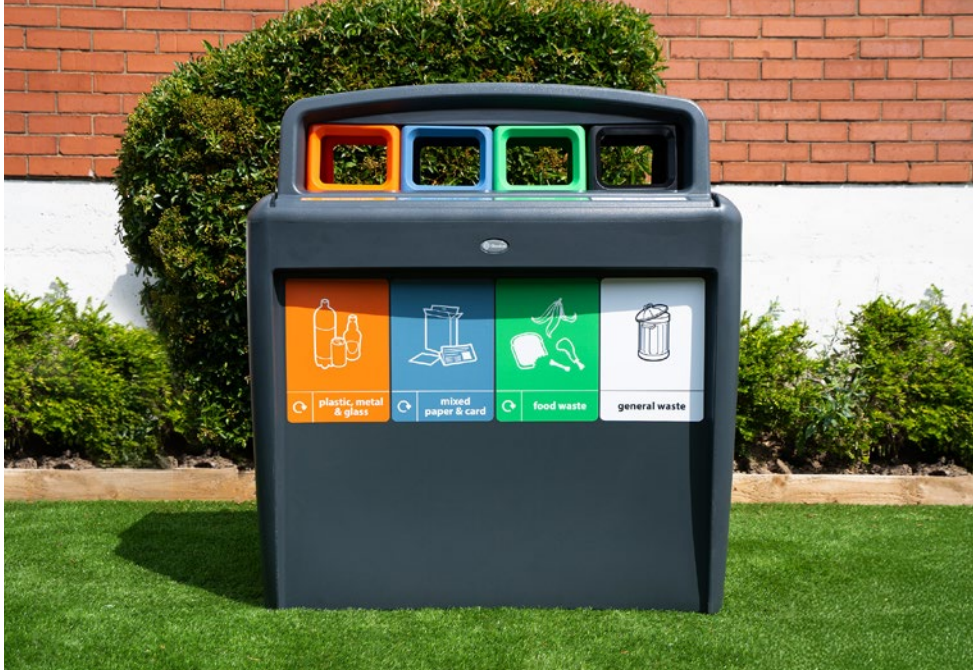
Nexus® Evolution City Quad Recycling Bin

We produce an extensive range of outdoor recycling bins of the highest quality in both traditional and contemporary designs. All of our recycling containers are designed to be hard-wearing and long-lasting and feature easily identifiable graphics to make recycling easy.