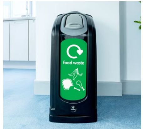
Nexus® 50 Food Waste Bin