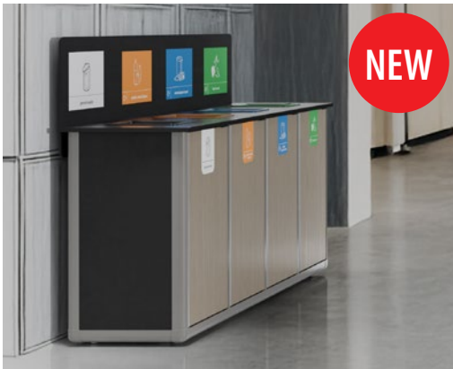
NEW Origin Infinity™ Recycling Station