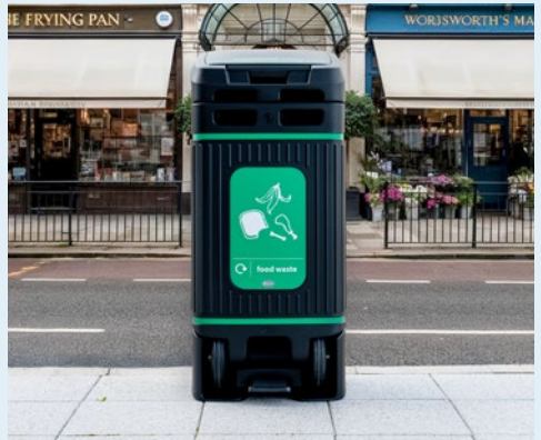
NEW Glasdon Jubilee™ City 100 Food Waste Recycling Bin