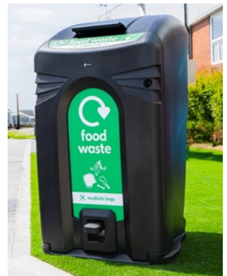
Nexus® City 240 Food Waste Bin