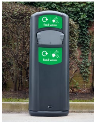
NEW Nexus® City 35 Food Waste Bin