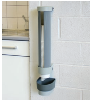
Nexus® Cup Stacker