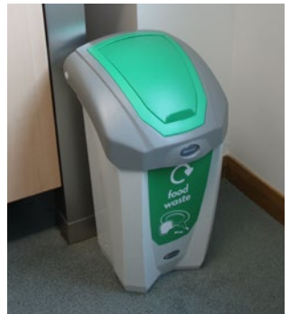
Nexus® 30 Recycling Bin