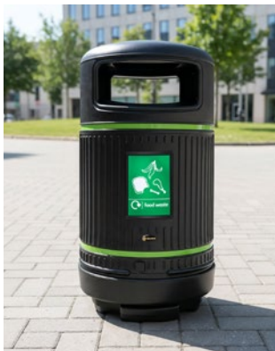
Topsy Royale™ Food Waste Bin