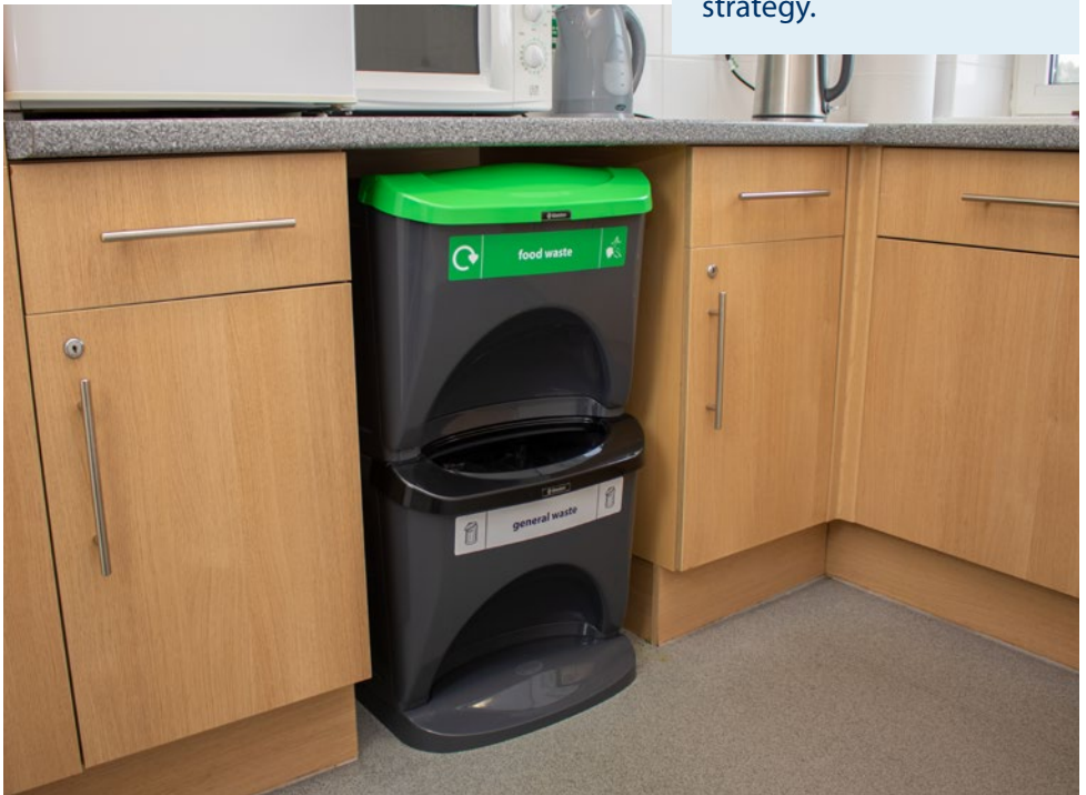
Nexus® Stack Recycling Bin

Don't let food waste management challenges hold you back - contact Glasdon today to discover how our bespoke solutions can transform your waste collection strategy.