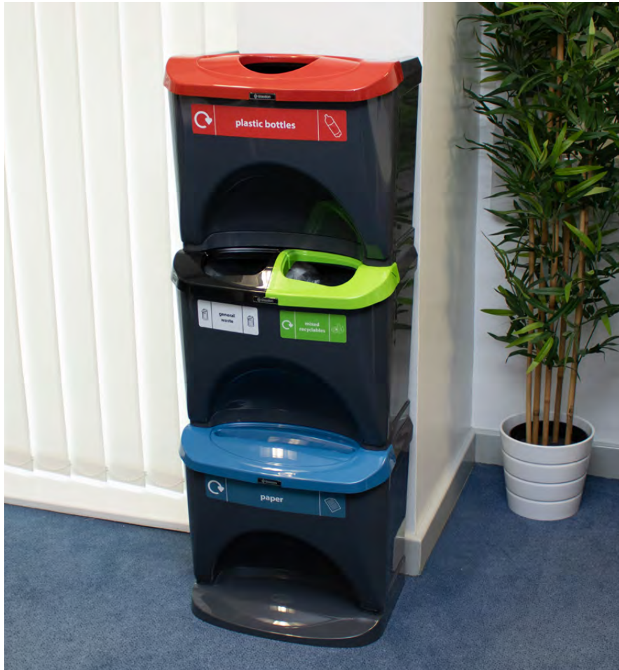
NEW Nexus® Stack 90 Recycling Bin