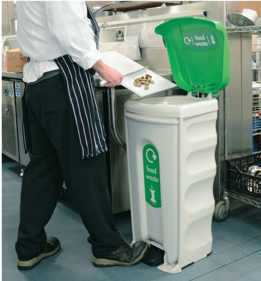
Nexus® Shuttle Food Waste Bin