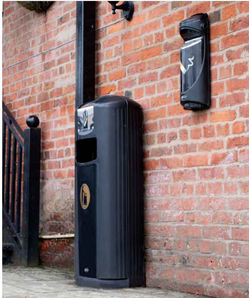
Integro City™ Cigarette & Litter Bin and Ashmount SG Cigarette Bin