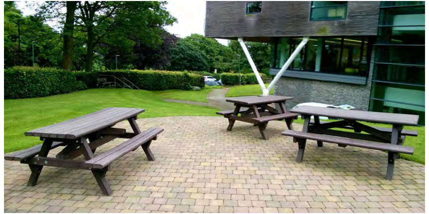
Clifton™ Picnic Table