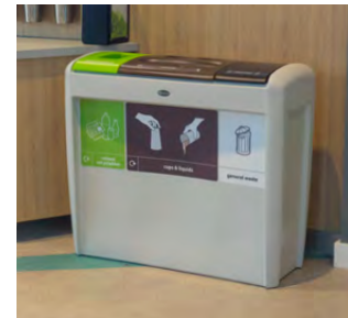
NEW Nexus® Evolution Cup Recycling Station