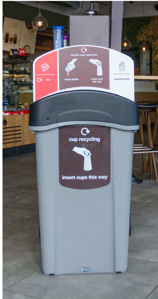
Eco Nexus® Cup Recycling Station