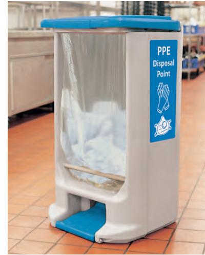
Hippo™ PPE Waste Bin