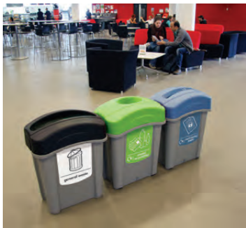
Eco Nexus® 60 Recycling Bin

Apertures and graphics are available for various waste streams, which allow you to manage recycling waste more effectively.