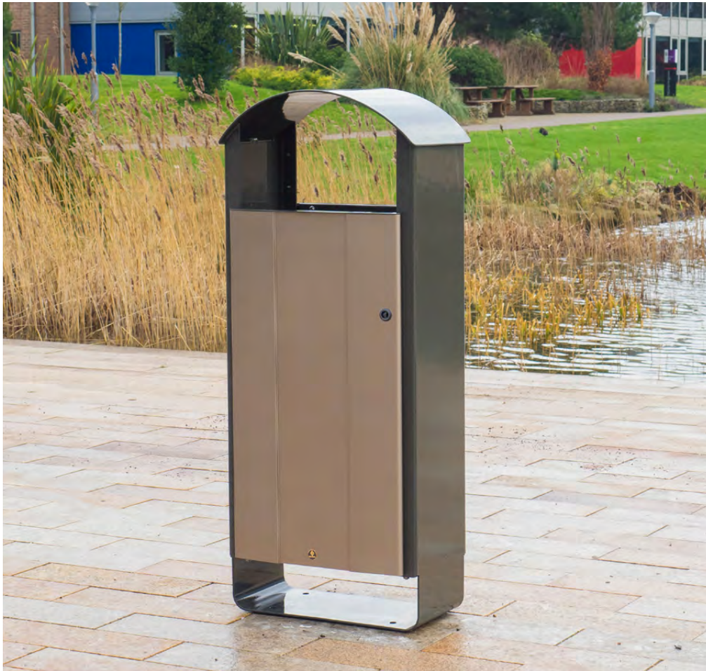
NEW Electra™ Curve 60 Litter Bin