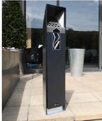
Ashguard™ Cigarette Bin