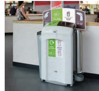
Nexus® 100 Duo Recycling Station