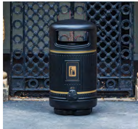
Topsy Royale™ Litter Bin