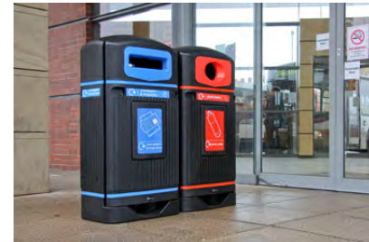
Streamline Jubilee™ Recycling Bin