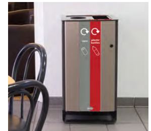
Electra™ 85 Duo Recycling Bin