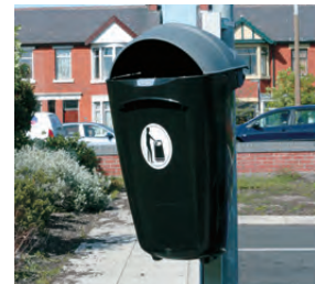
Hooded Trimline 50™ Litter Bin