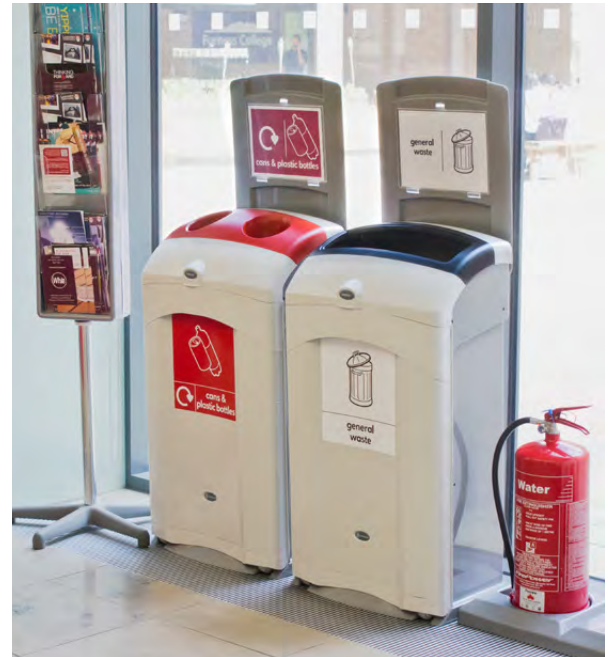
Nexus® 100 Recycling Bin