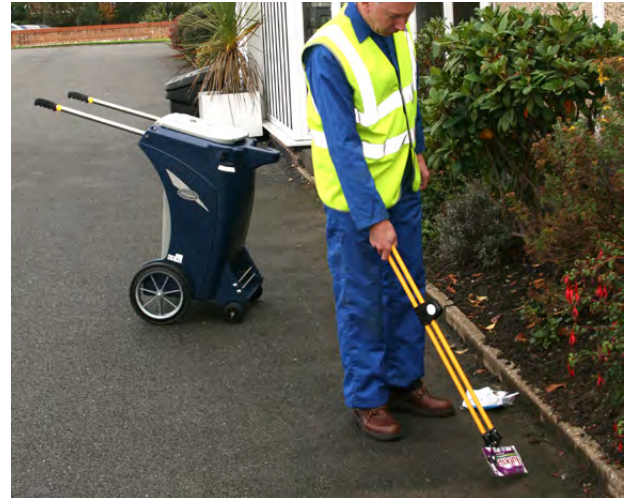
Skipper™ Orderly Barrow and Litta-Pikka™ Litter Collection Tool

We produce a range of litter collection tools ideal for keeping your campus litter free. Our Orderly Barrows can be used for litter collection and segregation of waste or for transporting equipment.