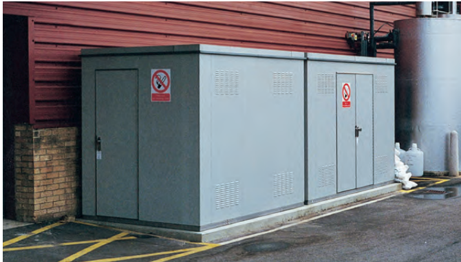
Trooper™ Equipment Housing