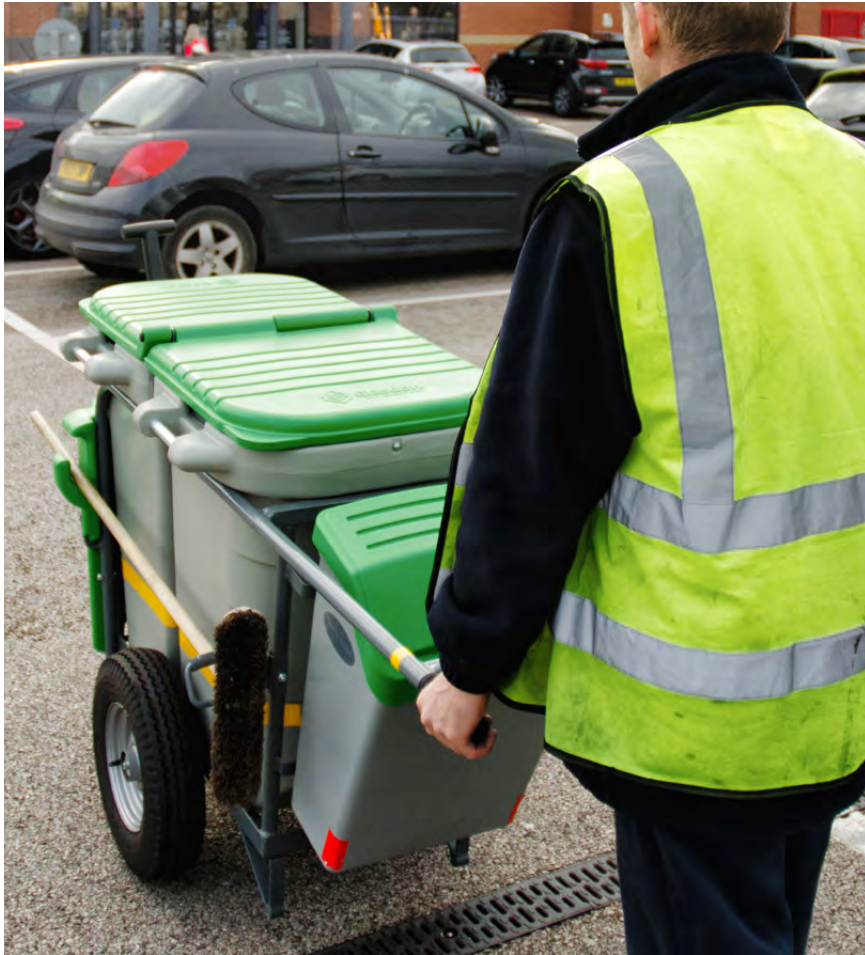
Space-Liner™ Orderly Barrow (Double Model)