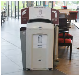
Nexus® 100 Recycling Station