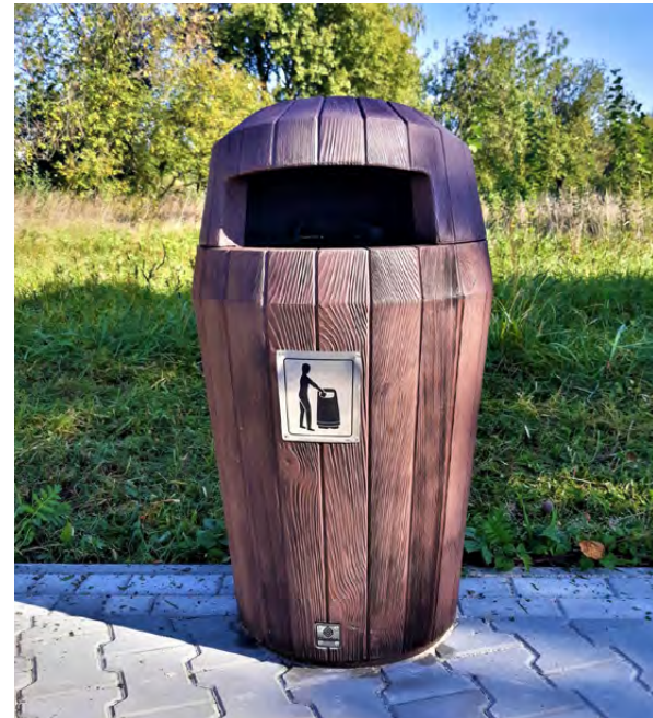
Sherwood™ Litter Bin