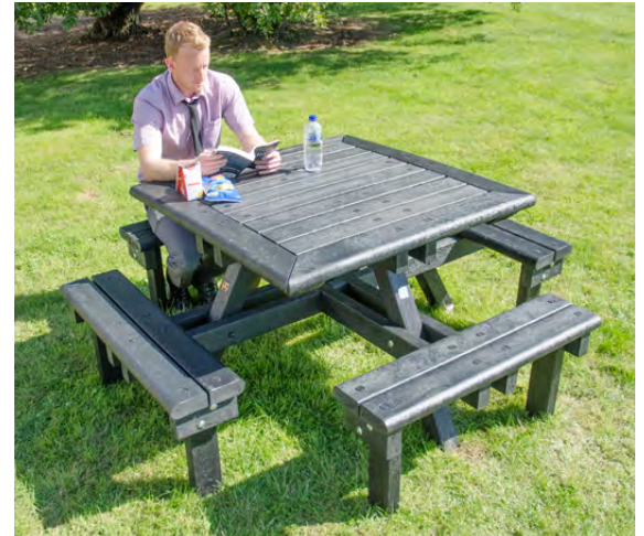
NEW Pembridge™ Picnic Table