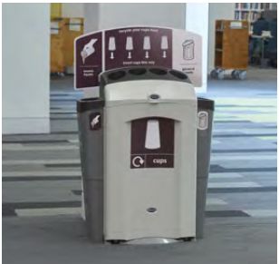
Nexus® 100 Cup Recycling Station

The Glasdon Cup Recycling Bin range has been designed to help you implement an efficient cup recycling programme and increase your paper cup recycling rates. Choose from our selection of specifically designed cup bins and cup recycling stations which feature liquid reservoirs and separate compartments for cups and lids.