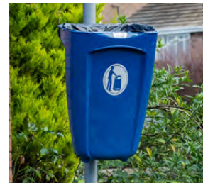
Super Trimline 50™ Litter Bin