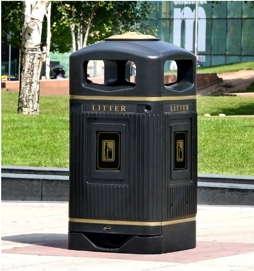
Glasdon Jubilee™ 110 Litter Bin