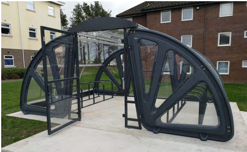
NEW Aero™ Corral Cycle Compound