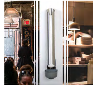
Centrum™ Cup Stacker