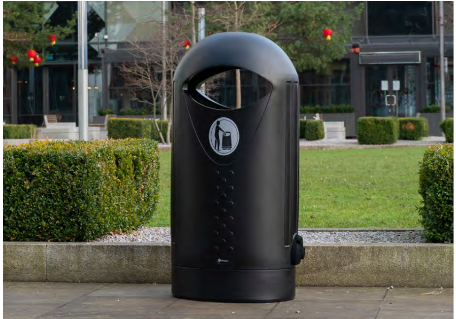
NEW Elipsa™ Litter Bin

We have a massive selection of litter bins in a vast array of colours and capacities, you will be sure to find the correct one for your purpose. All our litter bins are easy to clean and never need painting, giving you an attractive and highly functional waste container for many years.