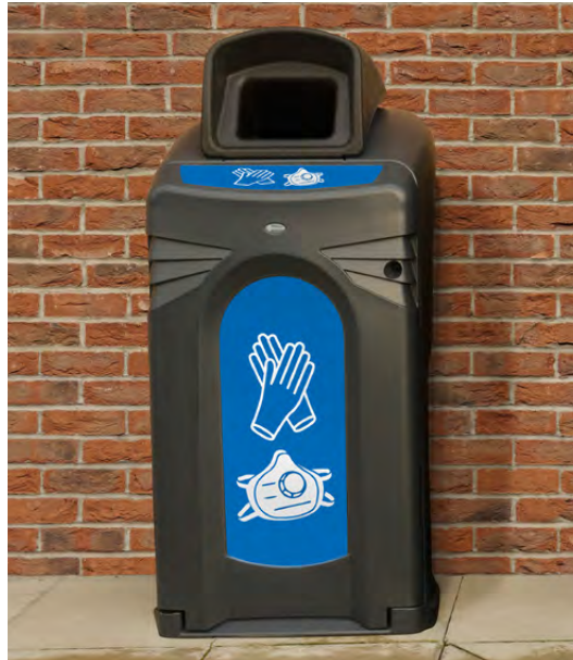
Nexus® City 240 PPE Disposal Unit