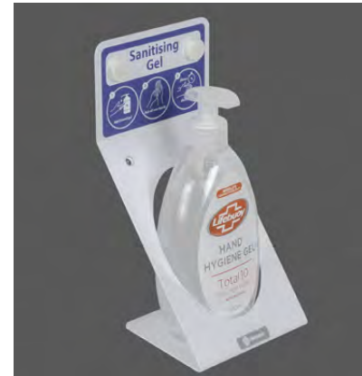
NEW Hand Sanitiser Wall Bracket