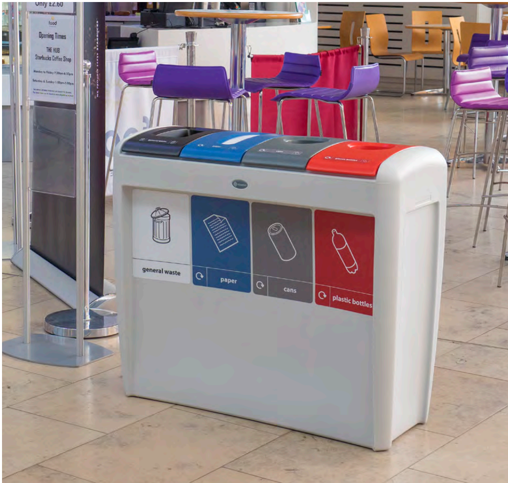
NEW Nexus® Evolution Quad Recycling Bin