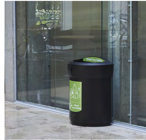
Envoy™ Recycling Bin