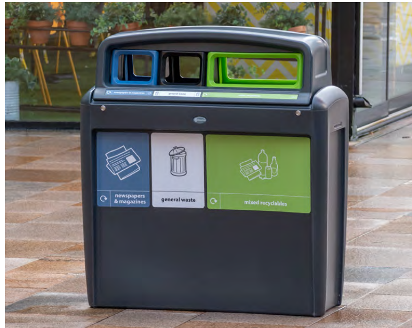
NEW Nexus® Evolution City Trio Recycling Bin