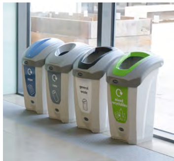
Nexus® 30 Recycling Bin