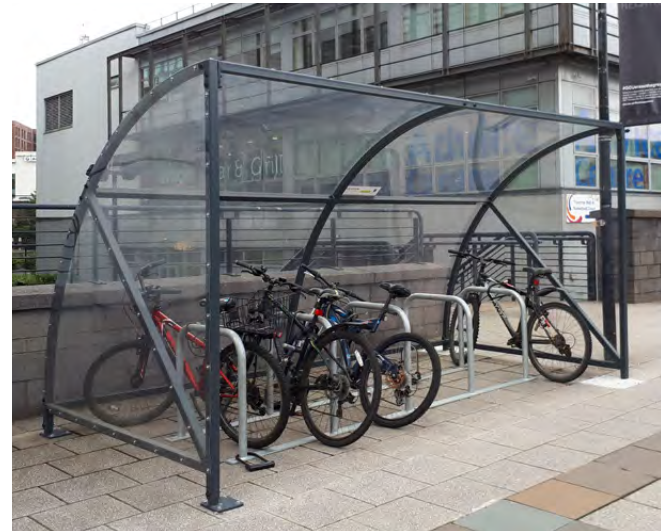
NEW Echelon™ Cycle Shelter with Cycle Toast Rack

Keep bicycles safe around your college with our cycle lockers, cycle shelters and cycle stands. Our cycle storage solutions offer space-saving designs and protect bicycles from weather, vandalism and theft.