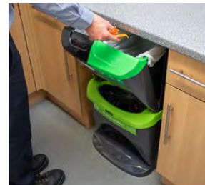
NEW Nexus® Stack 60 Recycling Bin