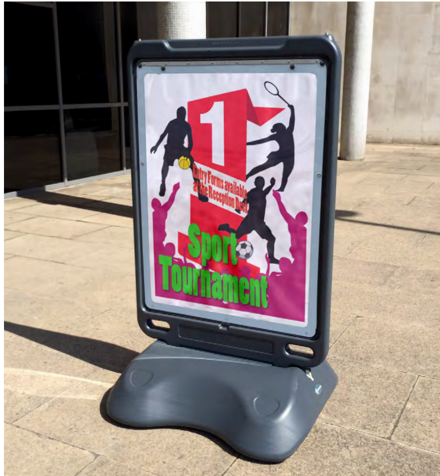
Advocate™ Poster Display Sign