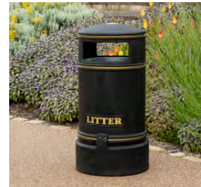
Topsy Jubilee™ Litter Bin