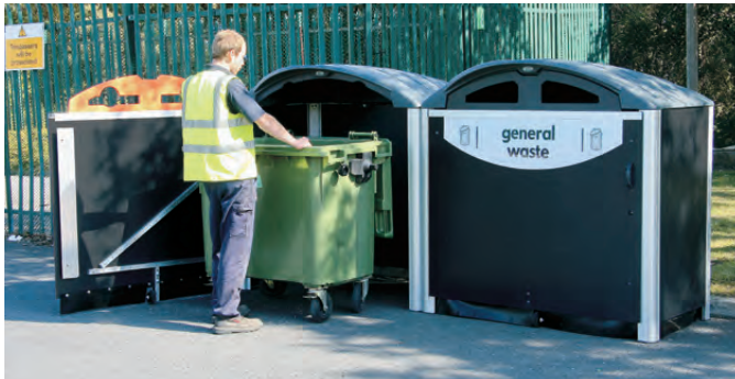
Modus™ Recycling Housing