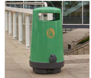
Topsy 2000™ Litter Bin