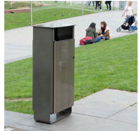
Electra™ 60 Litter Bin