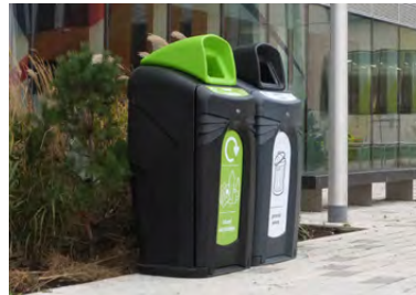
Nexus® City 240 Recycling Bin

We produce an extensive range of outdoor recycling bins of the highest quality, in both traditional and contemporary designs. All of our recycling containers are designed to be hard-wearing and long-lasting and feature easily identifiable graphics to make recycling easy.