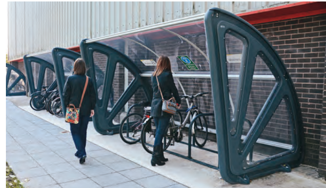
Aero™ Cycle Shelter