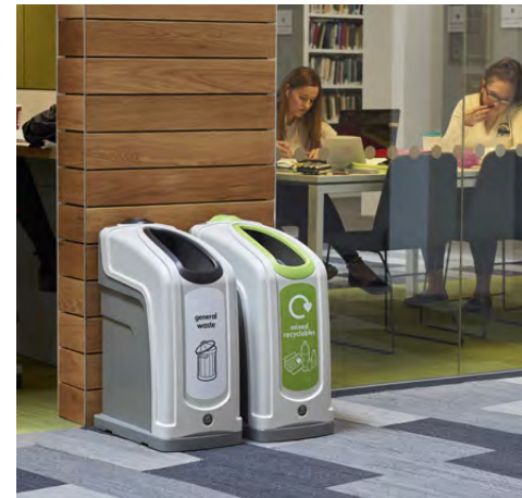
Nexus® 50 Recycling Bin