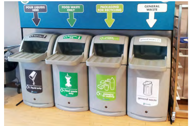
Combo™ Tray Shelf Food Waste Bin

Our Food Waste Recycling Bins are ideal for college kitchens, canteens, food courts and any other areas where food is prepared or consumed. The easy to use bins make food waste disposal hygienic and efficient and they are a good way of handling high volumes of food waste.