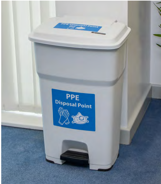
NEW BigFoot™ 60 PPE Pedal Bin

A wide range of high-quality products to support COVID-19 control measures and health and safety procedures within any environment.