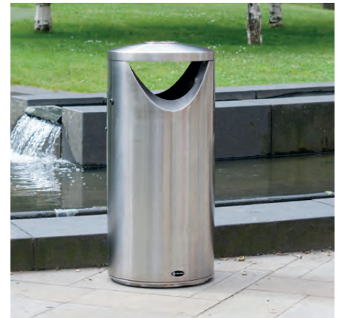
Centrum™ Litter Bin