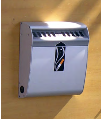
Ashmount™ Cigarette Bin

We offer free standing cigarette bins and wall mounted ashtrays with stubber plates to help keep cigarette waste under control. Glasdon also offer a range of smoking shelters and wall or post mounted smoking canopies which combined with our cigarette bin, perch seat and signage can be used to create a smoking station.