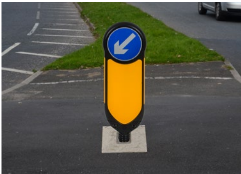
Rebound Signmaster™ Ultra 50 Bollard