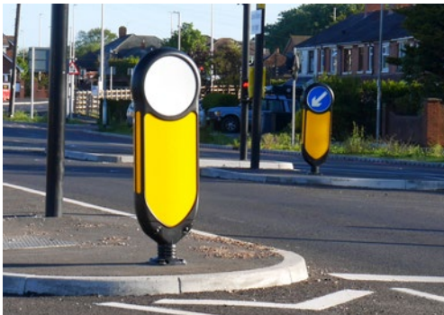
Rebound Signmaster™ Ultra Compact Bollard