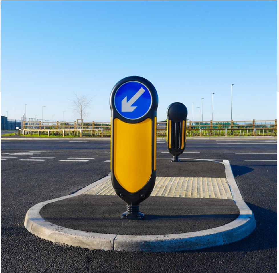
Rebound Signmaster™ Ultra Compact Bollard