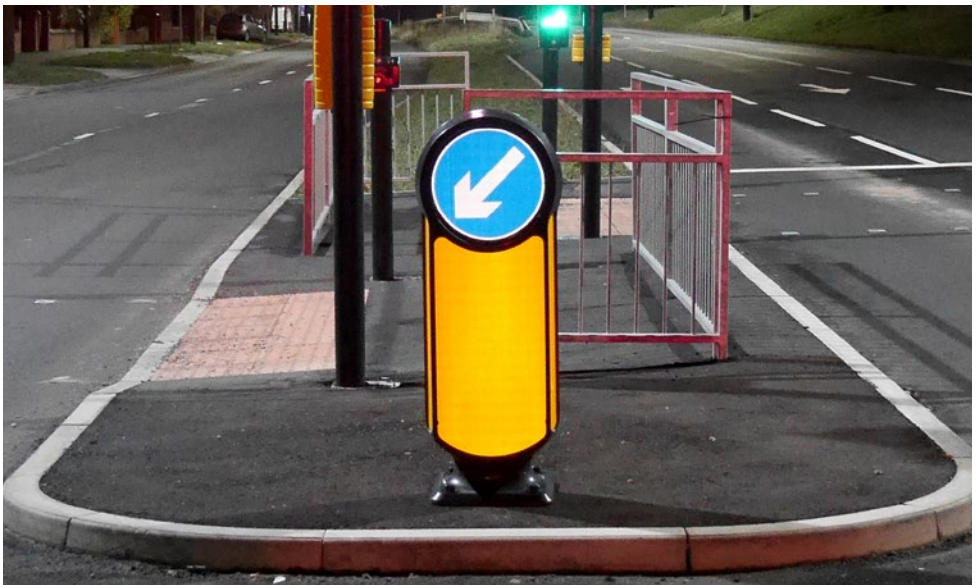
Rebound Signmaster™ Bollard