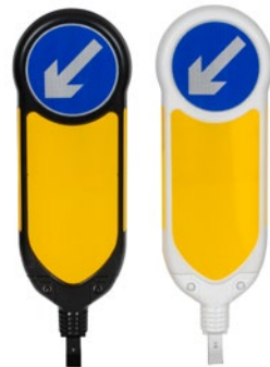
Rebound Signmaster™ Ultra 50 Bollard