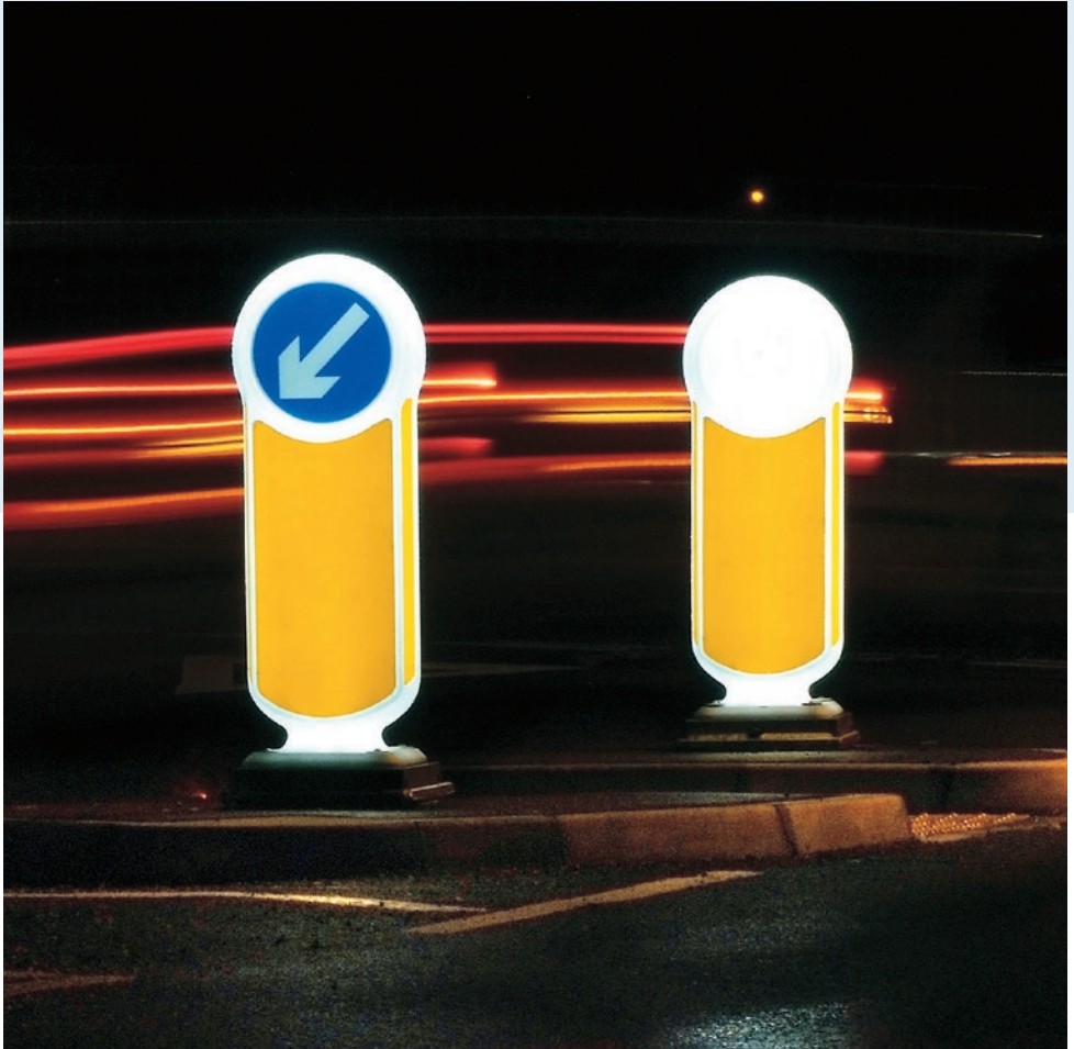
Rebound Signmaster™ LED Bollard