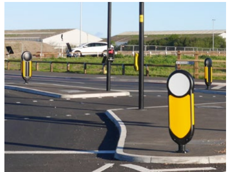
Rebound Signmaster™ Ultra Compact Bollard