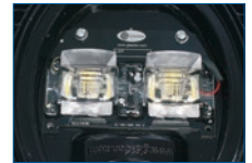
Lumino City 1500

Increased reliability, simple installation and long lifespan.