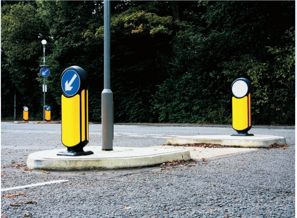
Rebound Signmaster™ Bollard