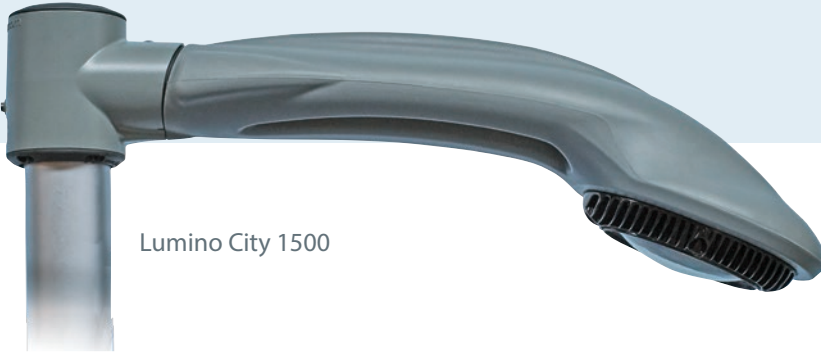
Lumino City 1500

Lumino City offers reduced power consumption (as low as 2W) without compromising on luminance performance. Available in two sizes for signs from 600mm to 1500mm diameter, Lumino City is manufactured from our impact absorbing Impactapol® material to withstand vehicle impacts and improve longevity.