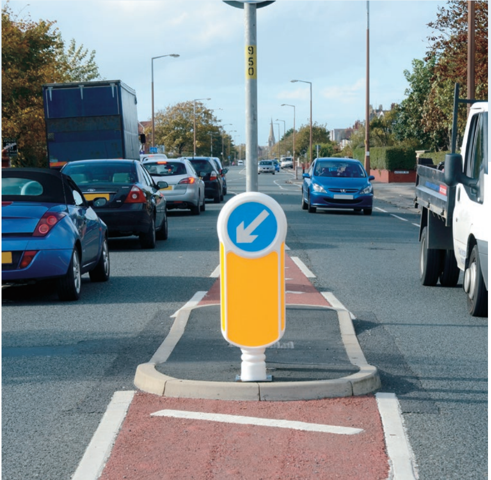
Socketed Rebound Signmaster™ Bollard