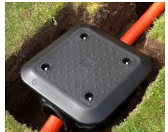
Subsafe Installation Box

In the event of road traffic accident damage to Orbital, specifying with sockets enables quick and easy replacement, minimising time spent at the roadside for the improved safety of roadside workers and reduced traffic management time, cost and traffic disruption.