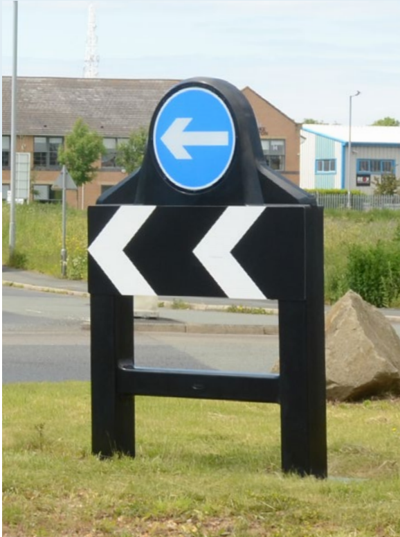
Orbital™ Chevron Sign Illuminated model