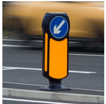
Solar Signmaster™ LED Bollard