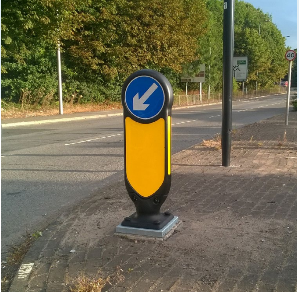
Rebound Signmaster™ Ultra Bollard