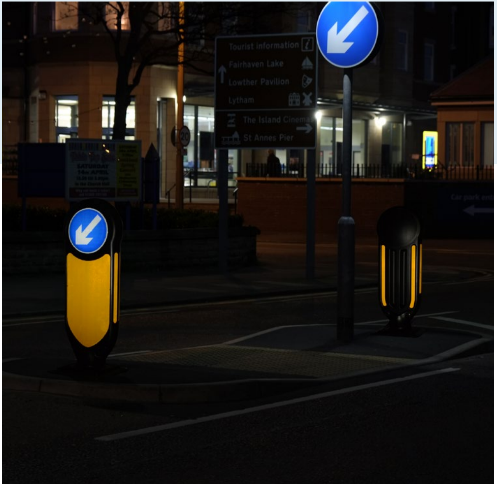
Rebound Signmaster™ Ultralow Bollard