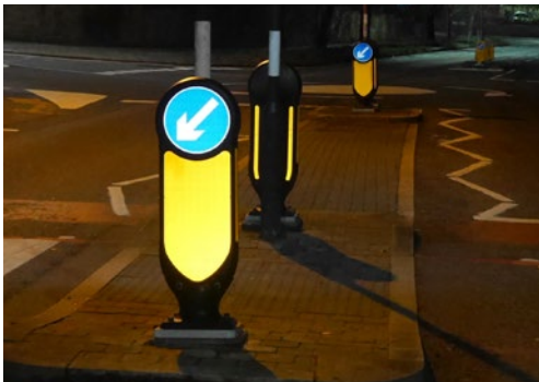
Rebound Signmaster™ Ultra Bollard