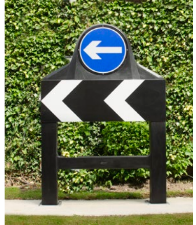
Orbital™ Chevron Sign Illuminated model