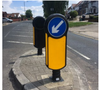
Socketed Rebound Signmaster™ Bollard