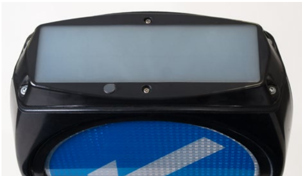
Solar Signmaster™ LED Bollard