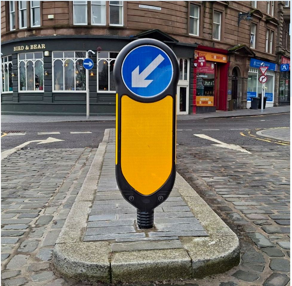
Rebound Signmaster™ Ultra 50 Bollard