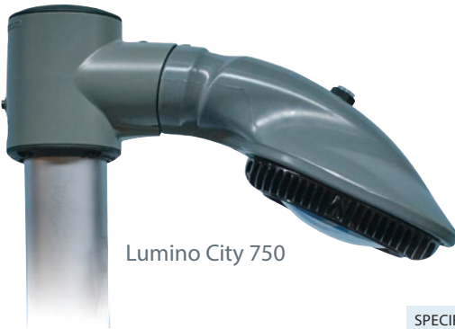
Lumino City 750