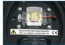
Lumino City 750