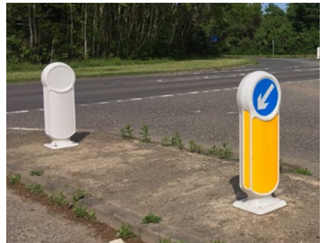
Rebound Signmaster™ Ultra Bollard