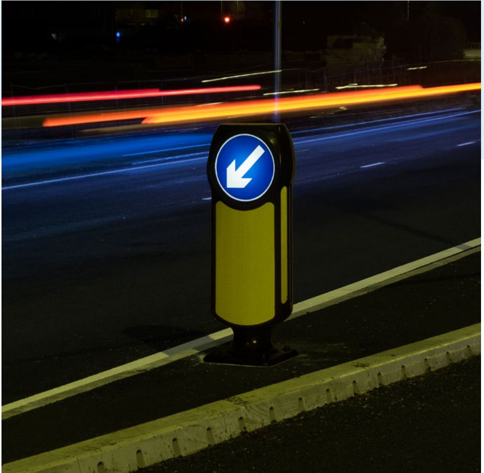
Solar Signmaster™ LED Bollard