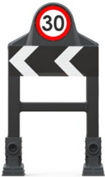
Orbital LockFast Socket Installation