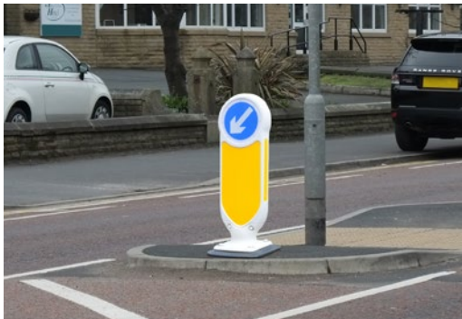
Rebound Signmaster™ Ultralow Bollard