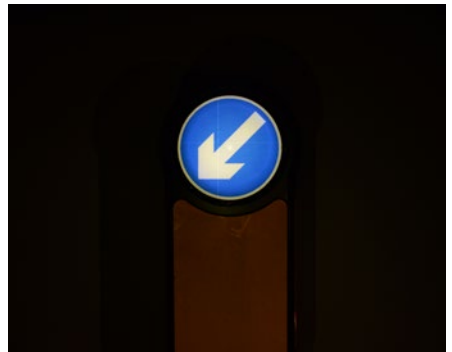
Rebound Signmaster™ Ultralow Bollard