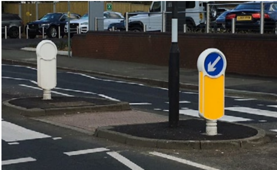
Socketed Rebound Signmaster™ Bollard