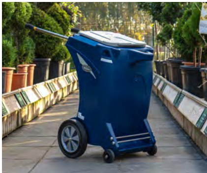
Skipper™ Multi-Purpose Cleaning Trolley