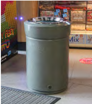
Statesman™ Litter Bin