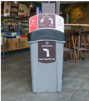
Eco Nexus® Cup Recycling Station