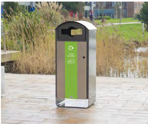
Electra™ Curve 85 Recycling Bin