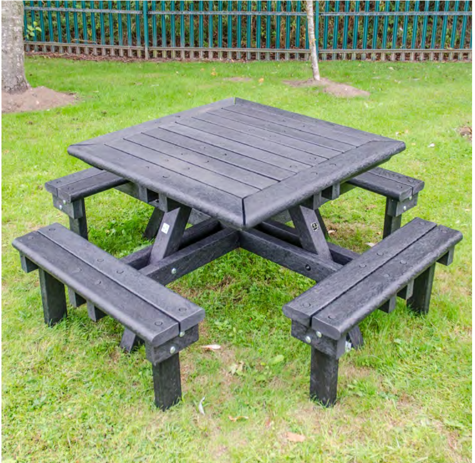
Pembridge™ Picnic Table