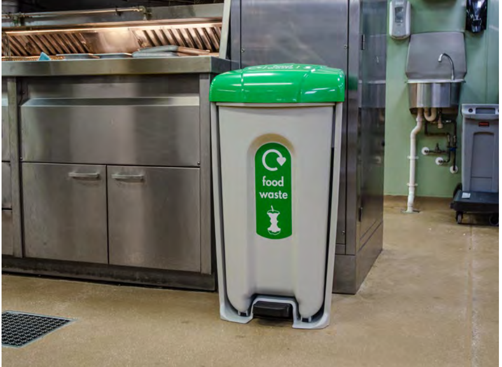
Nexus® Shuttle Food Waste Bin

Our food waste recycling bins are ideal for kitchens, canteens, food courts and any other areas where food is prepared or consumed. The easy to use foot pedals and large apertures make food waste disposal effortless and hygienic.