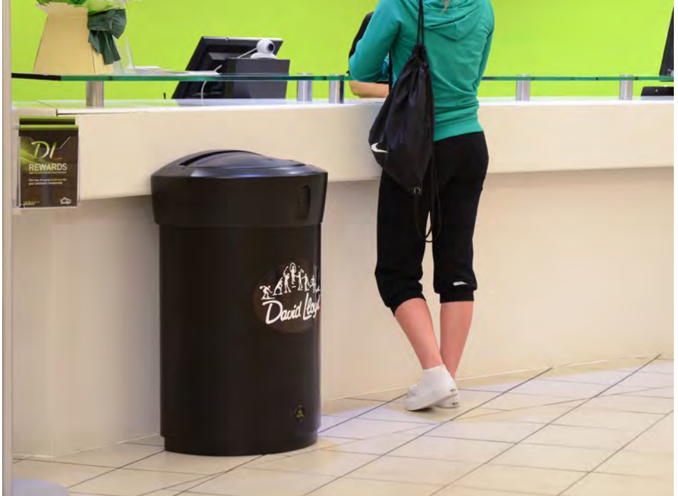
Envoy™ Litter Bin

We produce an extensive range of indoor litter bins made from highly durable materials to ensure a functional and long service life. Our collection of contemporary internal litter bins are stylish and will complement their surroundings.