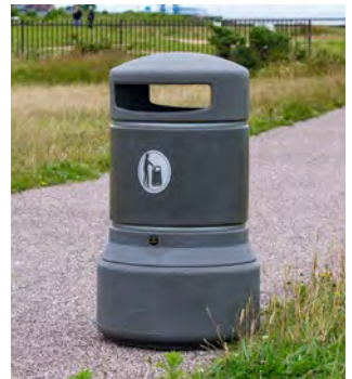
Plaza® Litter Bin