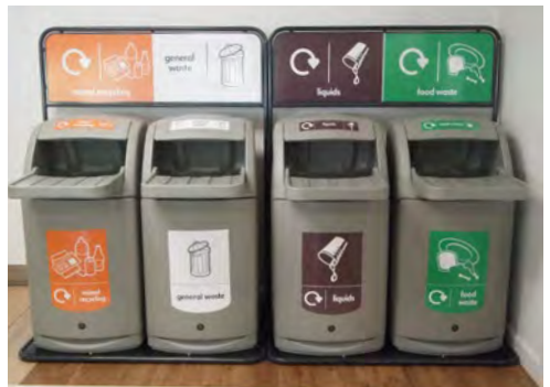
Combo™ Tray Shelf Catering Waste Bin