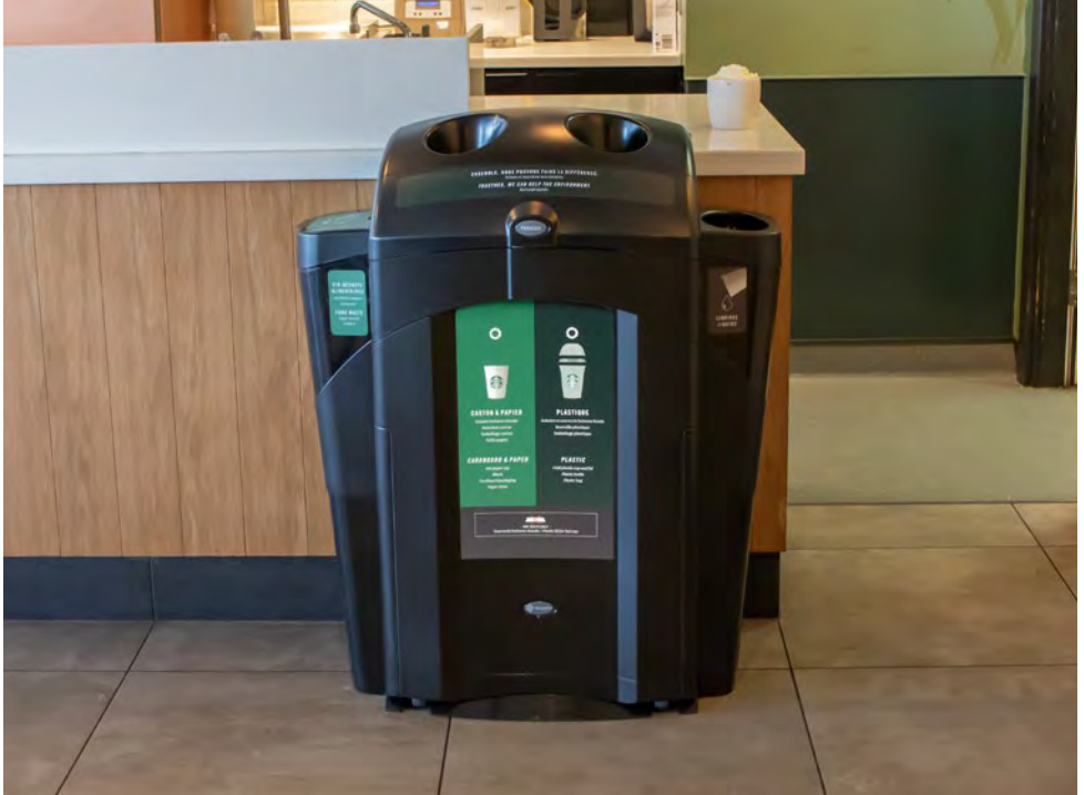
Nexus® 100 Duo Recycling Station

The Glasdon cup recycling bin range has been designed to help you implement an efficient cup recycling programme and increase your cup recycling rates. Choose from our selection of specifically designed cup bins and cup recycling stations which feature liquid reservoirs and separate compartments for cups and lids.