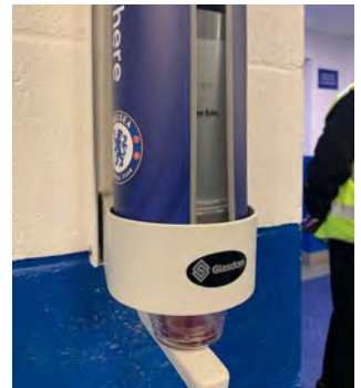
Nexus® Cup Stacker