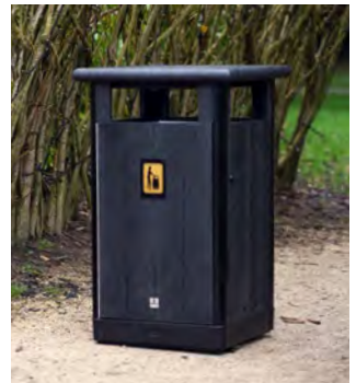
NEW Origin™ Horizon 110 Litter Bin