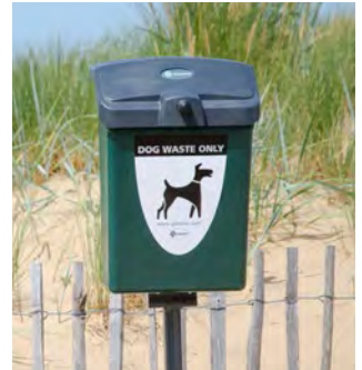
Fido 25™ Dog Waste Bin