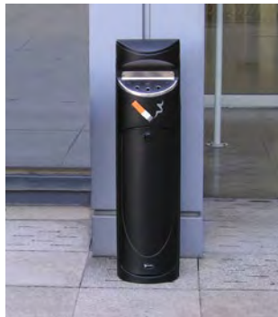
Ashguard SG™ Cigarette Bin