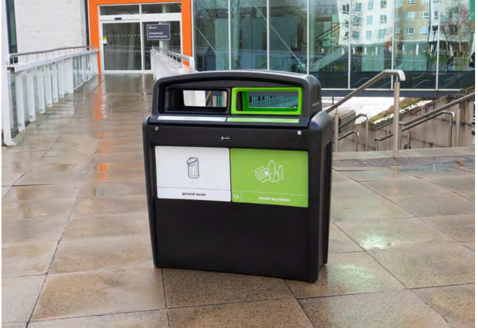
Nexus® Evolution City Duo Recycling Bin

We produce an extensive range of outdoor recycling bins of the highest quality in both traditional and contemporary designs. All of our recycling containers are designed to be hard-wearing and long-lasting and feature easily identifiable graphics to make recycling easy.