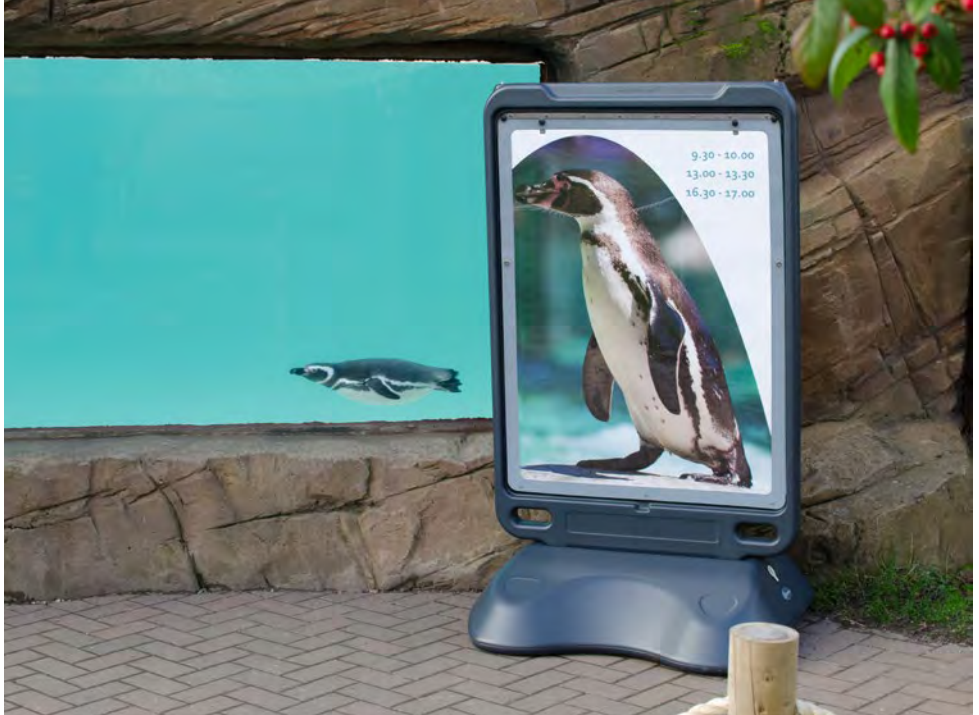
Advocate™ Poster Display Sign

Great for leisure facilities, these site sign carriers and storage bunkers are the ideal way to promote your brand. The Everwood™ material of Glasdon Gateway will not warp or rust and the poster display sign can be easily cleaned. The Nova™ Storage Bunker is designed to offer a large storage capacity and customisable shelving, providing optimal display space.