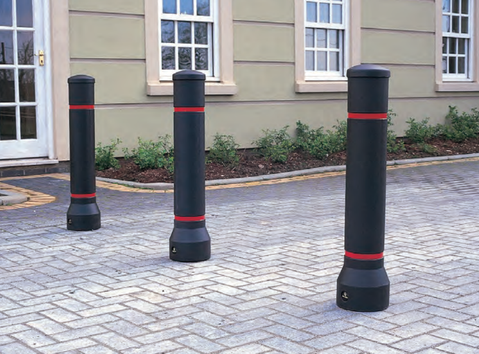
Neopolitan™ 20 Bollard

Our Bollards and Posts are available in a variety of traditional or modern styles and can be used for access control, verge protection and delineators to identify parking restrictions.