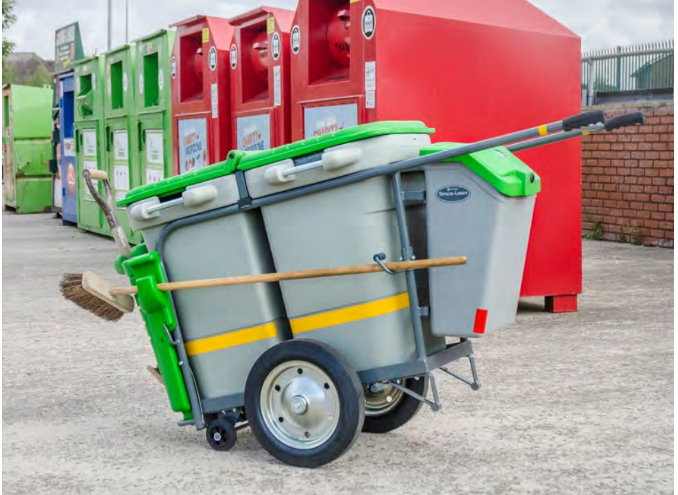
Space-Liner™ Orderly Barrow (Double Model)

Collect, segregate and transport waste quickly and efficiently with multi-purpose street cleaning barrows and litter picking tools. We produce a range of litter collection tools ideal for keeping your environment litter free. Our Orderly Barrows can be used for litter collection and segregation of waste or for transporting equipment.