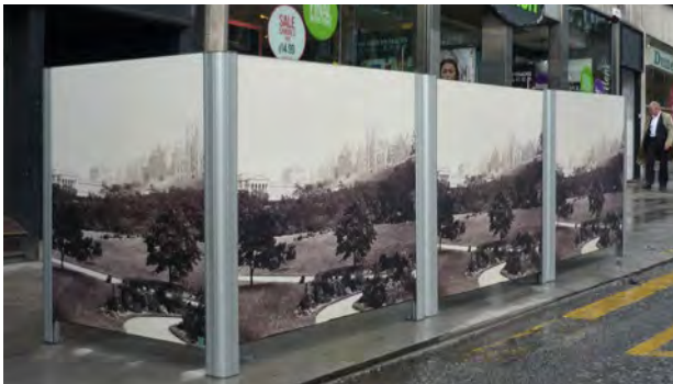
Visage™ Screen System