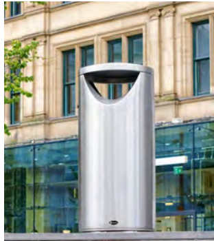
Centrum™ Litter Bin