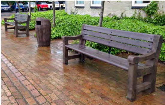
Elwood™ Seat and Sherwood™ Hooded Litter Bin