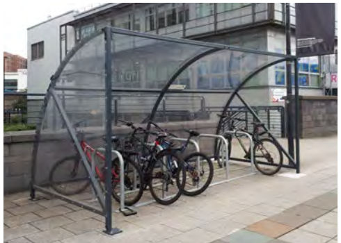
Echelon™ Cycle Shelter with Cycle Toast Rack