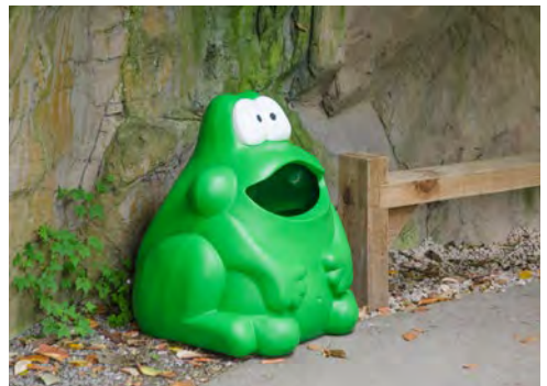
Froggo™ Litter Bin