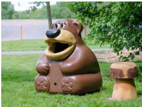
TidyBear™ Litter Bin