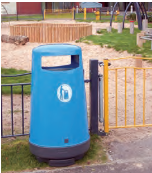
Topsy 2000™ Litter Bin