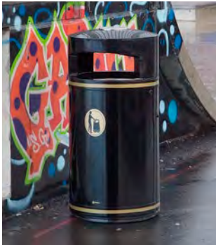
Metal Chieftain™ Litter Bin