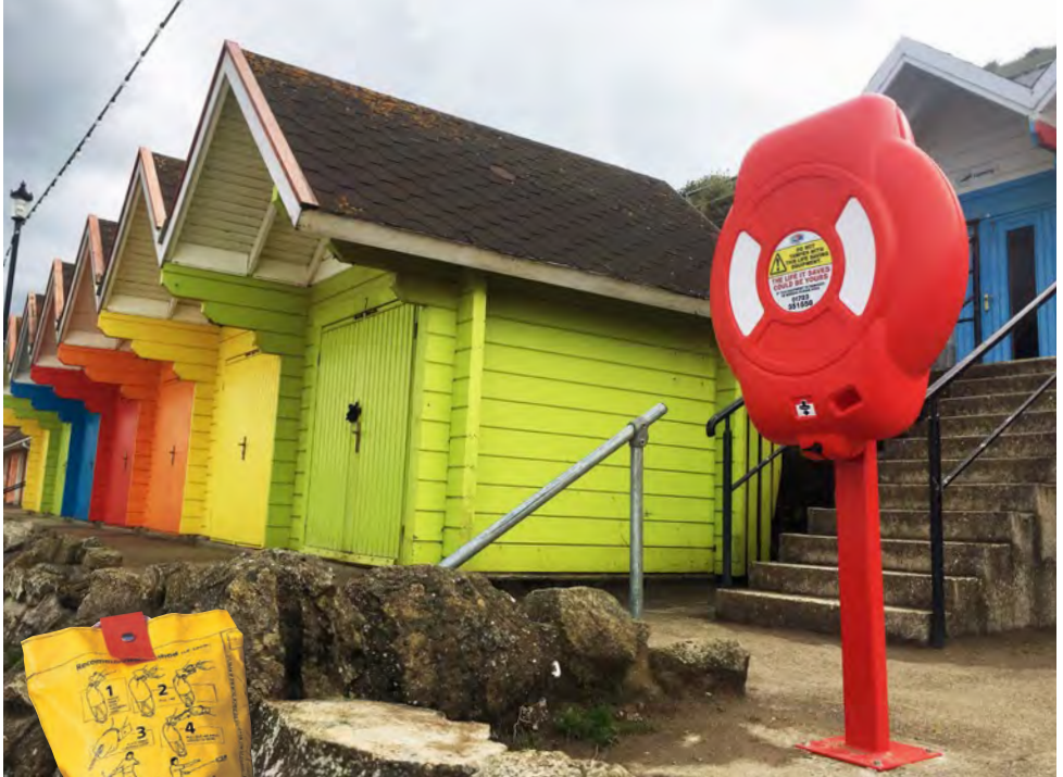
Guardian™ Lifebuoy Housing

Glasdon is a market leader in the manufacture and supply of life-saving water safety equipment. The range includes 24" and 30" lifebuoys with 30m and 50m throwing ropes, lifebuoy housing units, the B-Line™ throw line rescue buoy, and equipment storage units.