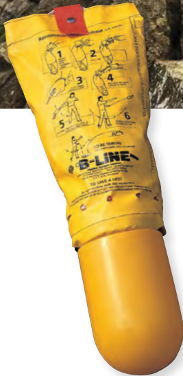
B-Line™ Water Rescue Device