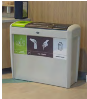
Nexus® Evolution Cup Recycling Station