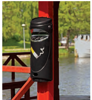
Ashmount SG™ Cigarette Bin