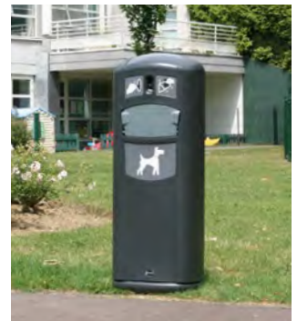
Retriever City™ Dog Waste Bin

Read our FAQ on the website about how to choose a dog waste bin.