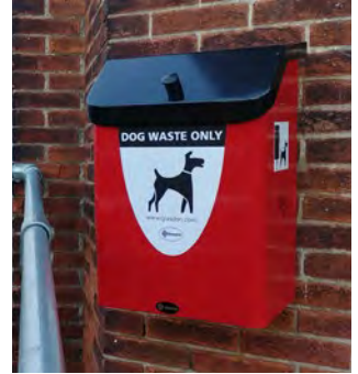
Metal Fido 35™ Dog Waste Bin