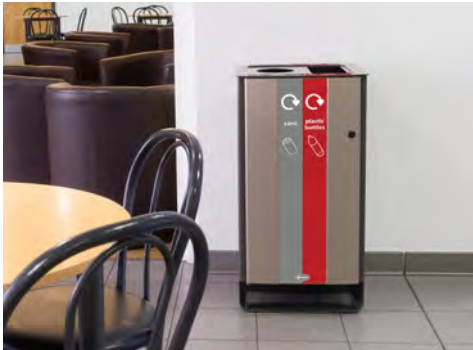
Electra™ 85 Duo Recycling Bin