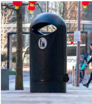
Elipsa™ Litter Bin