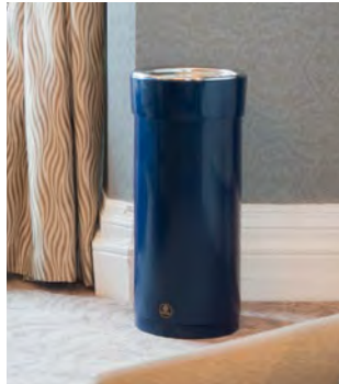
Senior Ambassador™ Litter Bin