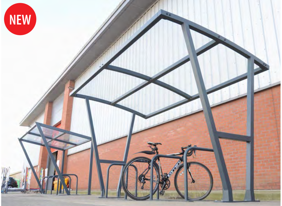
NEW Strada™ Cycle Shelter

With models suitable for both bicycle and motorbike storage, our shelters can be neatly placed in car parks or beside buildings to offer covered bike storage. Bike stands are also available when a smaller option is required.