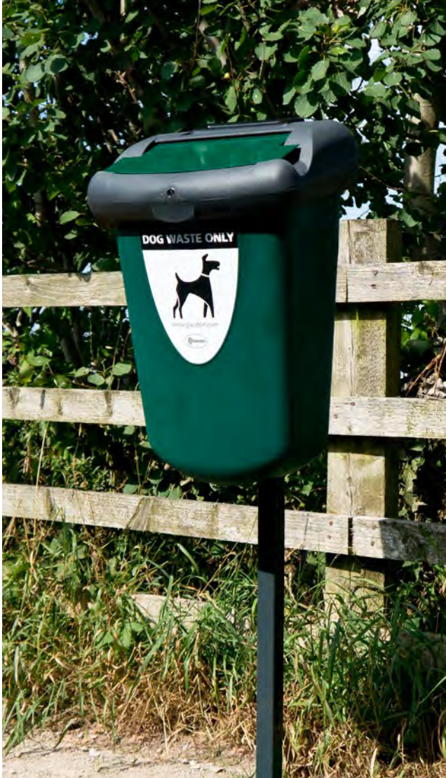
Retriever 35™ Dog Waste Bin

To help keep pavements and open spaces clear of dog fouling, we produce a range of dog waste bins that are extremely strong and durable. Designed to be wall- or post-mounted, these dog waste bins will encourage owners to tidy up after their dogs, keeping areas clean and tidy.