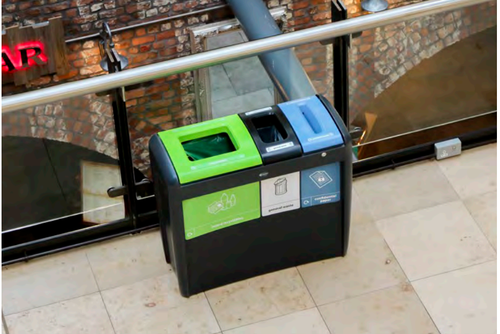
Nexus® Evolution Trio Recycling Bin

Apertures and graphics are available for various waste streams, allowing you to manage recycling waste more effectively.