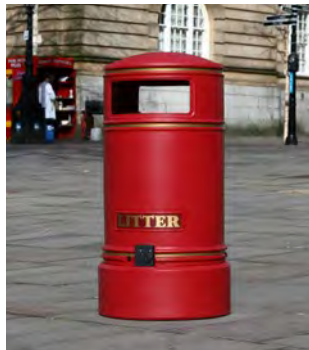
Topsy Jubilee™ Litter Bin