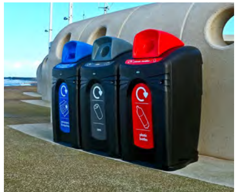
Nexus® City 240 Recycling Bin