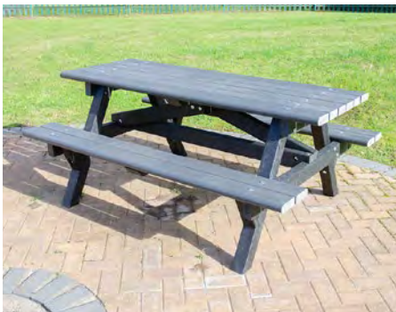
Clifton™ Picnic Table