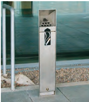
Ashguard™ Cigarette Bin