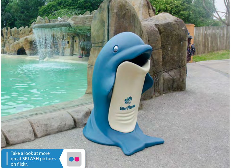
Splash™ Litter Bin

We produce a range of novelty bins, ideally suited for both indoor and outdoor spaces. The bright use of colours and interaction encourage and educate children about the importance of collecting waste.