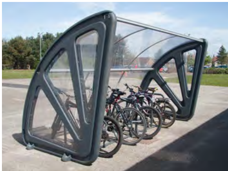
Aero™ Cycle Shelter