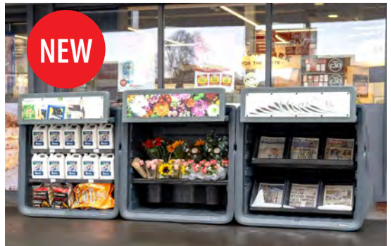
NEW Nova™ Storage Bunker