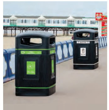
Glasdon Jubilee™ 240 Wheelie Bin Housing