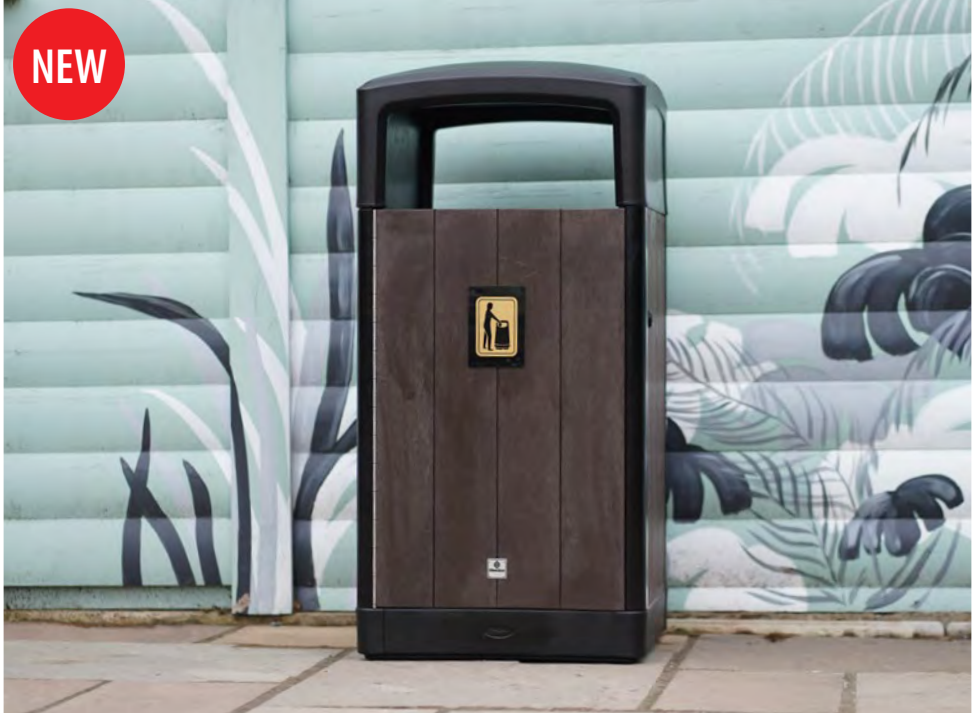
NEW Origin™ Curve 110 Litter Bin

We recognise that waste management requirements may completely differ from one organisation or setting to another. That's why we supply a variety of litter bins that will suit all styles, budgets and requirements. All of our litter bins are easy to clean and never need painting, giving you an attractive and highly functional waste container for many years.