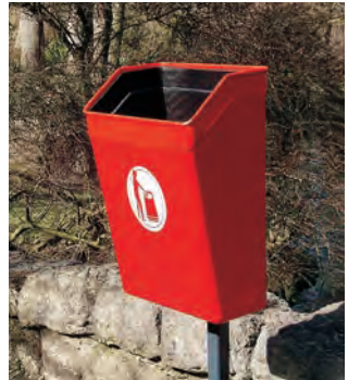
Trimline 25™ Litter Bin