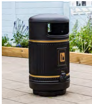
Topsy Royale™ Litter Bin