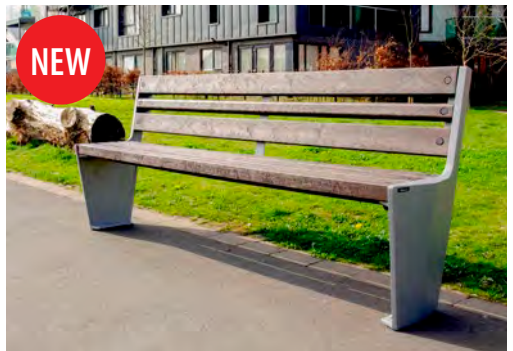
NEW Vistra ™ Seat

Visit our website for wheelchair access picnic tables