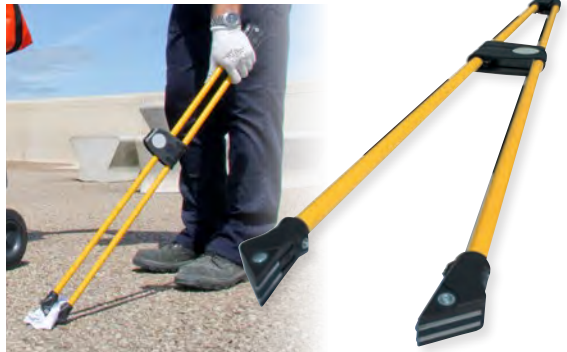
Litta-Pikka™ Collection Tool