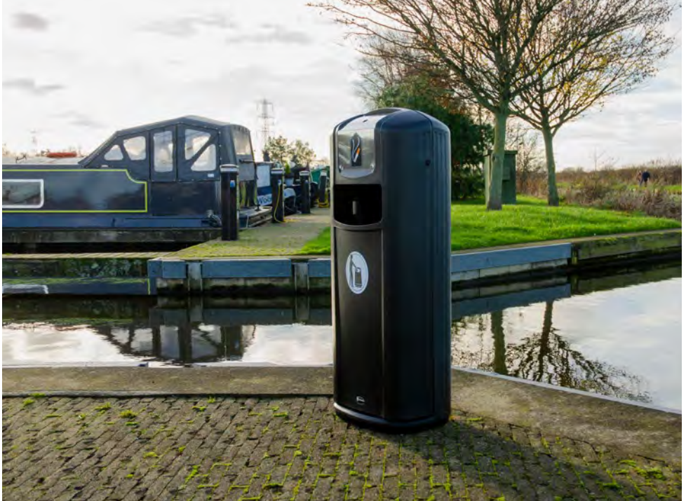
Integro City™ Cigarette & Litter Bin

We're here to help you keep cigarette waste under control on your premises with a wide range of quality, hard-wearing smoking bins. The Glasdon collection offers everything from free-standing ashtrays and cigarette bins to wall-mounted ashtrays.