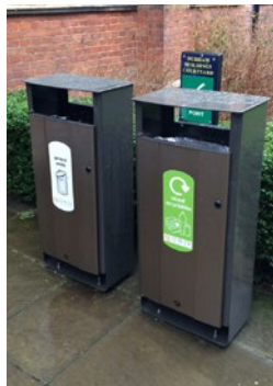
Electra™ 60 Recycling Bin