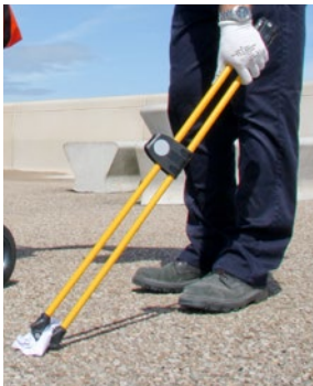
Litta-Pikka™ Collection Tool

We produce a range of litter collection tools, ideal for keeping your environment litter free. Our Orderly Barrows can be used for litter collection and segregation of waste or for transporting equipment.