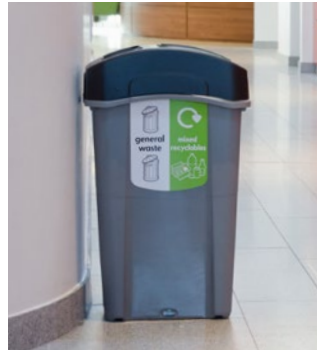
Eco Nexus® 85 Duo Recycling Bin