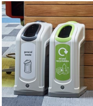
Nexus® 50 Recycling Bin