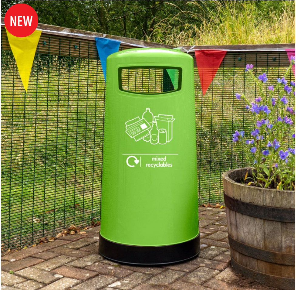
NEW Topsy™ 65 Recycling Bin