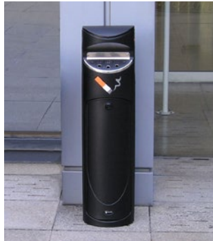
Ashguard SG™ Cigarette Bin