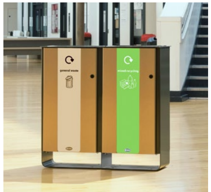
Electra™ 170 Duo Recycling Bin