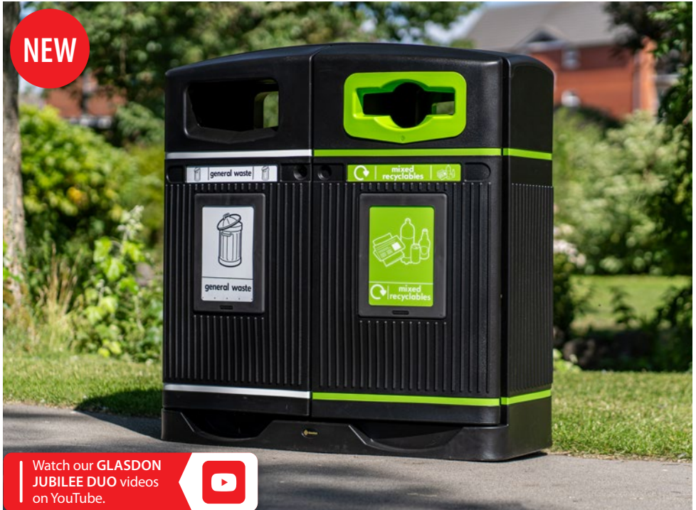
NEW Glasdon Jubilee™ Duo Recycling Bin

We produce an extensive range of outdoor recycling bins of the highest quality in both traditional and contemporary designs. All of our recycling containers are designed to be hard-wearing and long-lasting and feature easily identifiable graphics to make recycling easy.