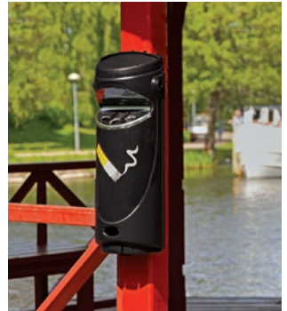
Ashmount SG™ Cigarette Bin