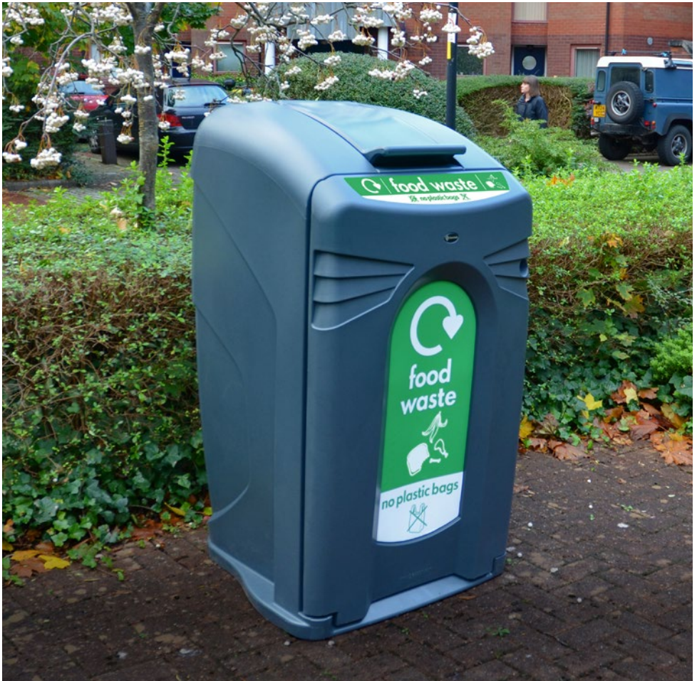
Nexus® City 240 Food Waste Recycling Bin