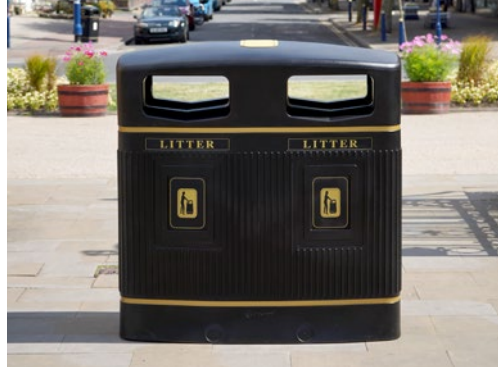
NEW Glasdon Jubilee Duo™ 220 Litter Bin