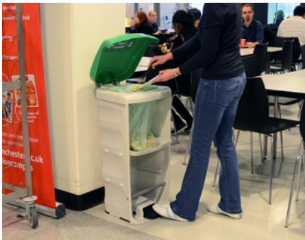
Nexus® Shuttle Food Waste Bin