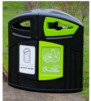
Nexus® 200 Recycling Bin