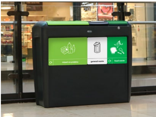
Nexus® Evolution Trio Recycling Bin

Boost recycling rates with Glasdon internal recycling bins. With a variety of attractive styles and manufactured with high quality materials, we can help you create an effective recycling programme for your environment. Apertures and graphics are available for various waste streams, allowing you to manage recycling waste more effectively.