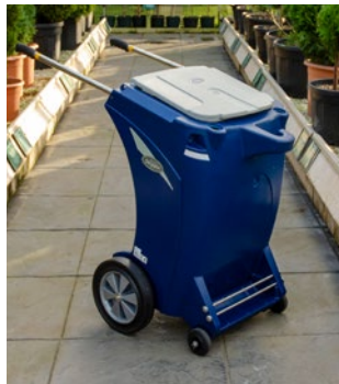
Skipper™ Multi-Purpose Cleaning Trolley