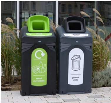
Nexus® City 140 Recycling Bin