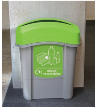
Eco Nexus® 60 Recycling Bin