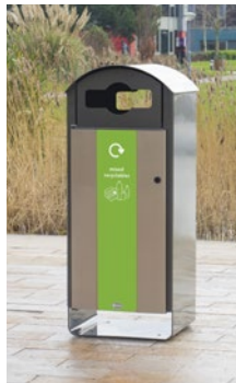
Electra™ Curve 60 Recycling Bin