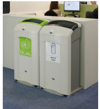
Nexus® 100 Recycling Bin