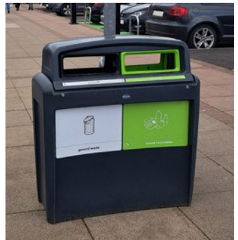
Nexus® Evolution City Duo Recycling Bin