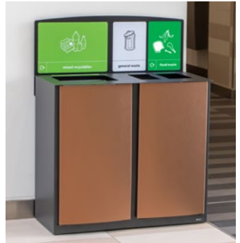
Nexus® Style 170 Trio Recycling Bin