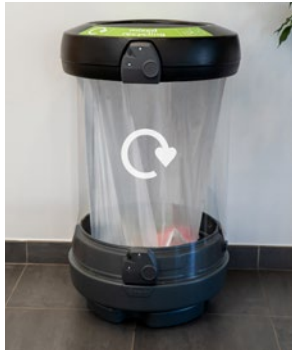
C-Thru™ 180 Recycling Bin