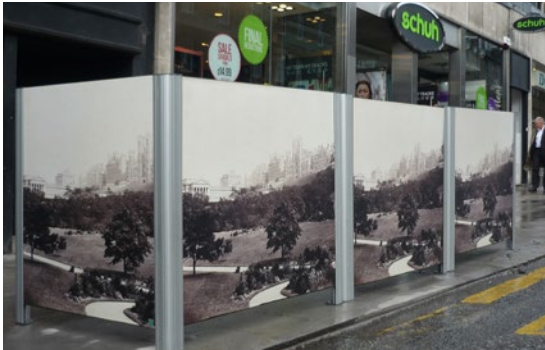
Visage™ Screen System