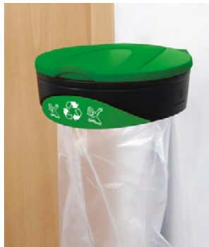
Orbis™ Food Waste Recycling Bin