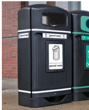
Streamline Jubilee™ Recycling Bin