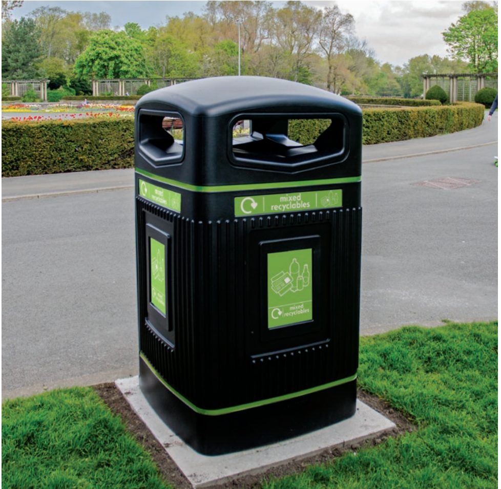
Glasdon Jubilee 240 Wheelie Bin Housing