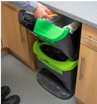
NEW Nexus® Stack Food Waste Recycling Bins