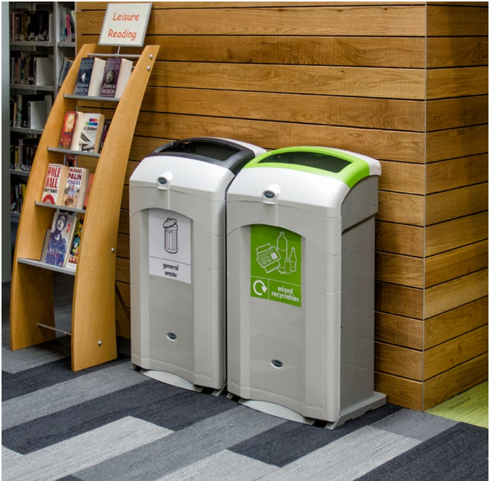
Nexus® 100 Recycling Bin