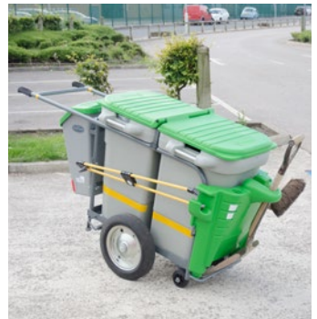
Space-Liner™ Orderly Barrow (Double Model)