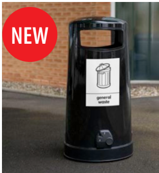
NEW Topsy™ 65 Recycling Bin