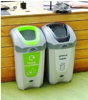
Nexus® 30 Recycling Bin