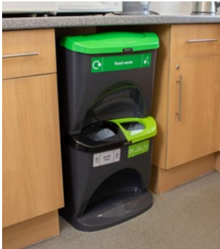
Nexus® Stack Recycling Bins