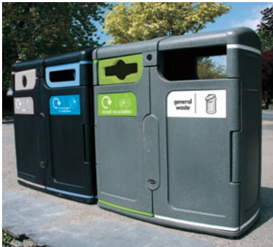
Gemini™ Recycling Bin