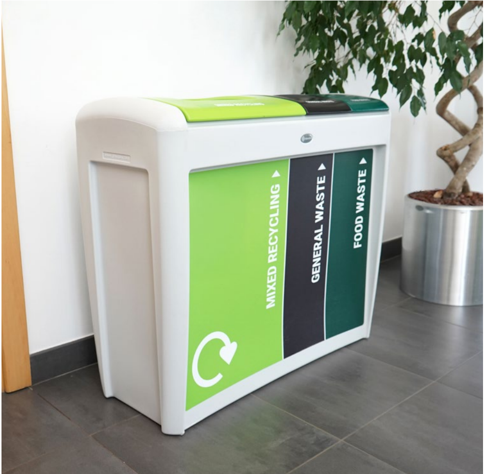
Nexus® Evolution Trio Recycling Bin