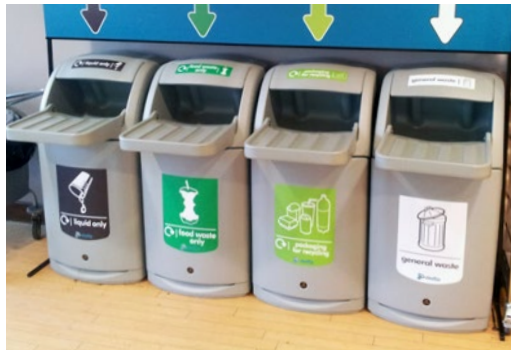
Combo™ Tray Shelf Catering Waste Bin