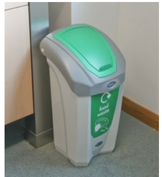
Nexus® 30 Food Waste Recycling Bin