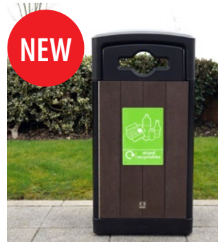
NEW Origin™ Curve 110 Recycling Bin