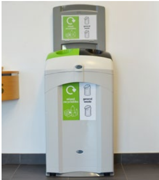
Nexus® 100 Duo Recycling Bin