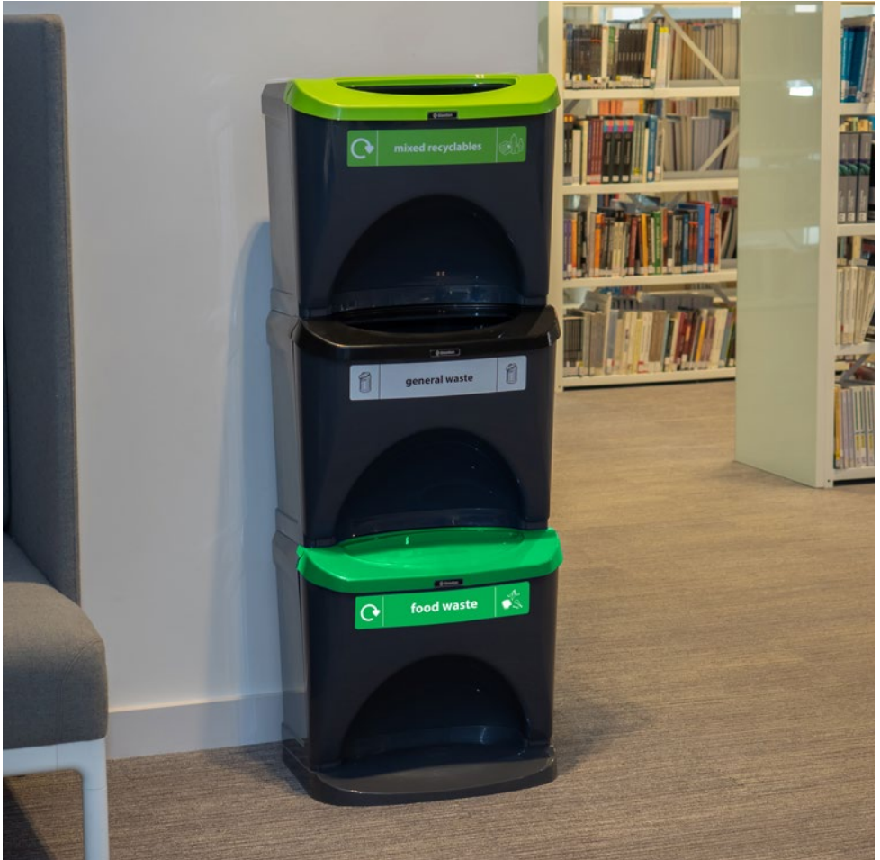
Nexus® Stack Recycling Bins