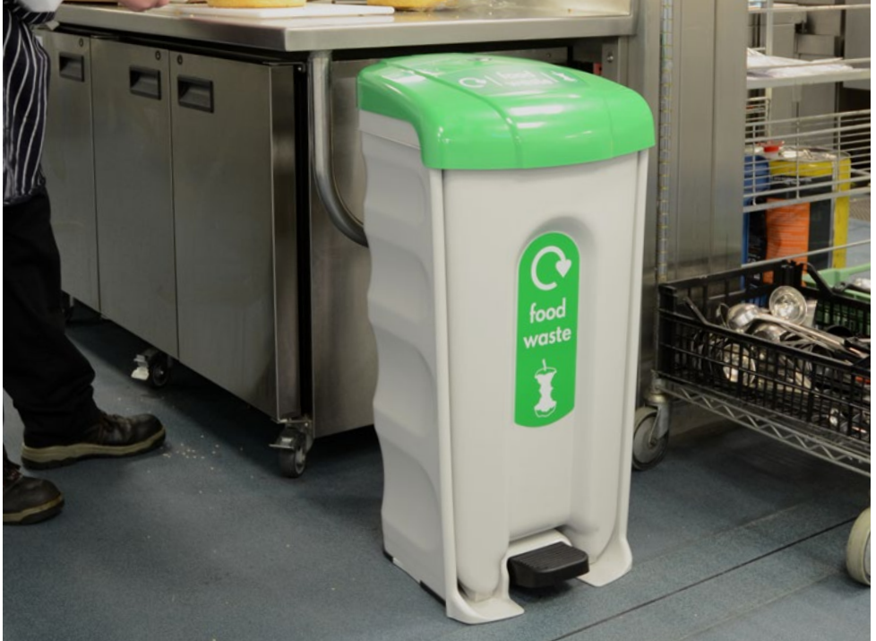
Nexus® Shuttle Food Waste Bin

With separate food waste collections becoming mandatory, businesses will need to invest in dedicated recycling bins for food waste. Our tailored food waste bins are specifically designed for food preparation and consumption areas. Featuring foot pedals and spacious openings, our bins ensure effortless and sanitary disposal of food waste.