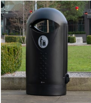
Elipsa™ Litter Bin