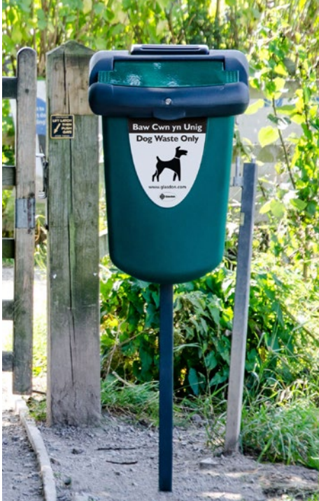
Retriever 35" Dog Waste Bin

At Glasdon, we have over 65 years' experience in designing and manufacturing market-leading street furniture and safety products. Discover how Glasdon's innovative solutions can help you create a cleaner, safer, and more sustainable environment. Visit our website today to explore our full range of products