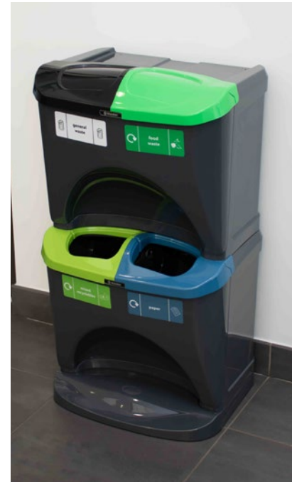
Nexus® Stack Recycling Bin

Find out more about the Nexus Stack 90, and discover our range of Nexus Stack configurations.