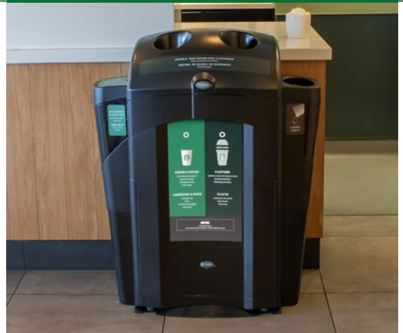
Nexus® 100 Duo Recycling Station