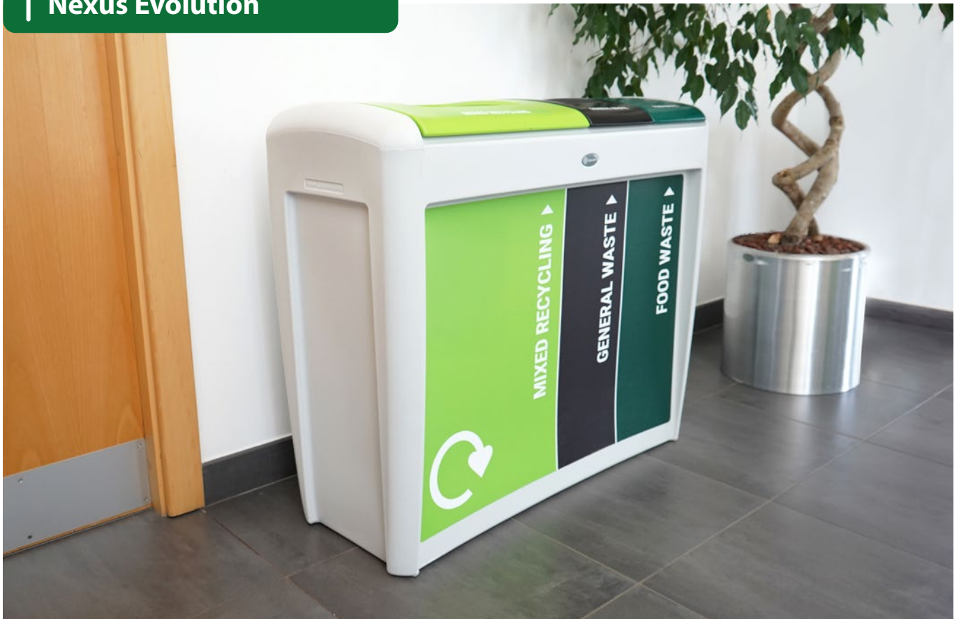
Nexus® Evolution Trio Recycling Station