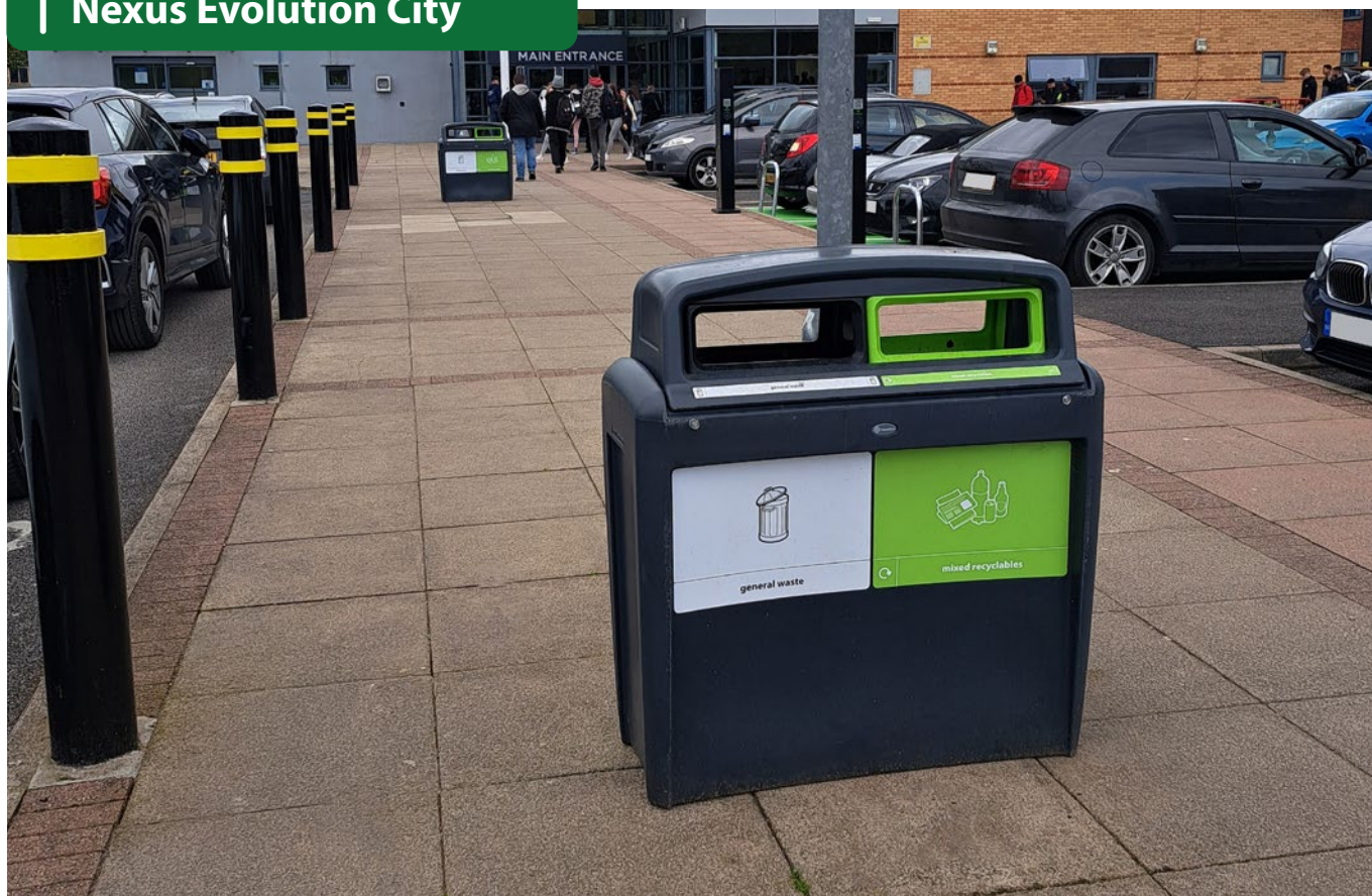
Nexus ® Evolution City Duo Recycling Bin

Find out more about the Nexus Evolution City