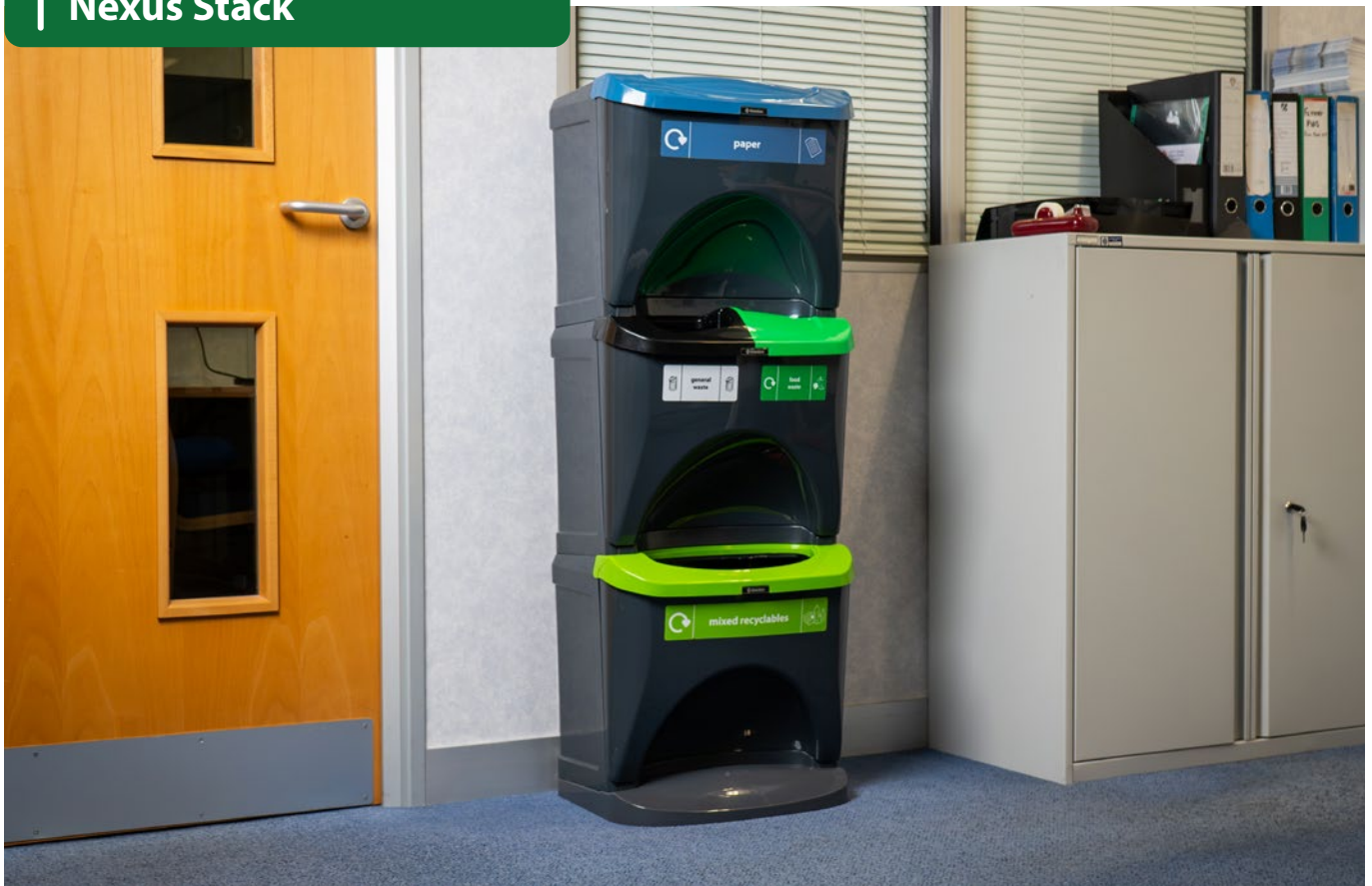
Nexus® Stack Recycling Bin