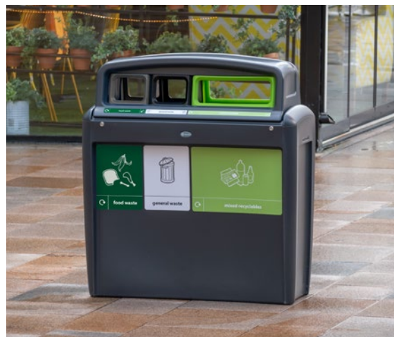
Nexus ® Evolution City Trio Recycling Bin

The Nexus Evolution City is available in a Duo, Trio and Quad option, with two, three and four compartments respectively.