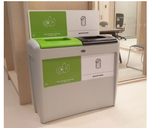
Nexus® Evolution Duo Recycling Bin

The Nexus Evolution is available in a Duo version with two, a Trio version with three and a Quad version with four compartments.