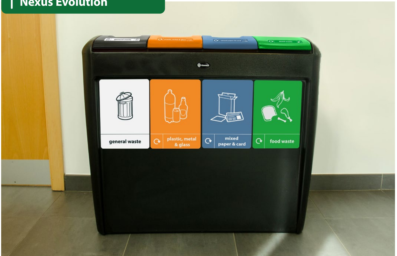
Nexus® Evolution Quad Recycling Station