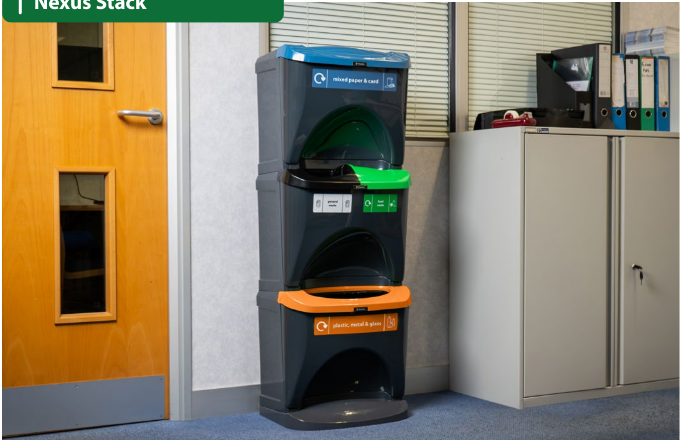
Nexus® Stack Recycling Bin