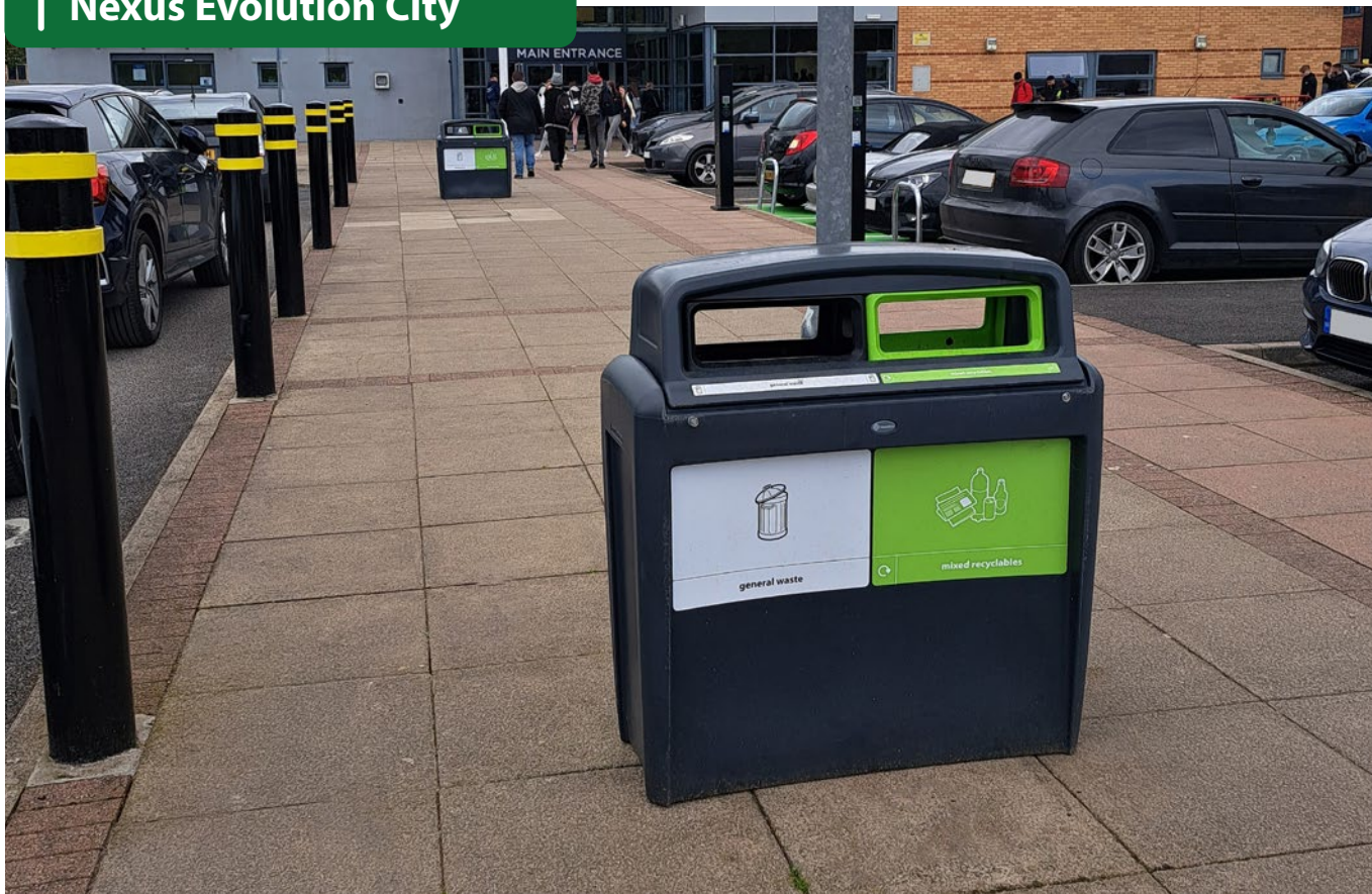
Nexus® Evolution City Duo Recycling Bin

Find out more about the Nexus Evolution City