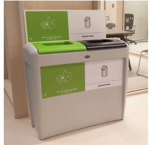
Nexus® Evolution Duo Recycling Bin

The Nexus Evolution is available in a Duo version with two, a Trio version with three and a Quad version with four compartments.