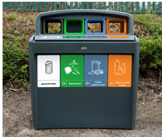
Nexus® Evolution City Quad Recycling Bin

The Nexus Evolution City is available in a Duo, Trio and Quad option, with two, three and four compartments respectively.