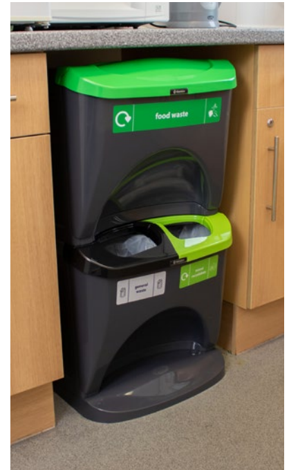
Nexus® Stack Recycling Bin

Find out more about the Nexus Stack 90, and discover our range of Nexus Stack configurations.