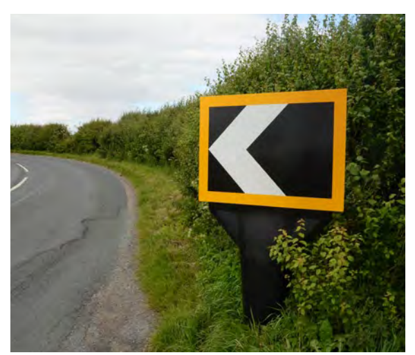
Apex<sup>™</sup> Chevron Sign