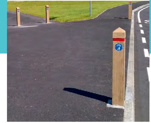
Glenwood<sup>™</sup> 150 Post